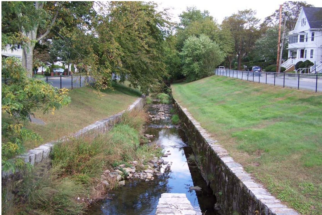
Cheesecake Brook Greenway looking east from Eddy Street