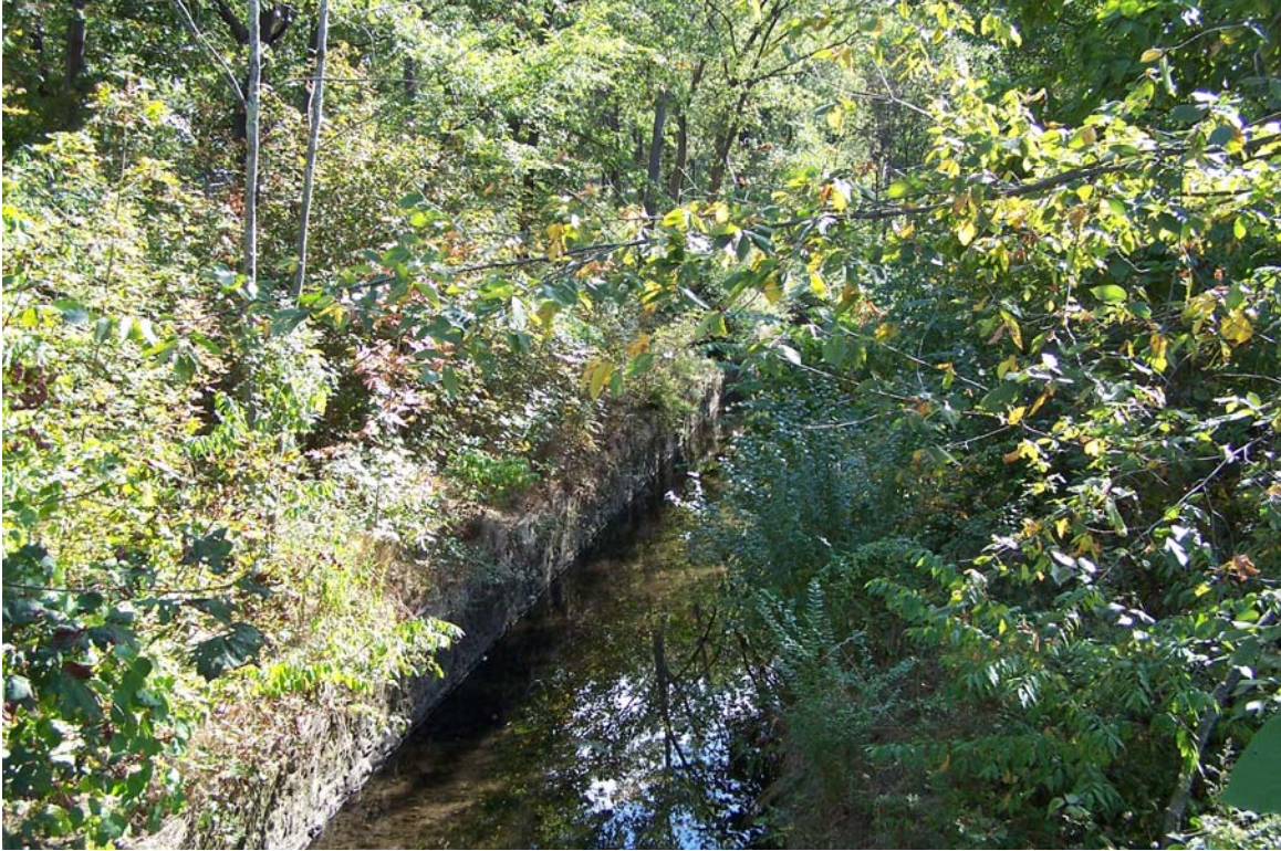
Cheesecake Brook Greenway looking west from Watertown Street