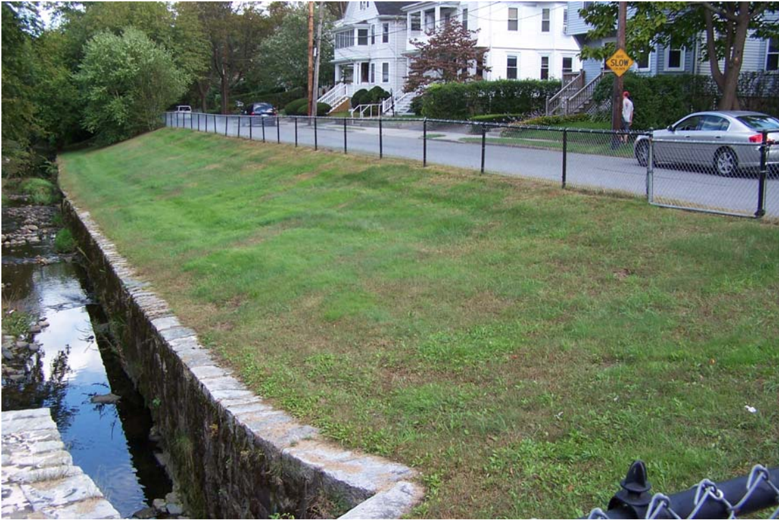
South slope of Cheesecake Brook Greenway near Eddy Street