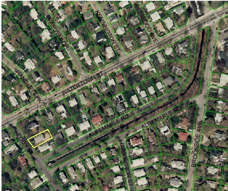
Aerial view of Cheesecake Brook Greenway