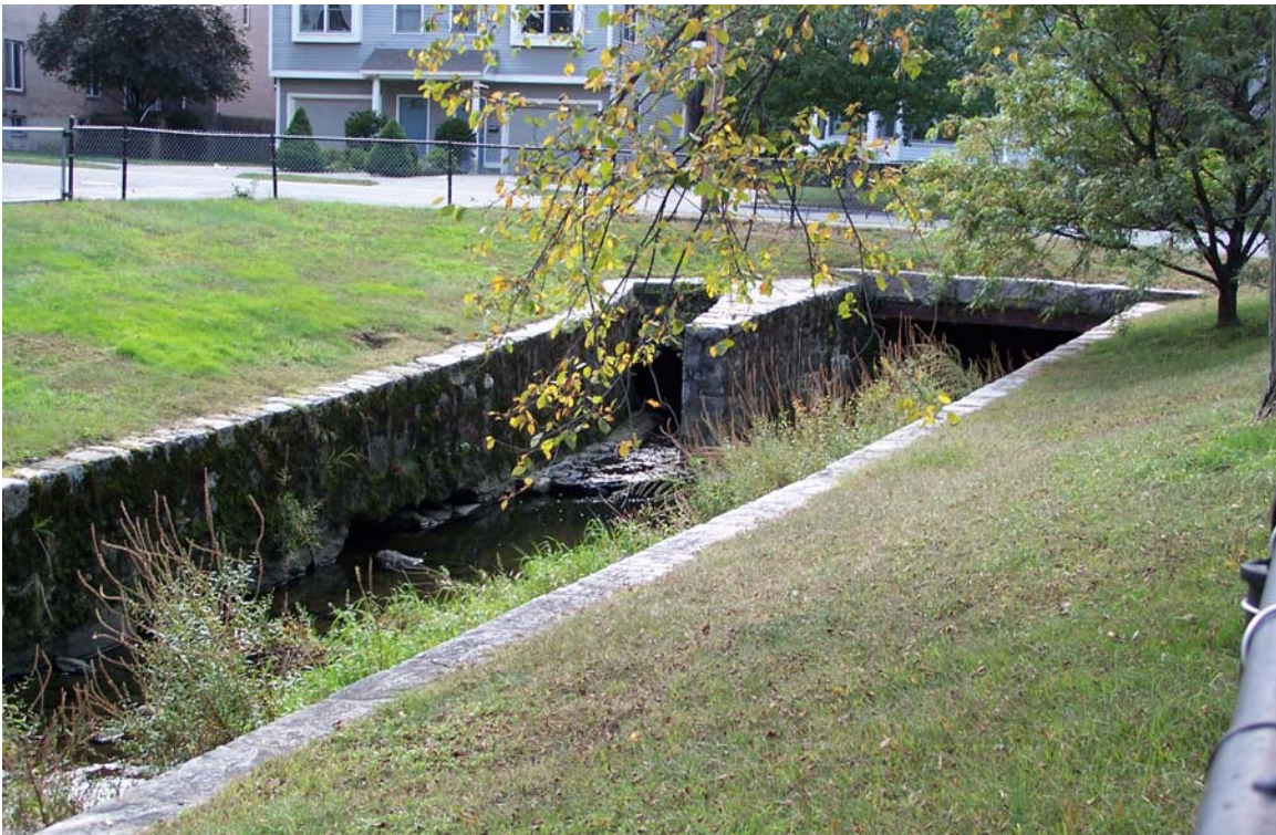
Eddy Street end of Cheesecake Brook Greenway