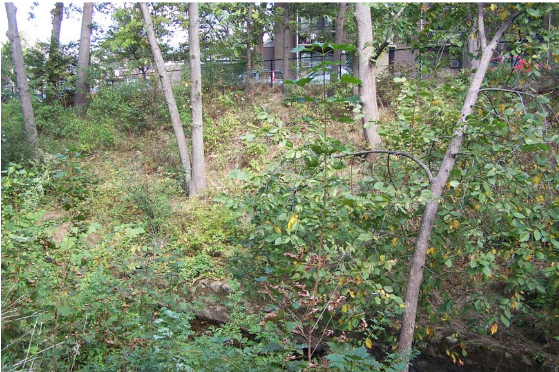
South slope of Cheesecake Brook Greenway near Watertown Street