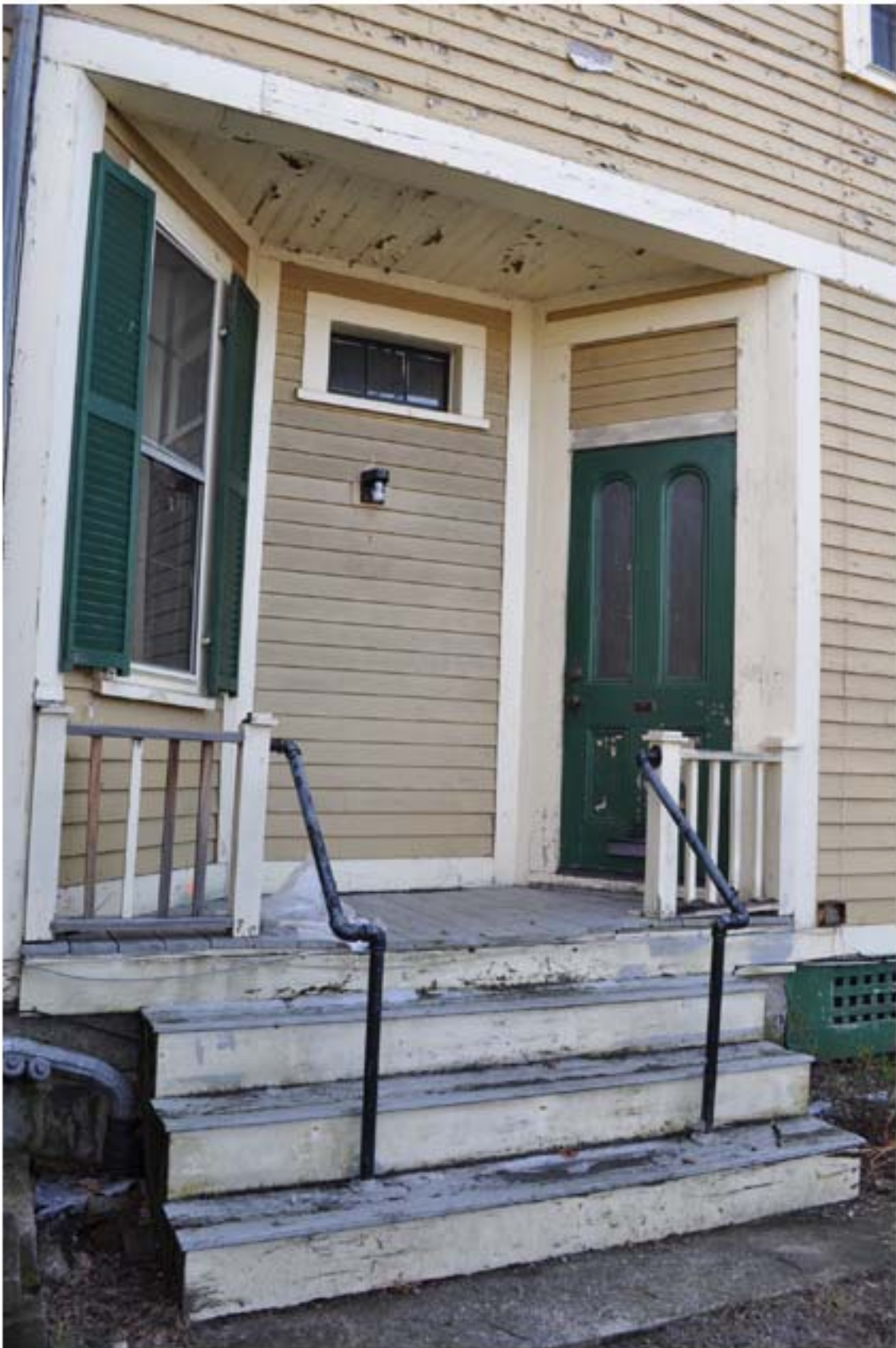
18A- Existing entrance porch and stairway on west side of house