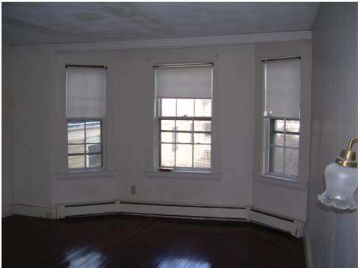
14A (Interior)- Existing double hung windows on second floor of east side of house