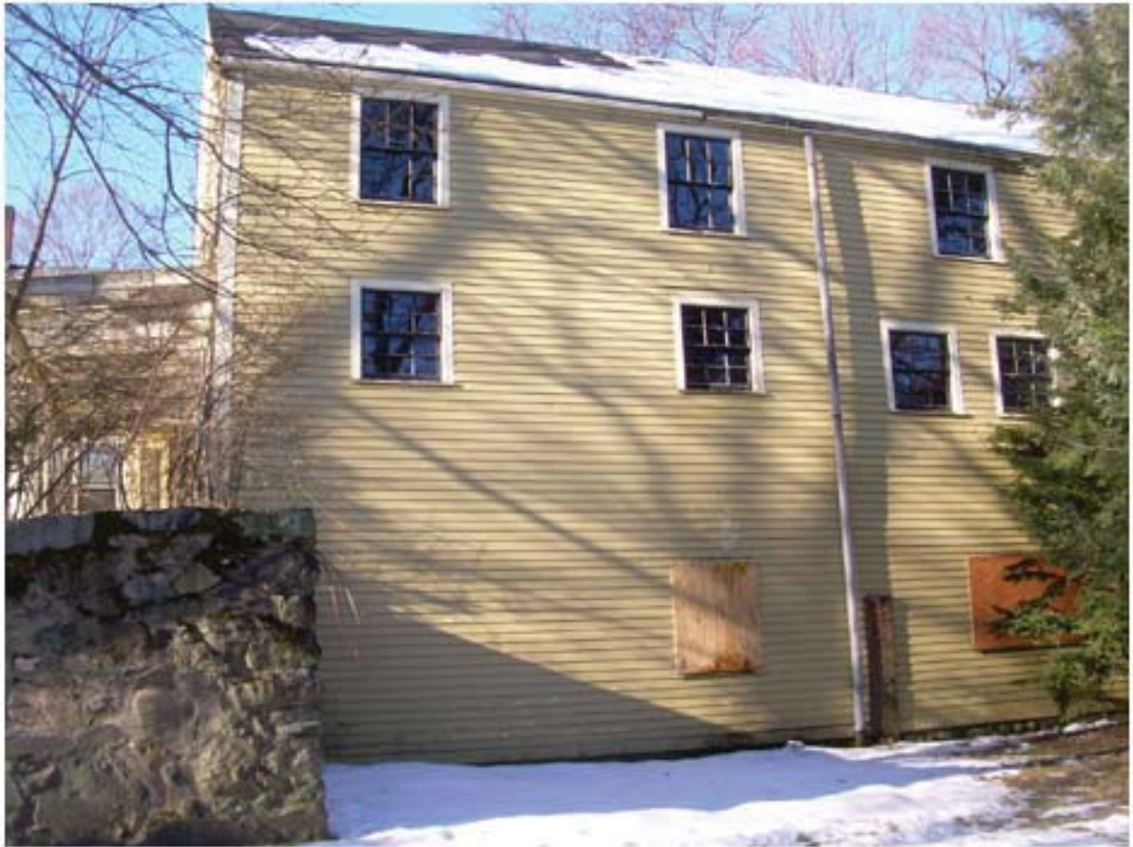
11A- Existing east side of barn