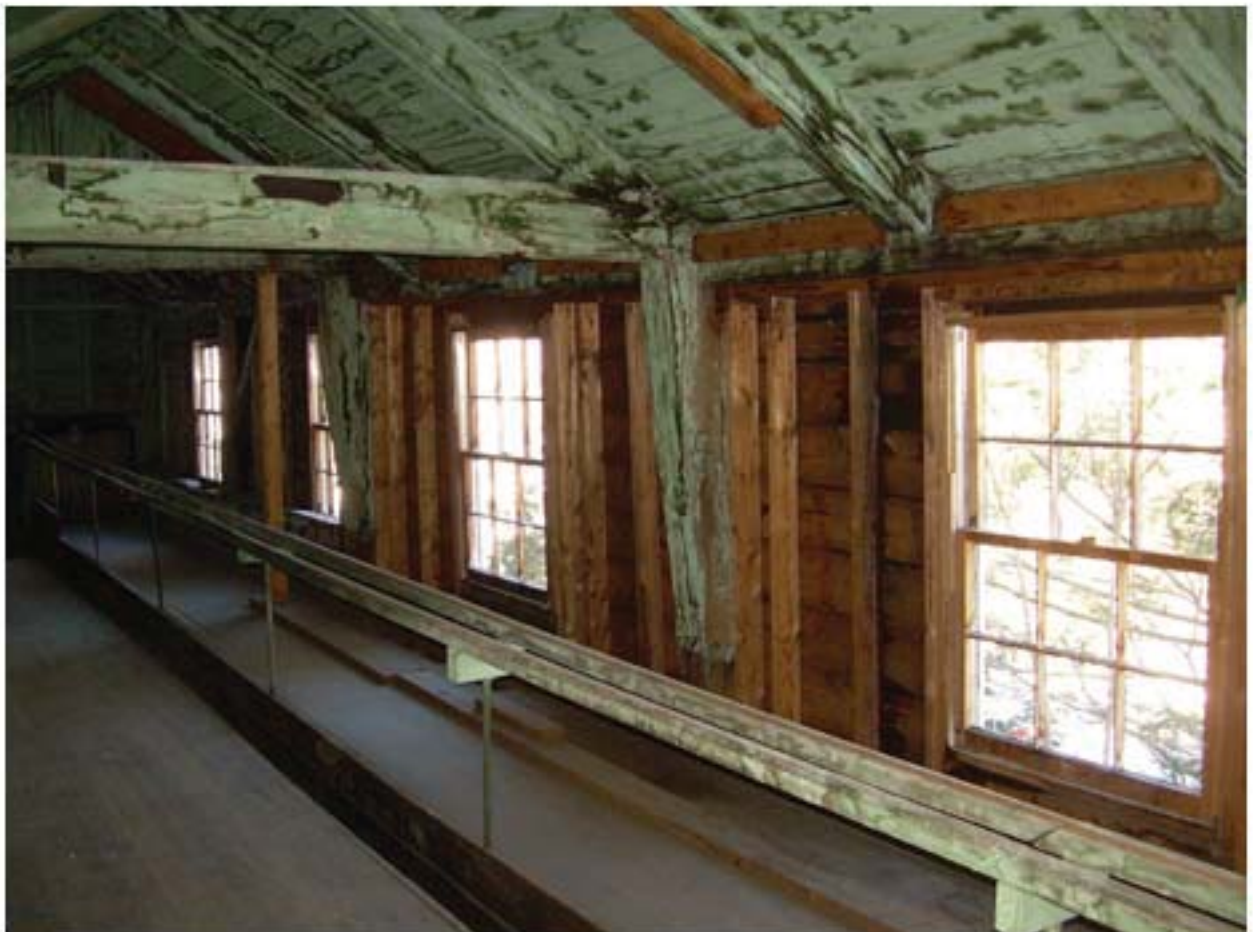
14B (Interior)- Existing double hung windows on second floor of east side of barn