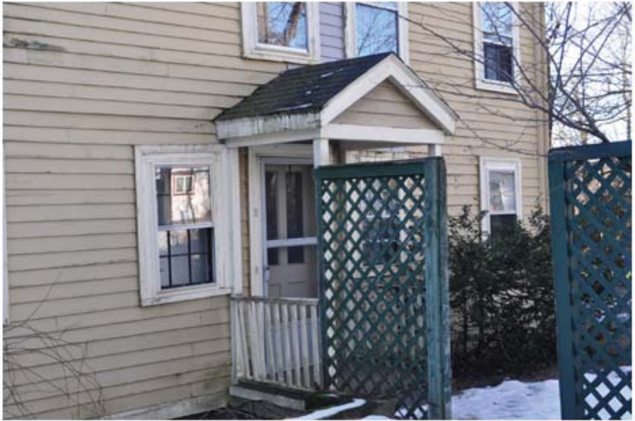
15F- Existing north house entrance door