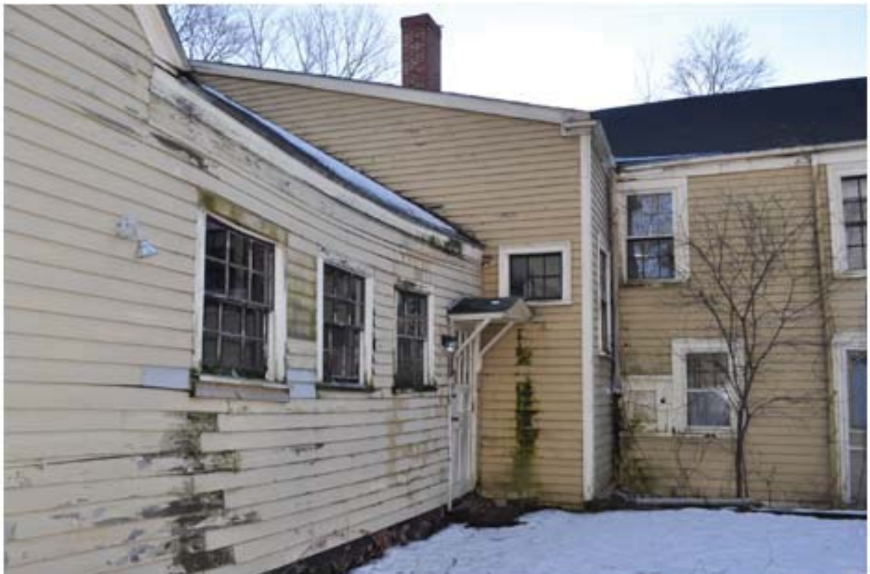
13B- Existing siding and water damage on west side of barn and north side of house