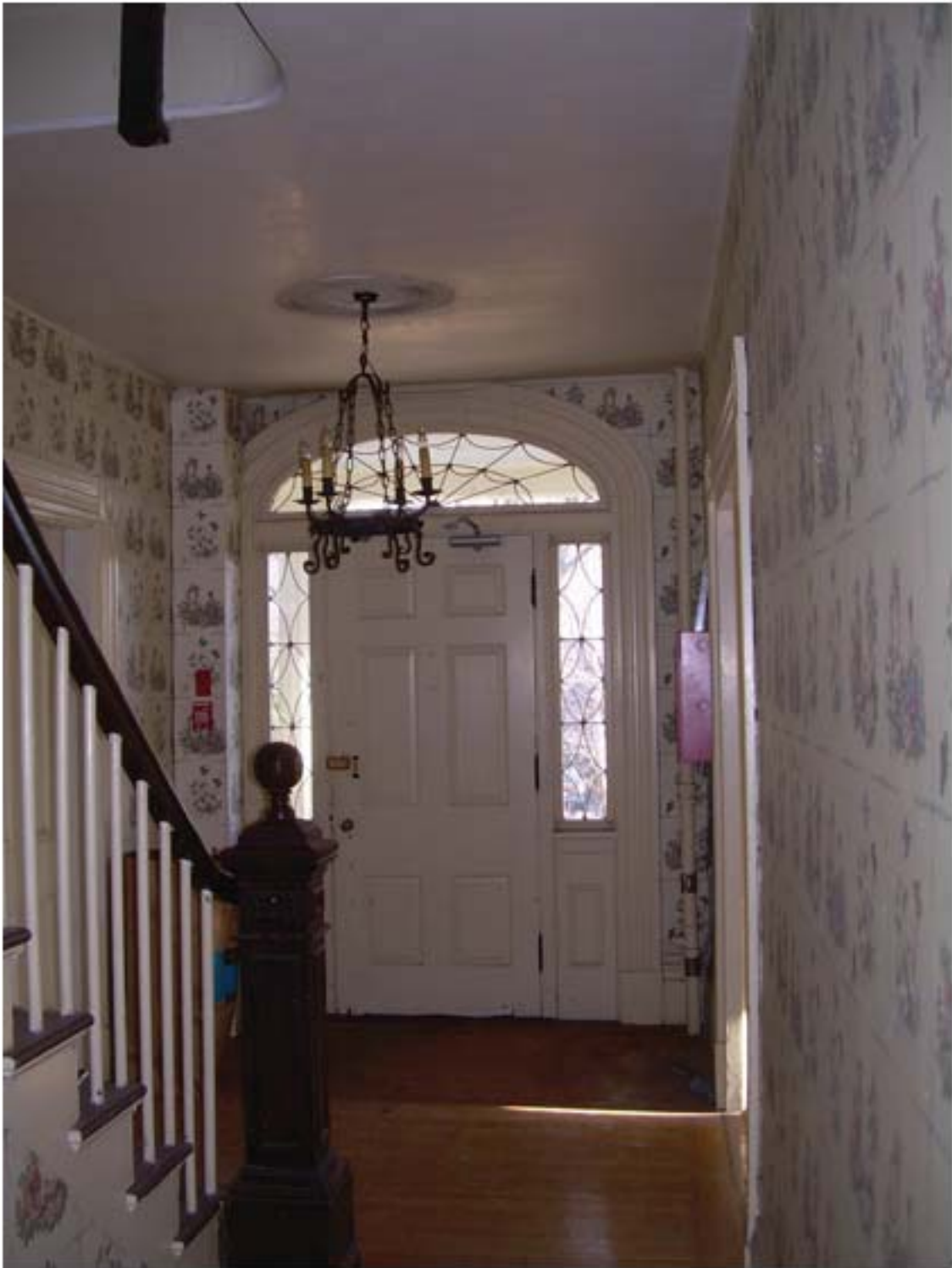
15A (Interior)- Existing east house egress door and sidelights