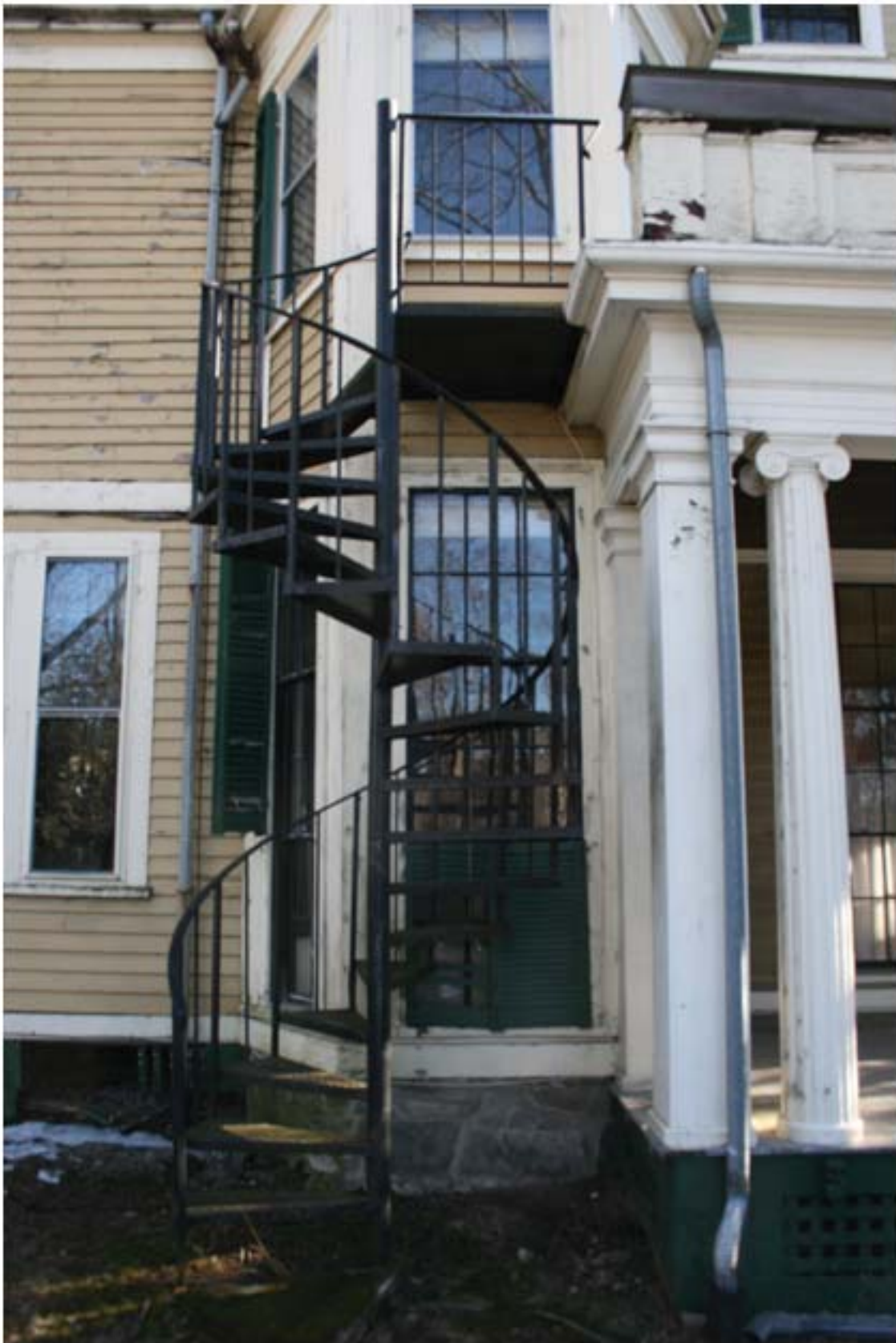
5B- Existing iron spiral stairway for one story porch on west side of house