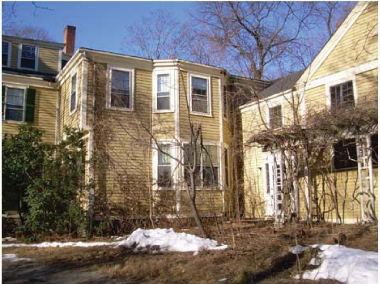
14A- Existing double hung wood windows on east side of house and south side of barn