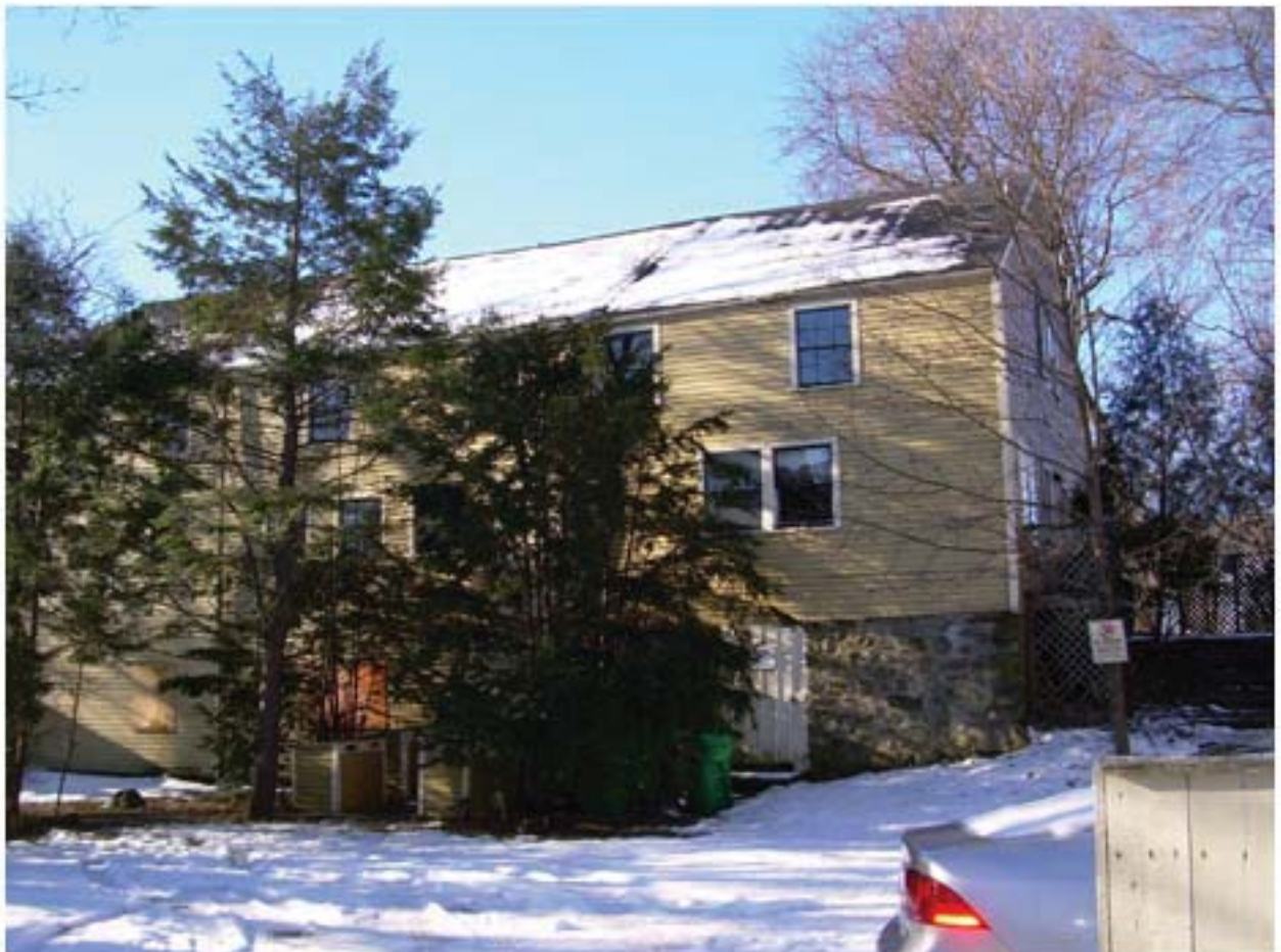
7B- Existing barn sloped gable roof with common three tab black asphalt shingles