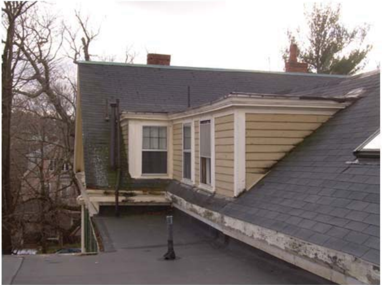
8C- Existing upper flat roof covered with black EPDM membrane roofing