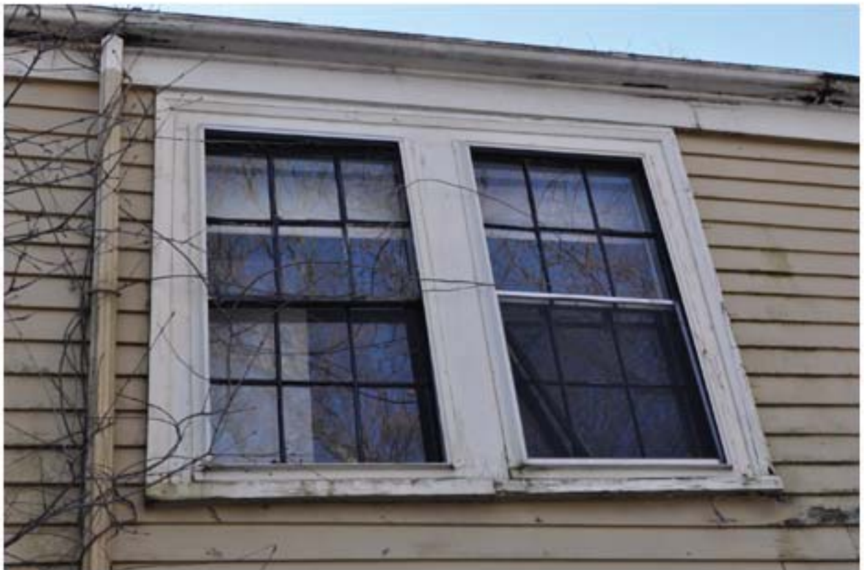
14D- Existing double hung wood window