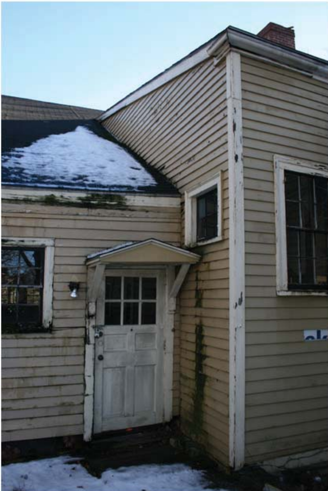
16D- Existing roofed stoop at west side of barn