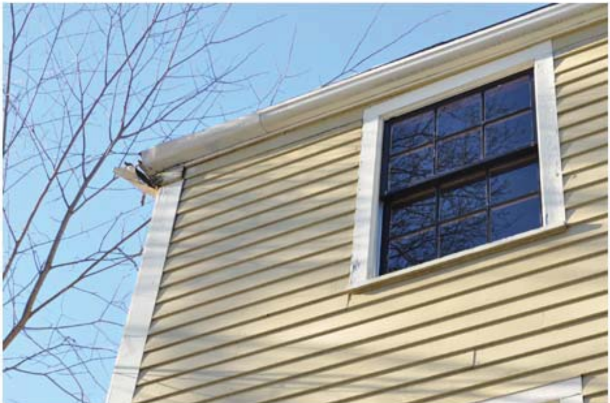
11B- Existing east side barn gutter, fascia and soffit