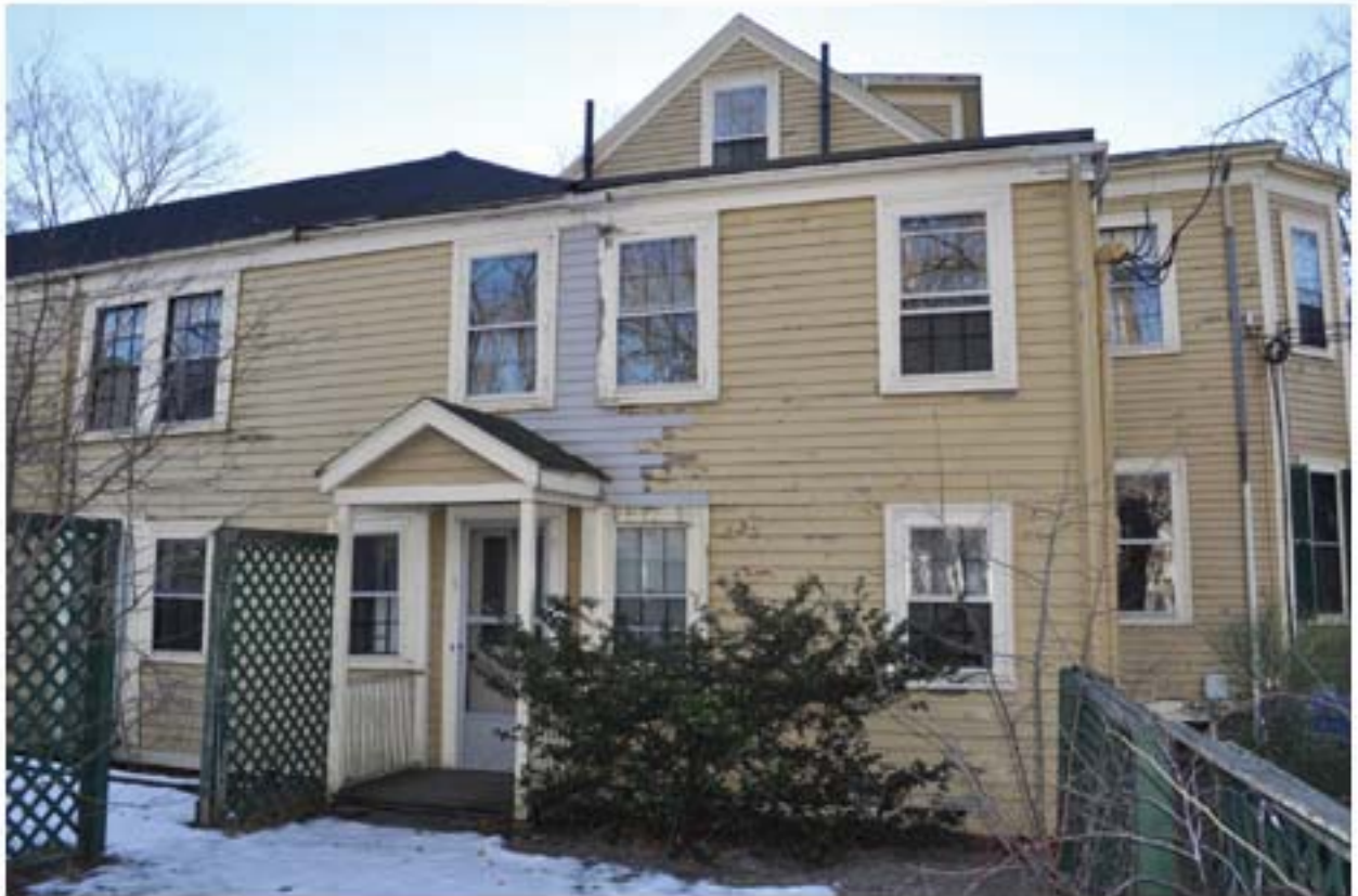
14C- Existing double hung wood windows on north side of house