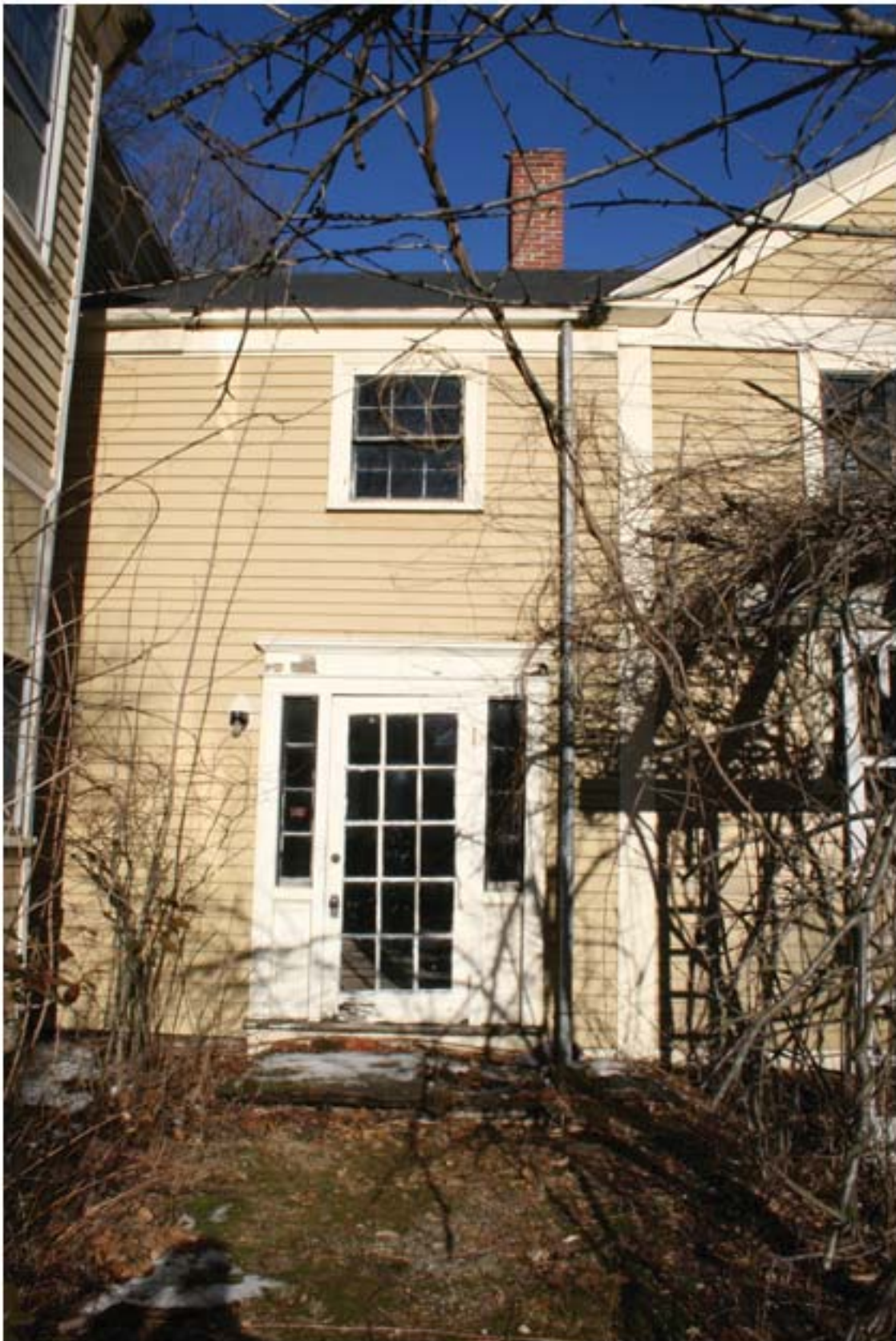
17A- Existing entrance at south side of barn