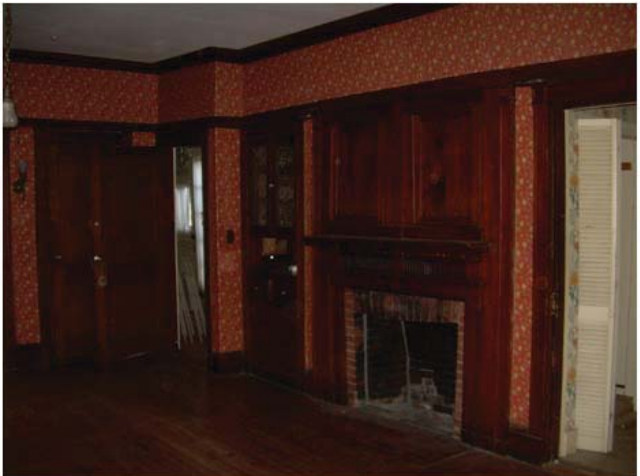
6B (Interior)- Existing house chimney