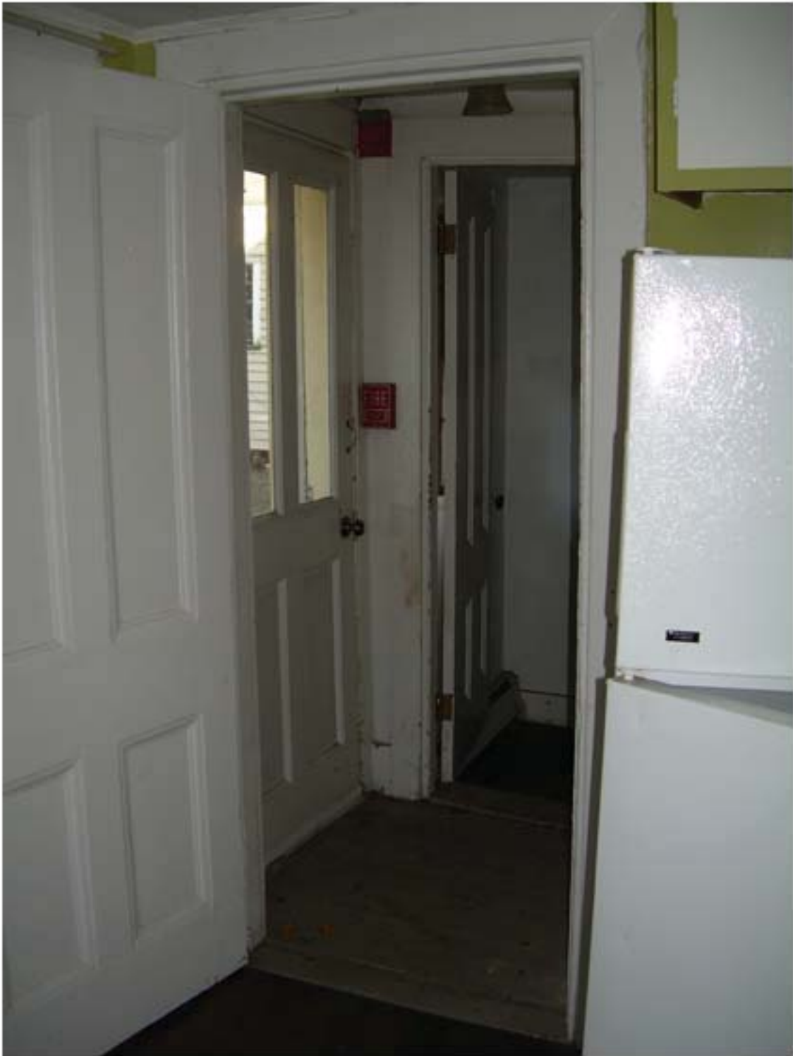
15F (Interior)- Existing north house entrance door