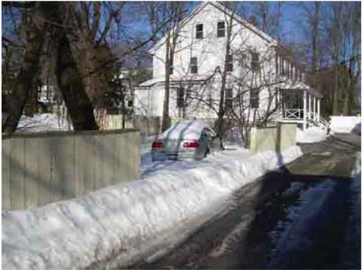
1A- Existing stained wood board fence along Columbus Place