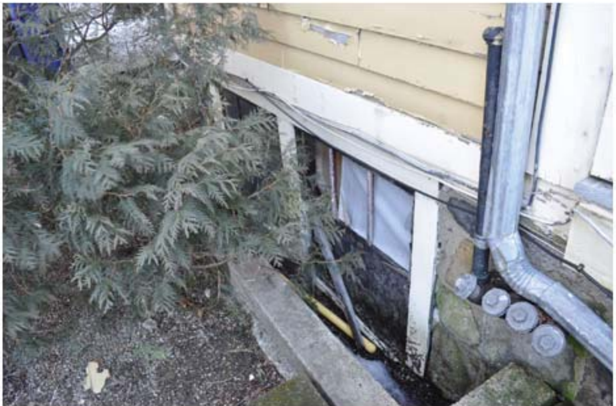
19B- Existing window well at west side of house