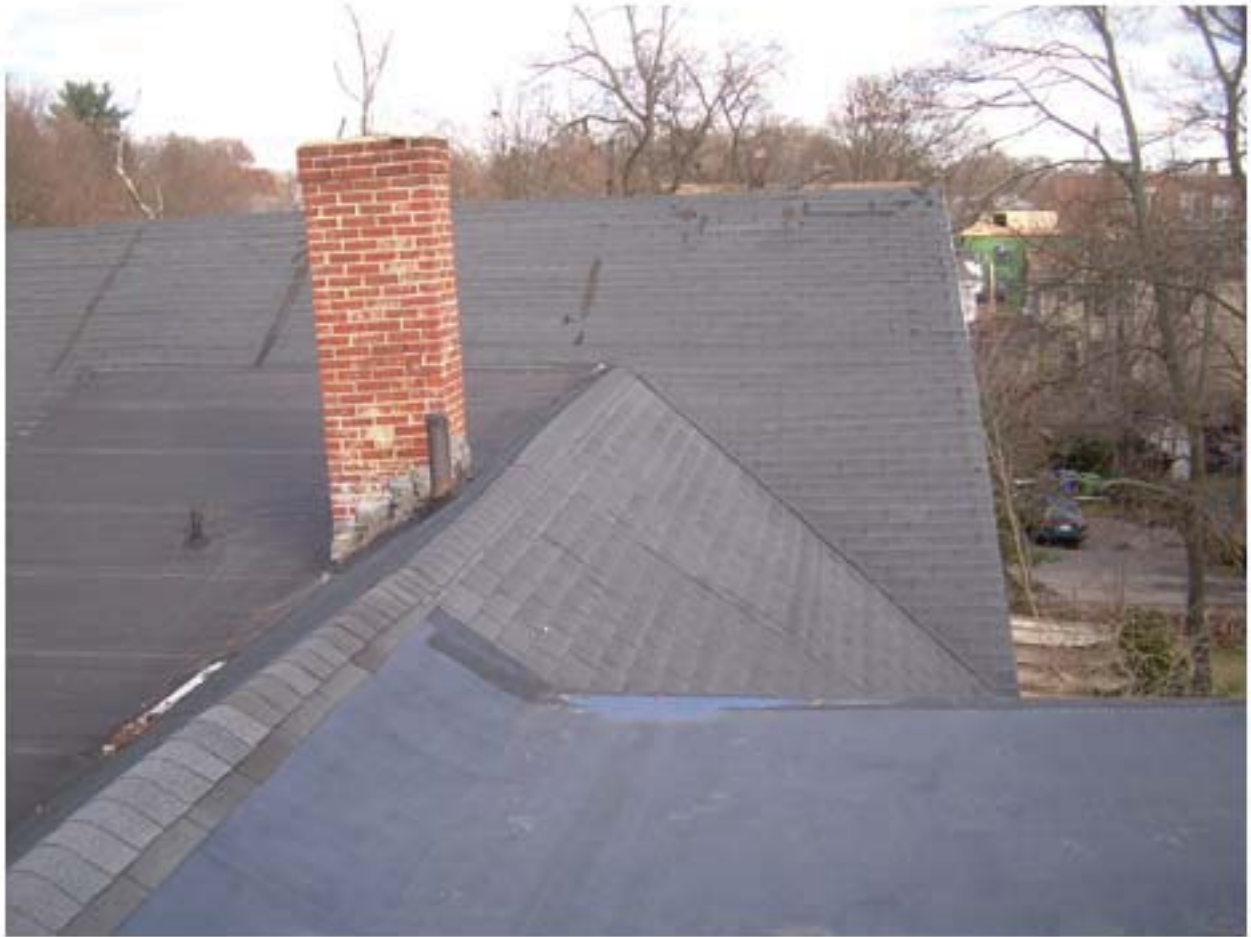
8A- Existing upper flat roof covered with black EPDM membrane roofing