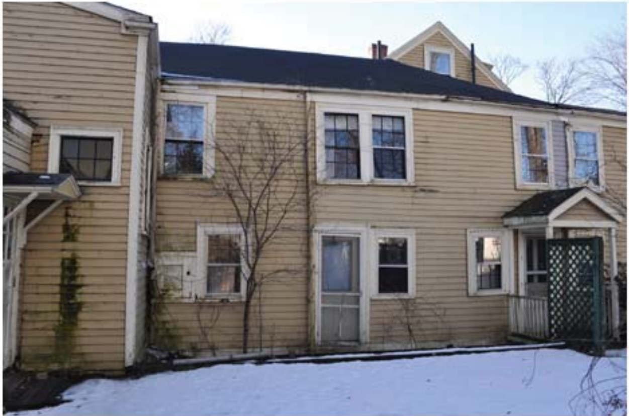
12C- Existing window trim, door trim, gable trim and frieze boards on north side of building