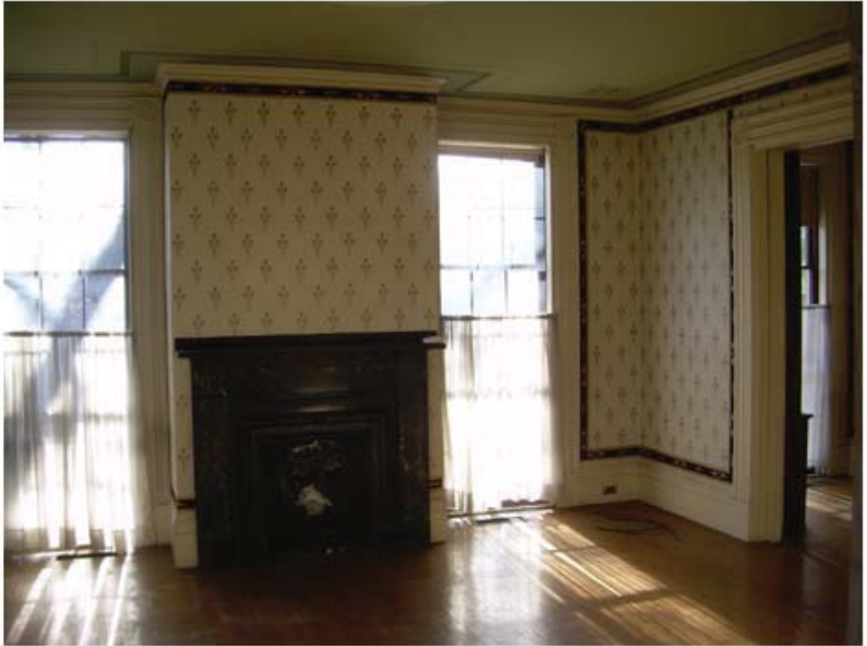
20C- Existing marble mantel, door casing, window trim, mop boards and wood parquet floors