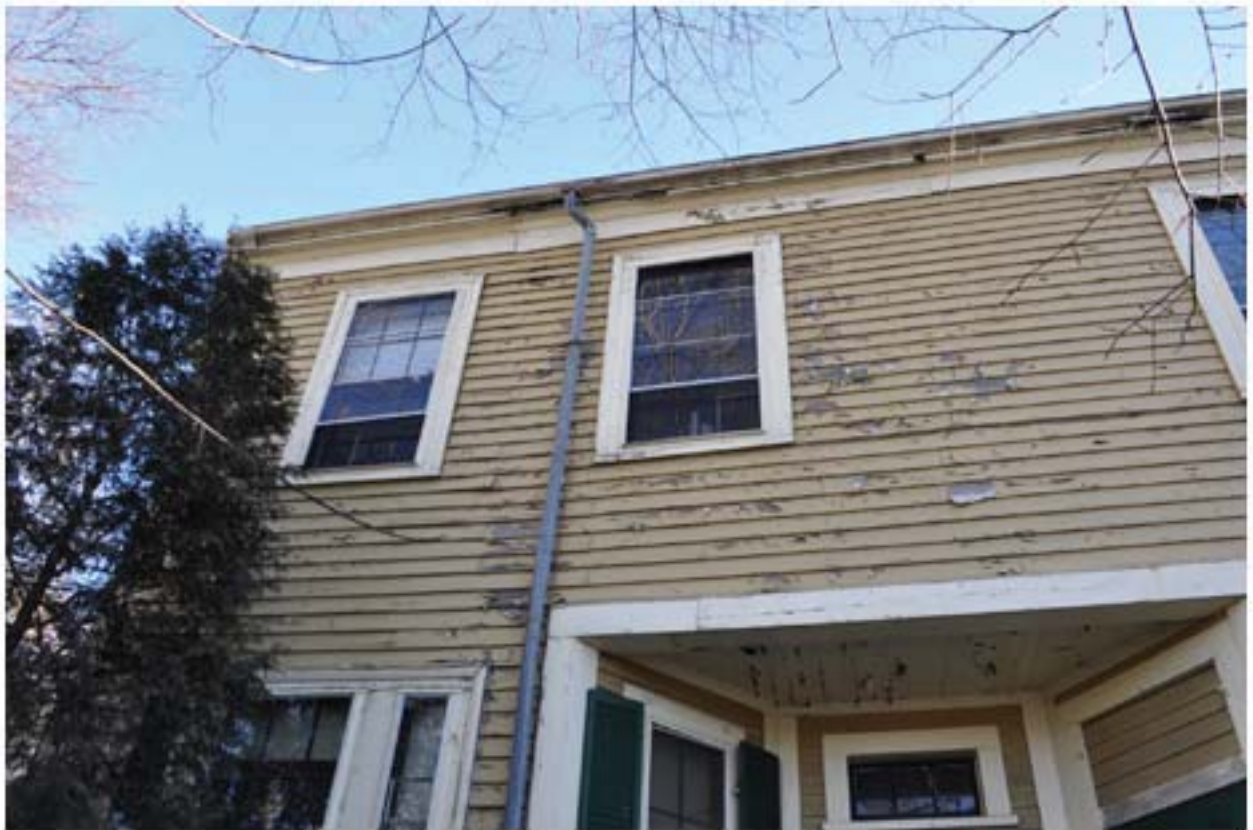
13D- Existing siding on west side of house