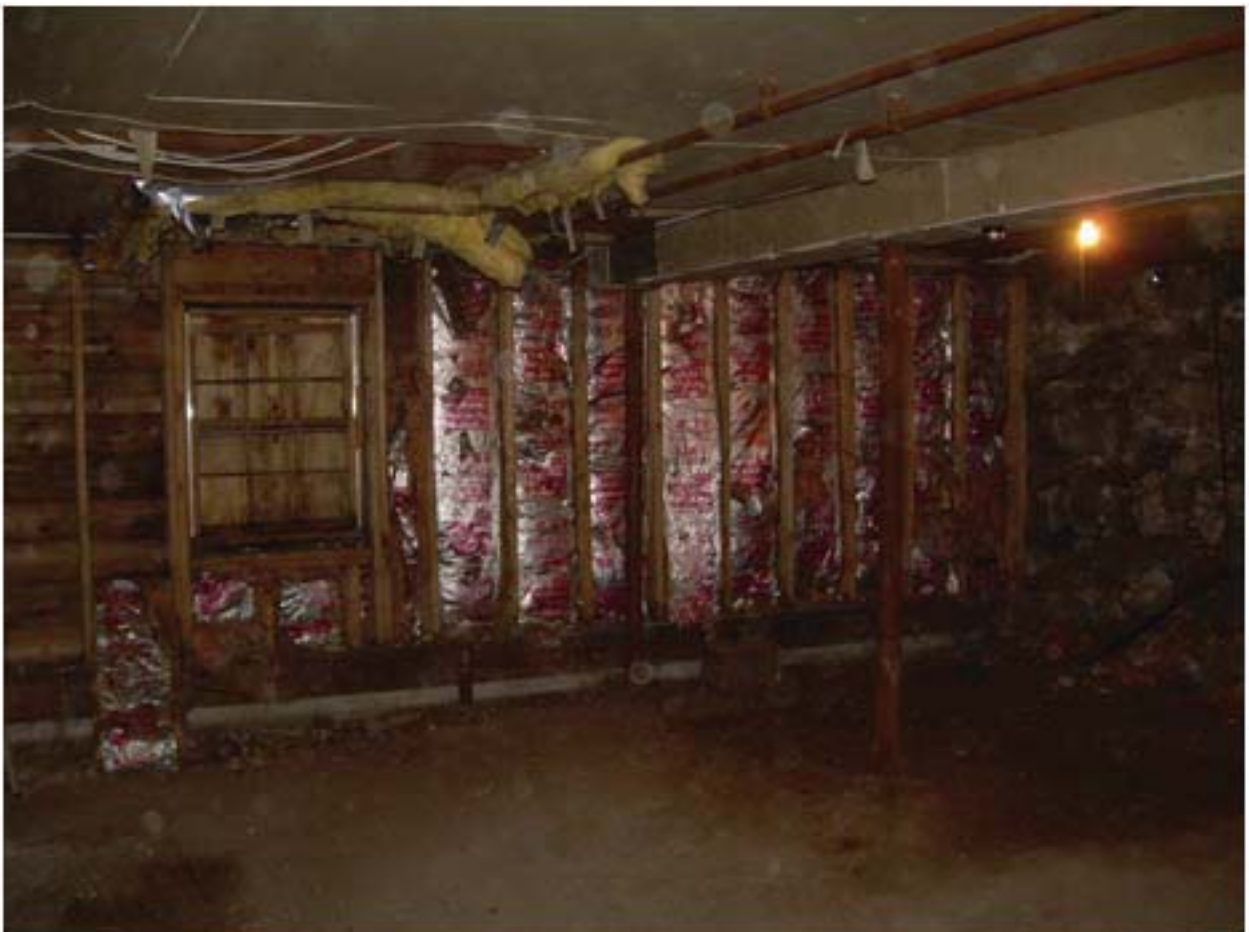
21B (Interior)- Existing east side of barn