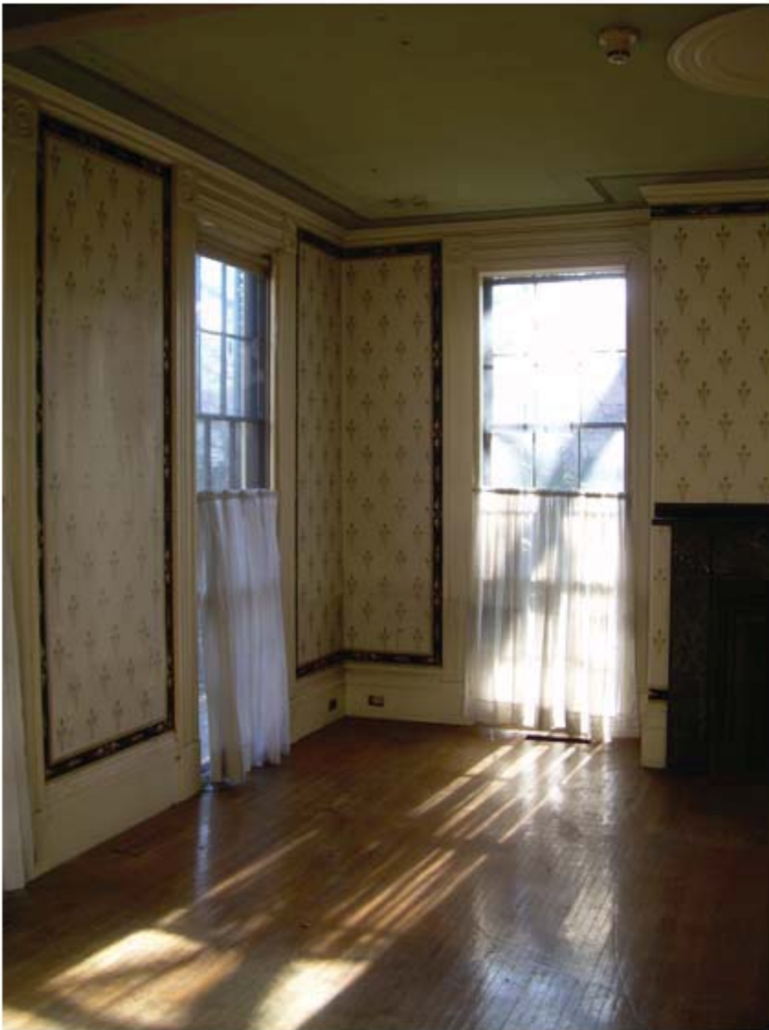
14E (Interior)- Existing ground floor triple hung window on the south side of house