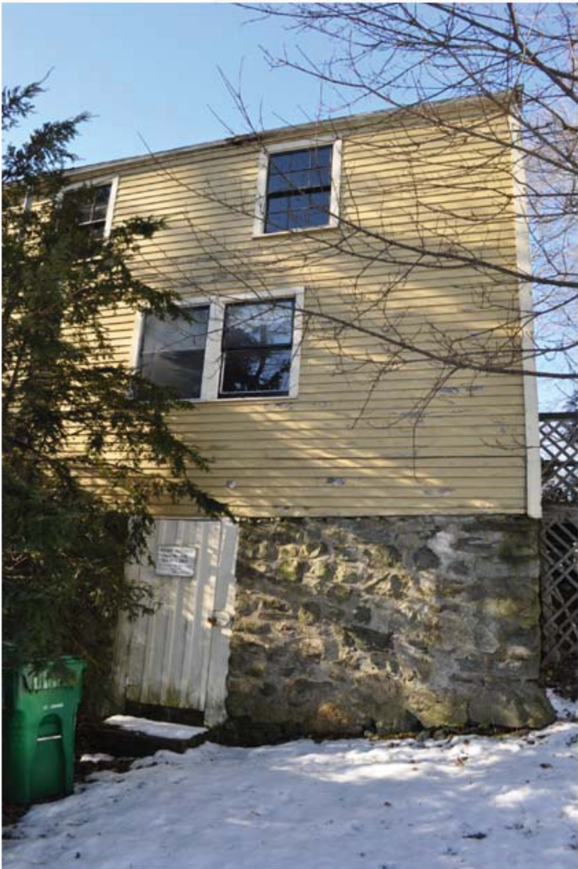
15D- Existing solid wood panel door in fieldstone of lower level east barn facade