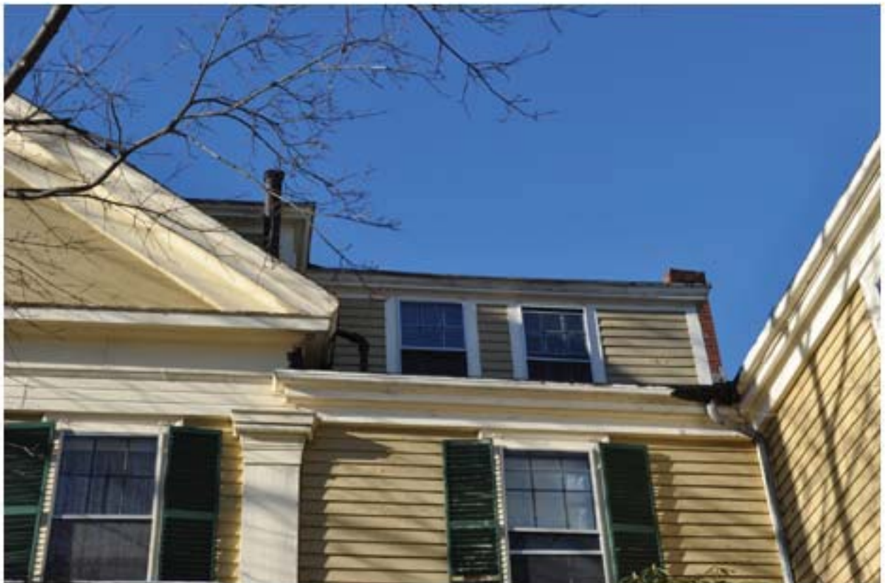
10B- Existing east house cornice, gutters and downspouts