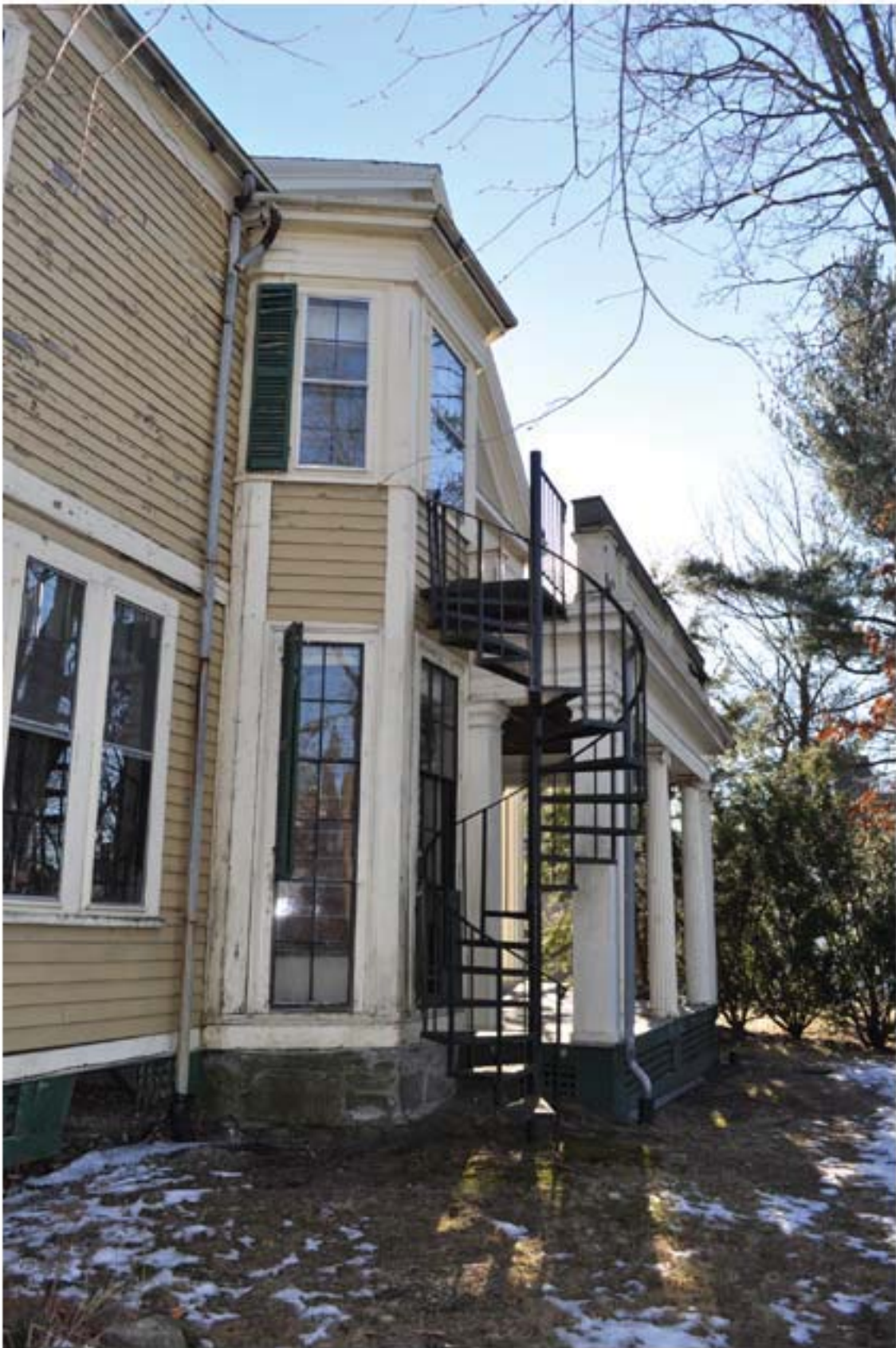
5A- Existing iron spiral stairway for one story porch on west side of house