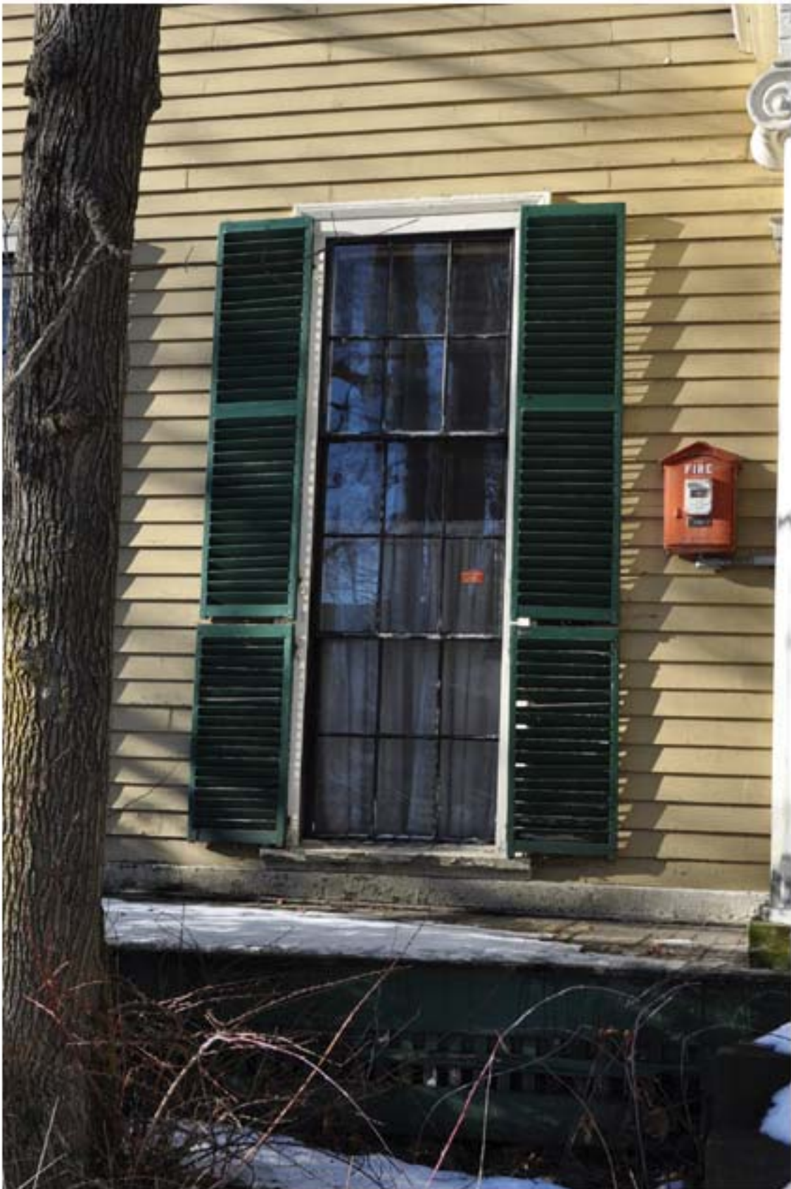
14E- Existing ground floor triple hung window on the south side of house