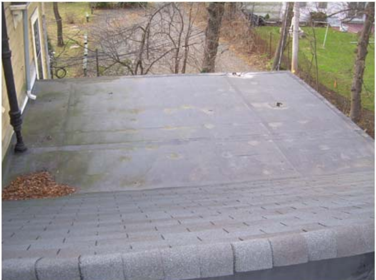
8B- Existing lower flat roof covered with black EPDM membrane roofing