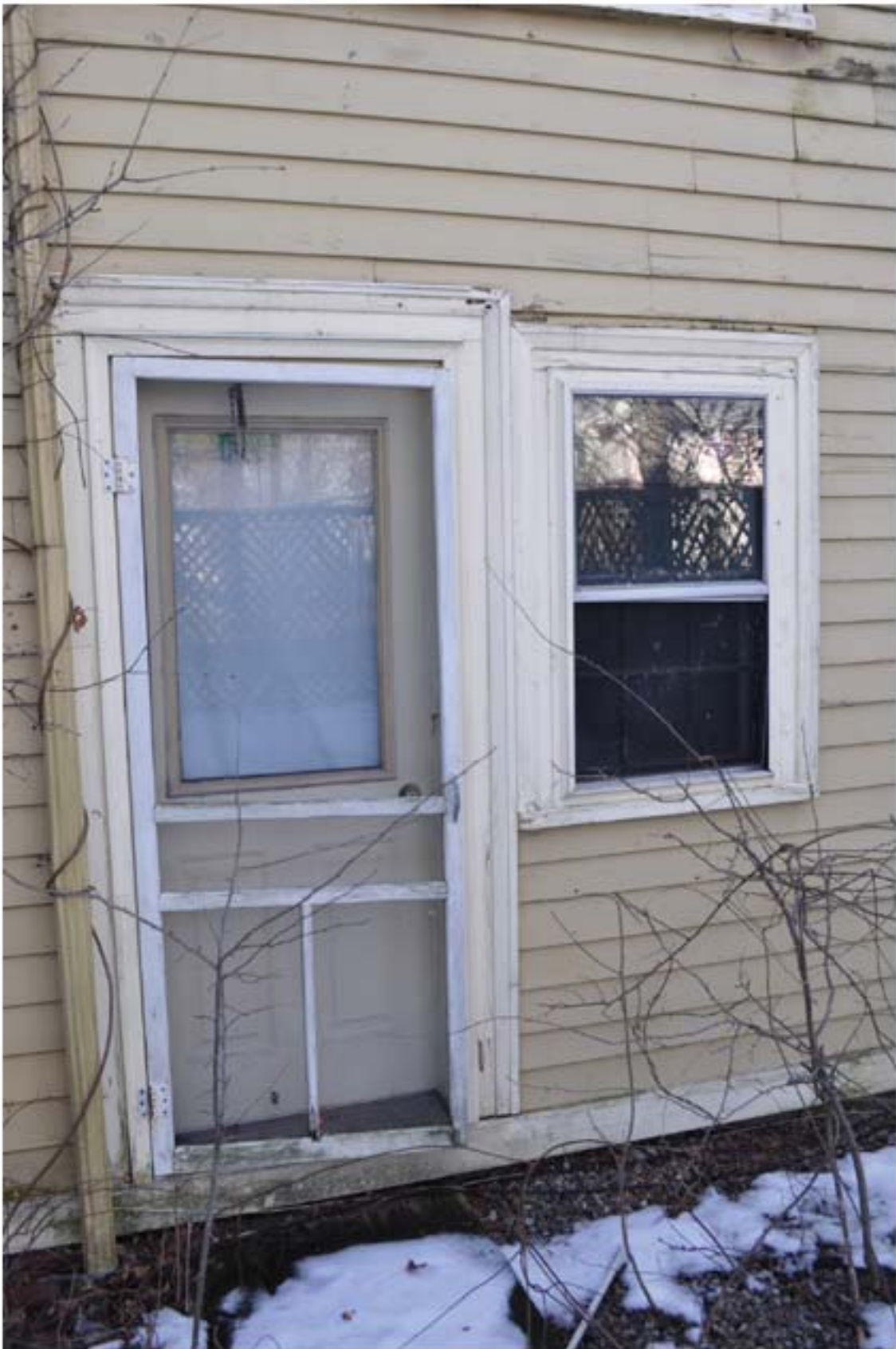
15C- Existing north house entrance door