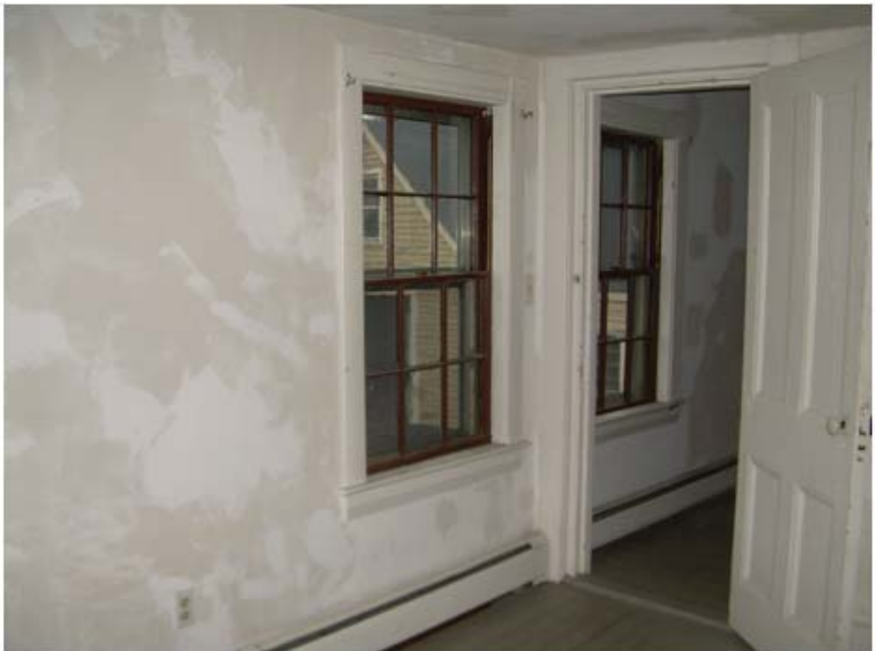
14C (Interior)- Existing double hung windows on second floor of north side of house