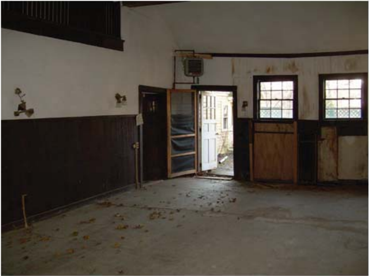
15E (Interior)- Existing west barn entrance door