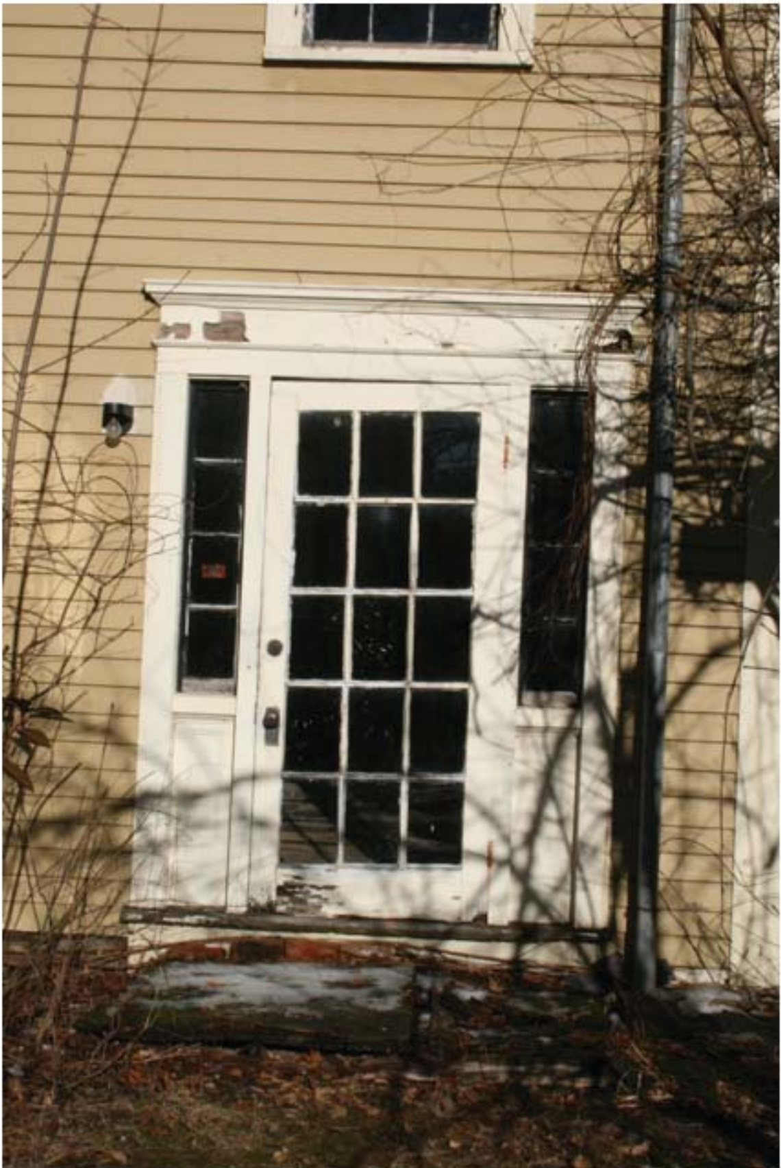
15B- Existing south barn egress door and sidelights