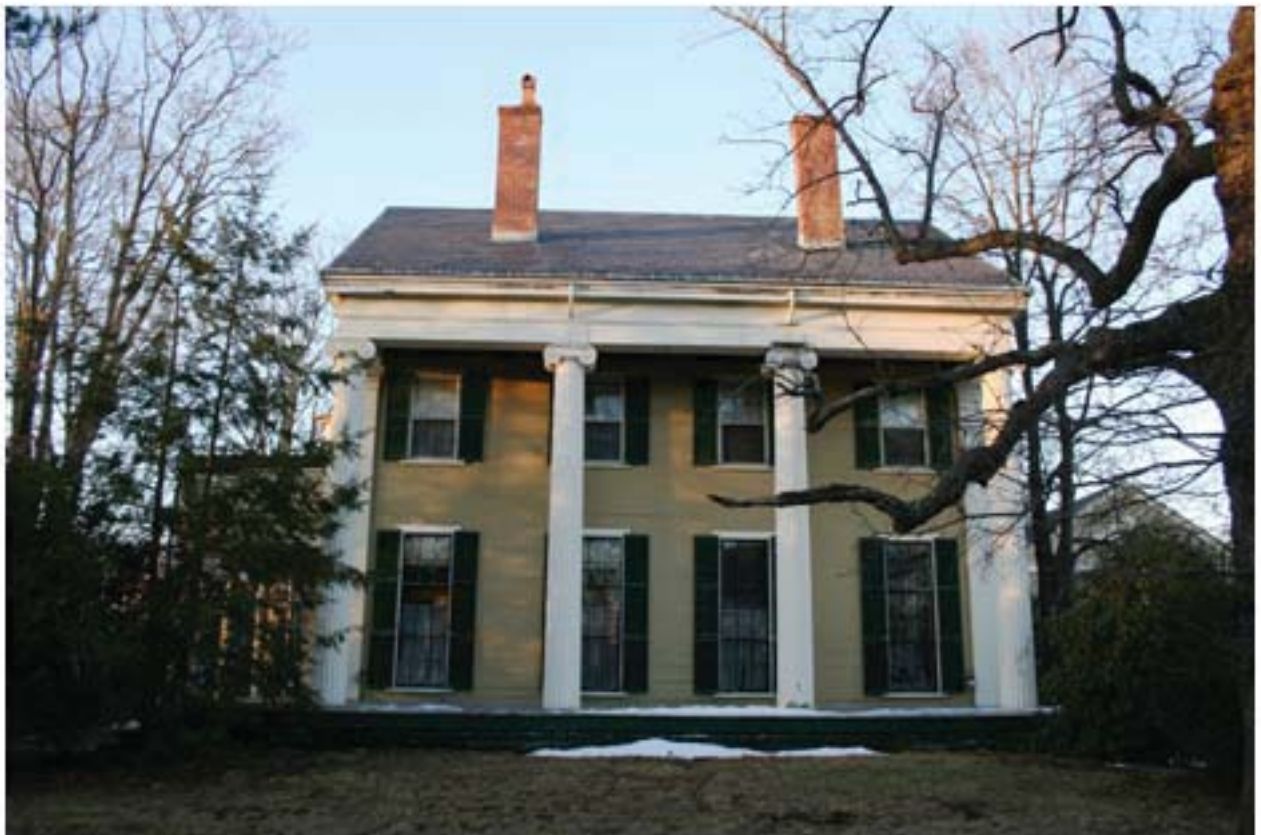
6D- Existing house chimneys on south facade