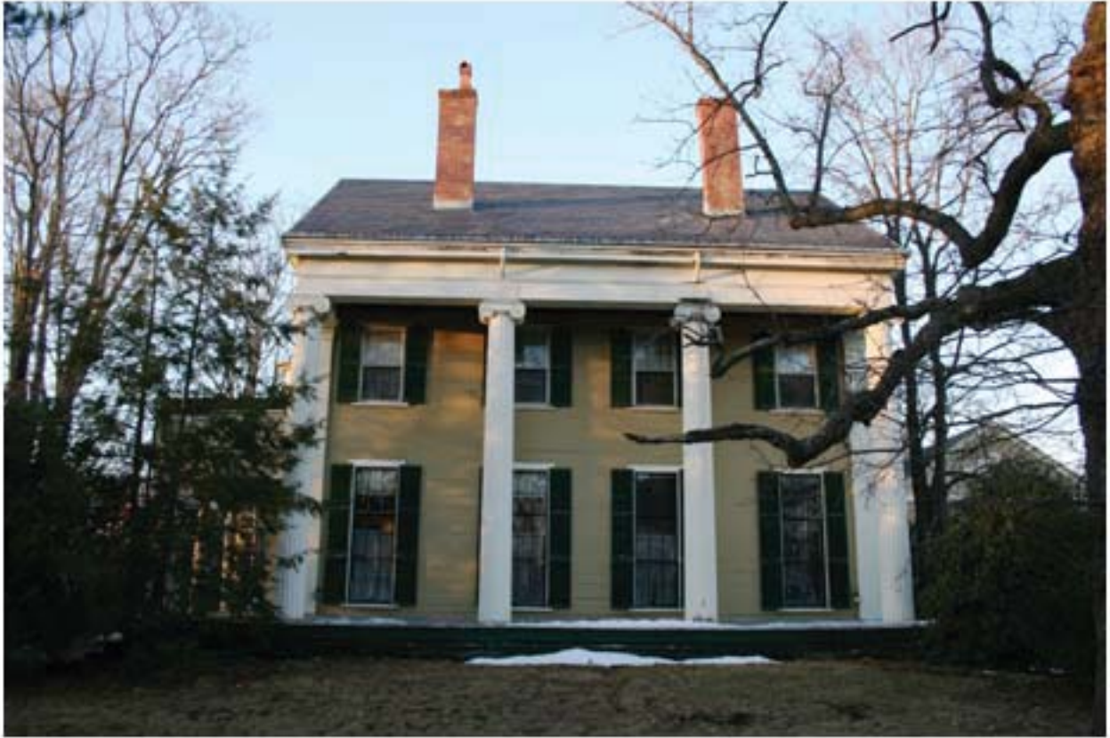
12A- Existing monumental ionic columns on south side of building