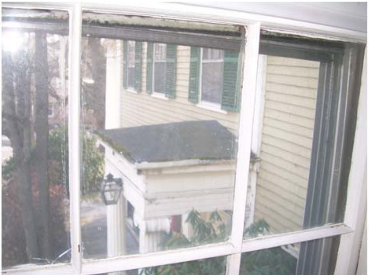
9B- Existing east porch low sloped hot mopped asphalt roof