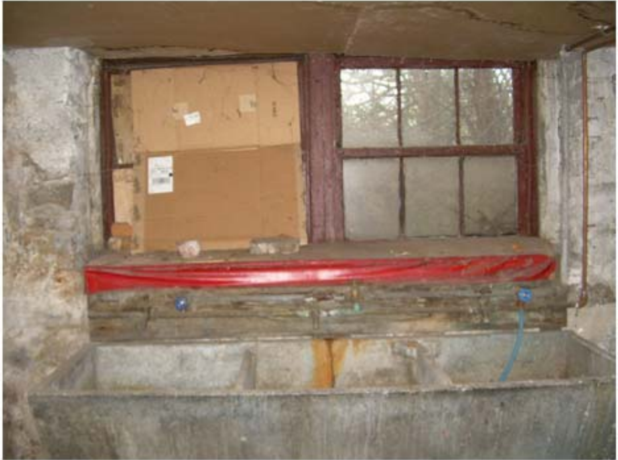
19B (Interior)- Existing basement window at west side of house