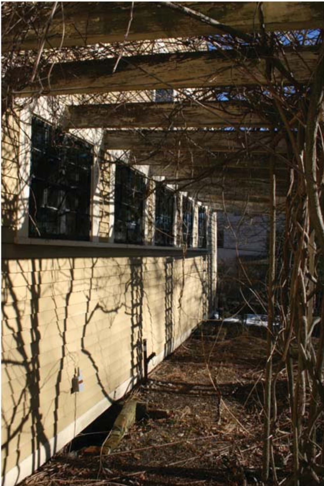
19C- Existing window well at south side of barn