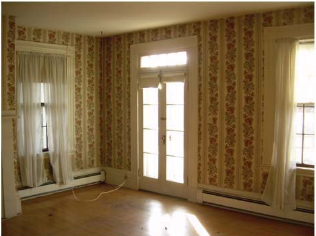
4A (Interior)- Existing French casement window on second floor