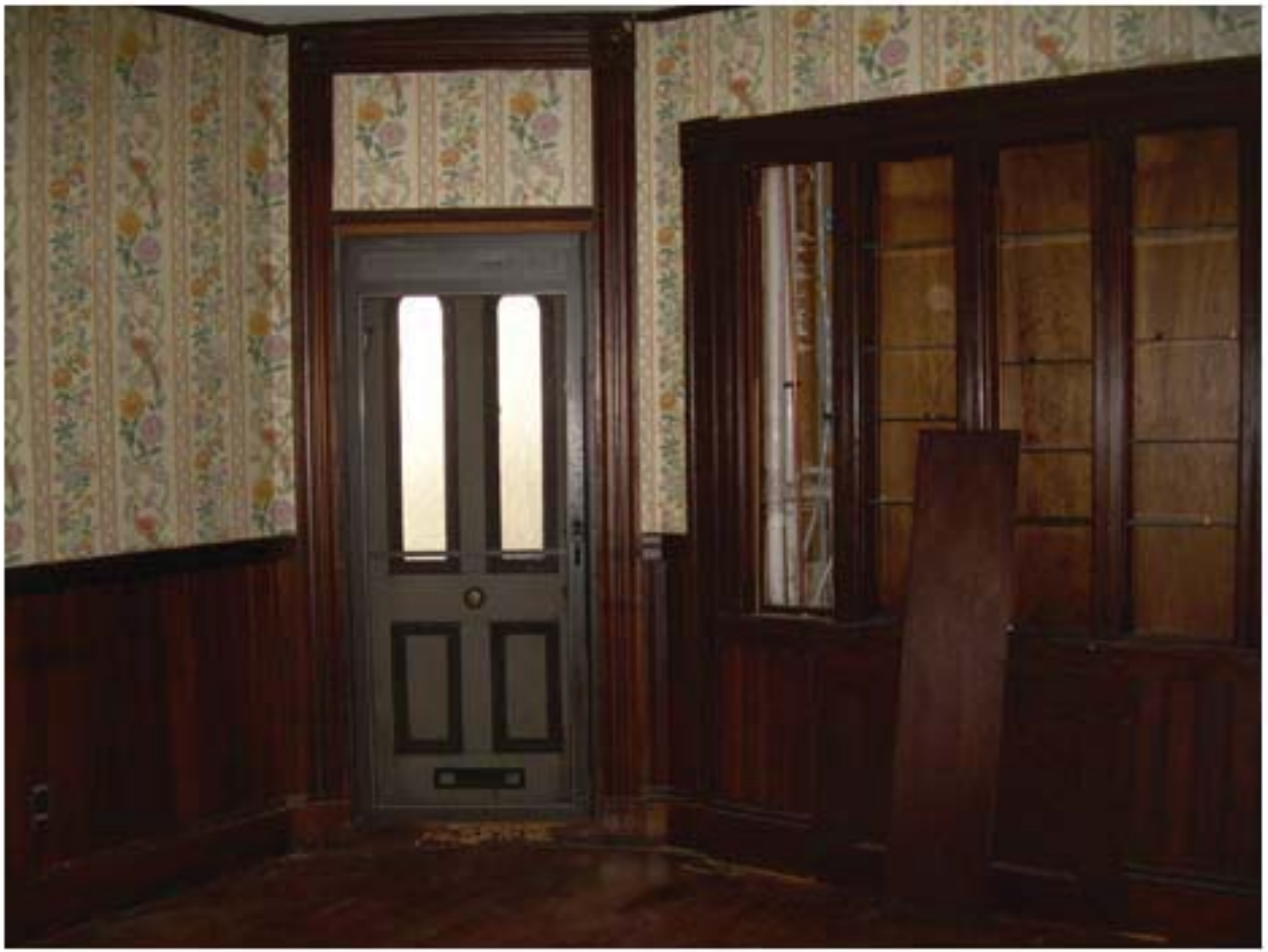
18A (Interior)- Existing entrance to porch on west side of house