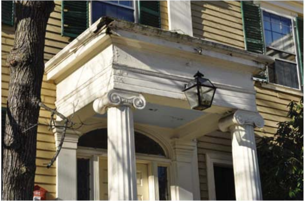
9A- Existing east porch low sloped hot mopped asphalt roof