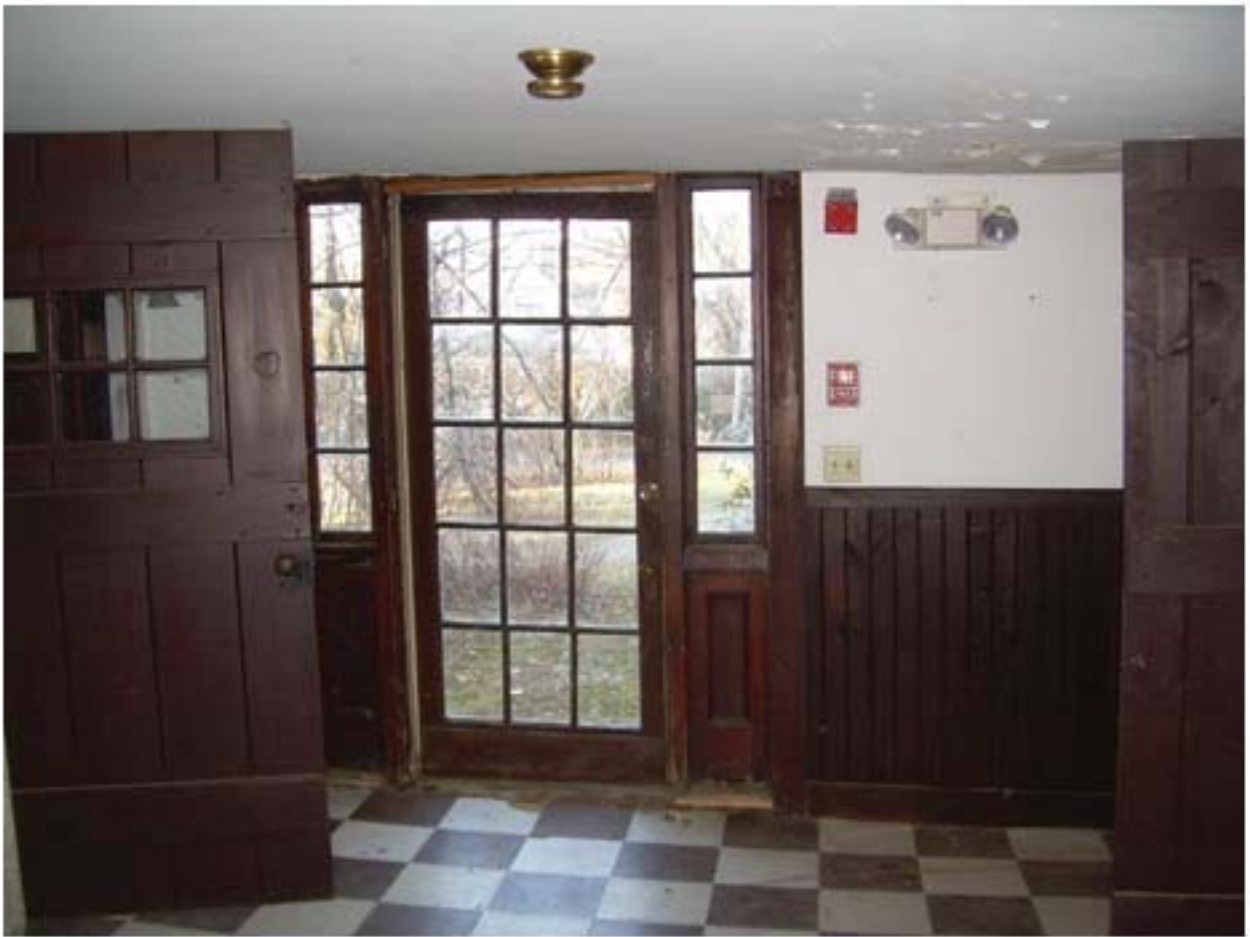
15B (Interior)- Existing south barn egress door and sidelights