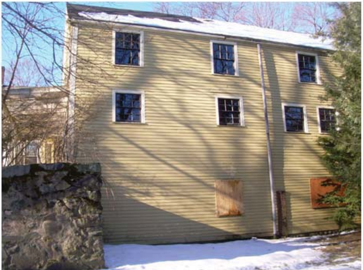
14B- Existing double hung wood windows on east side of barn