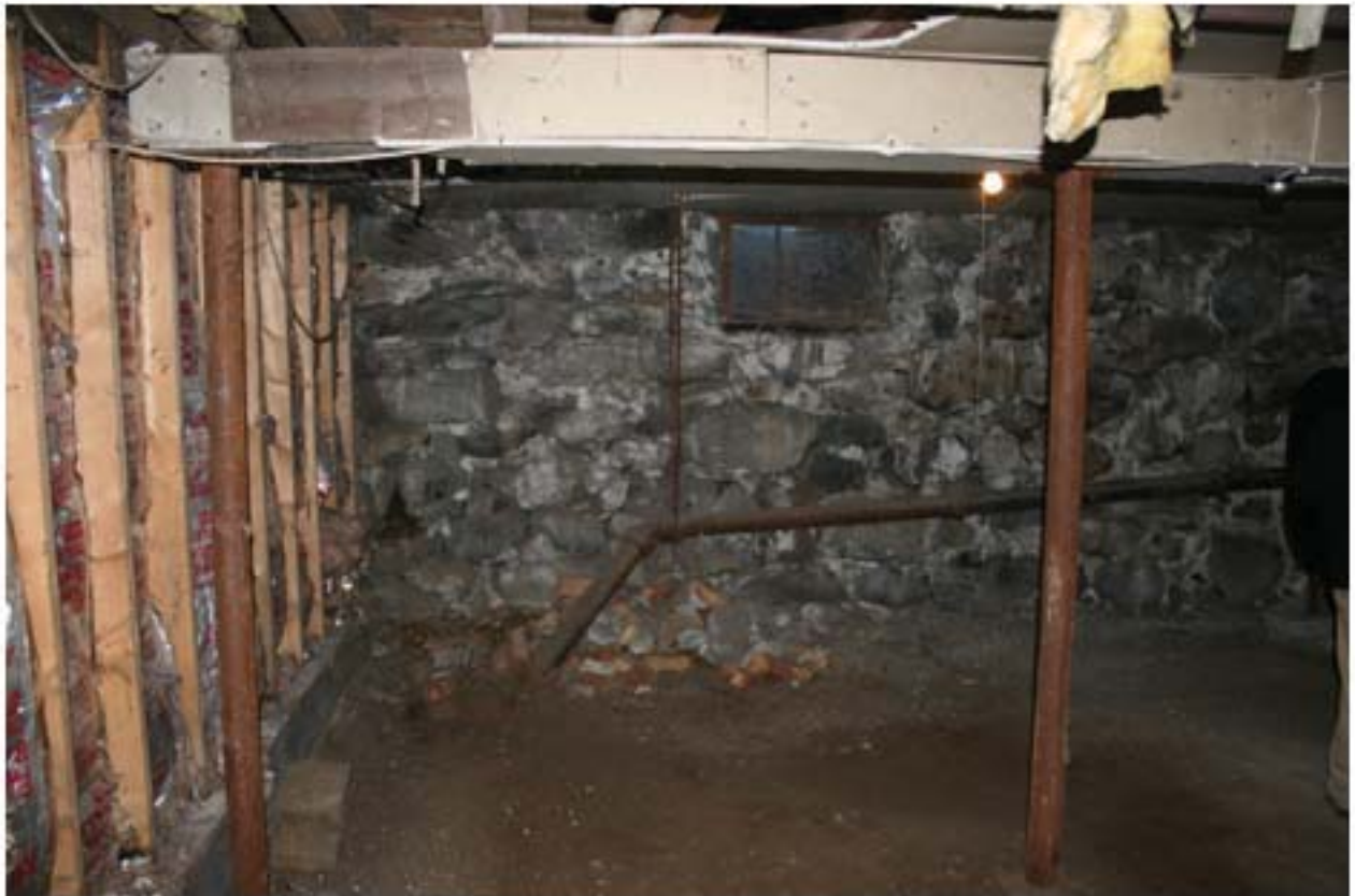
19C (Interior)- Existing basement window at south side of barn