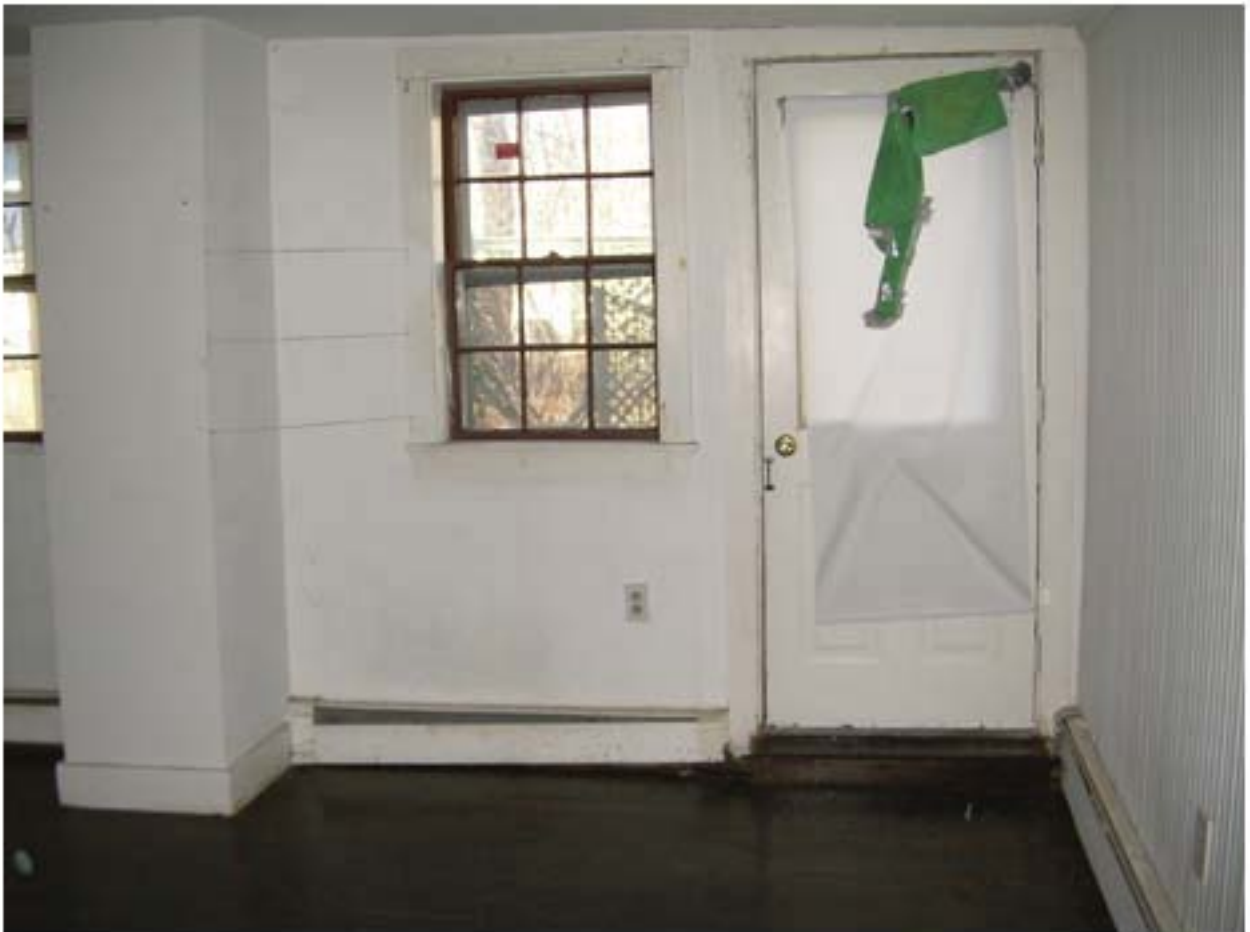
15C (Interior)- Existing north house entrance door