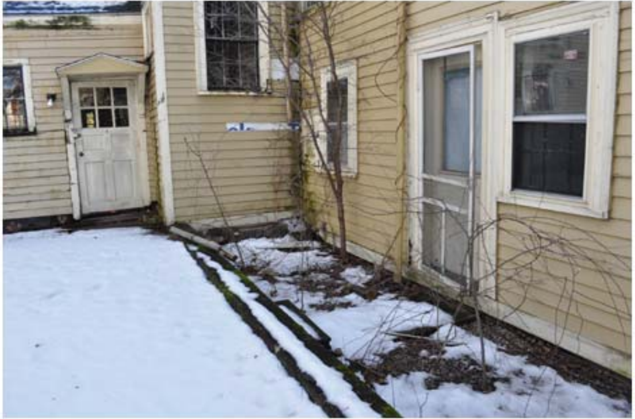
19A- Existing depressed patio grade water damage at the north house and west barn intersection