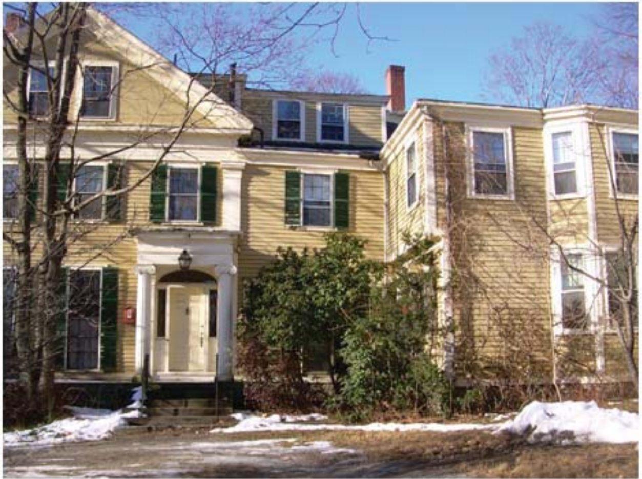
10A- Existing east entrance porch and house cornice