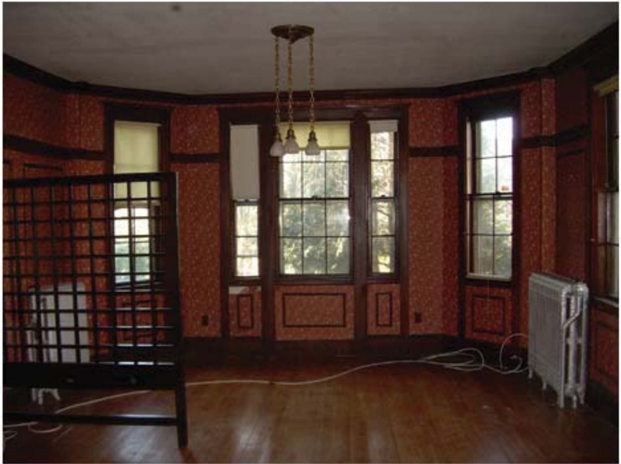
20E- Existing window trim, mop boards, wall paneling and wood parquet floors