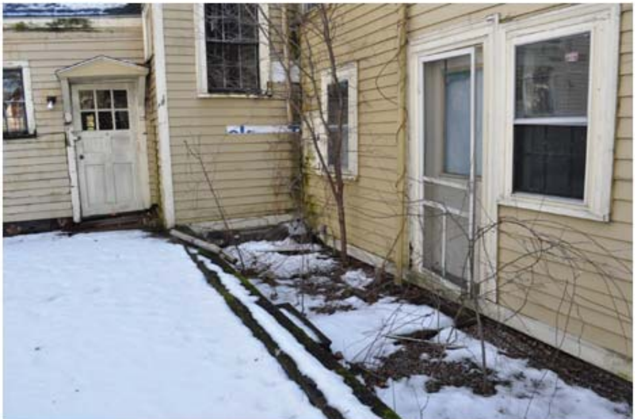
12B- Existing window trim, door trim and frieze boards