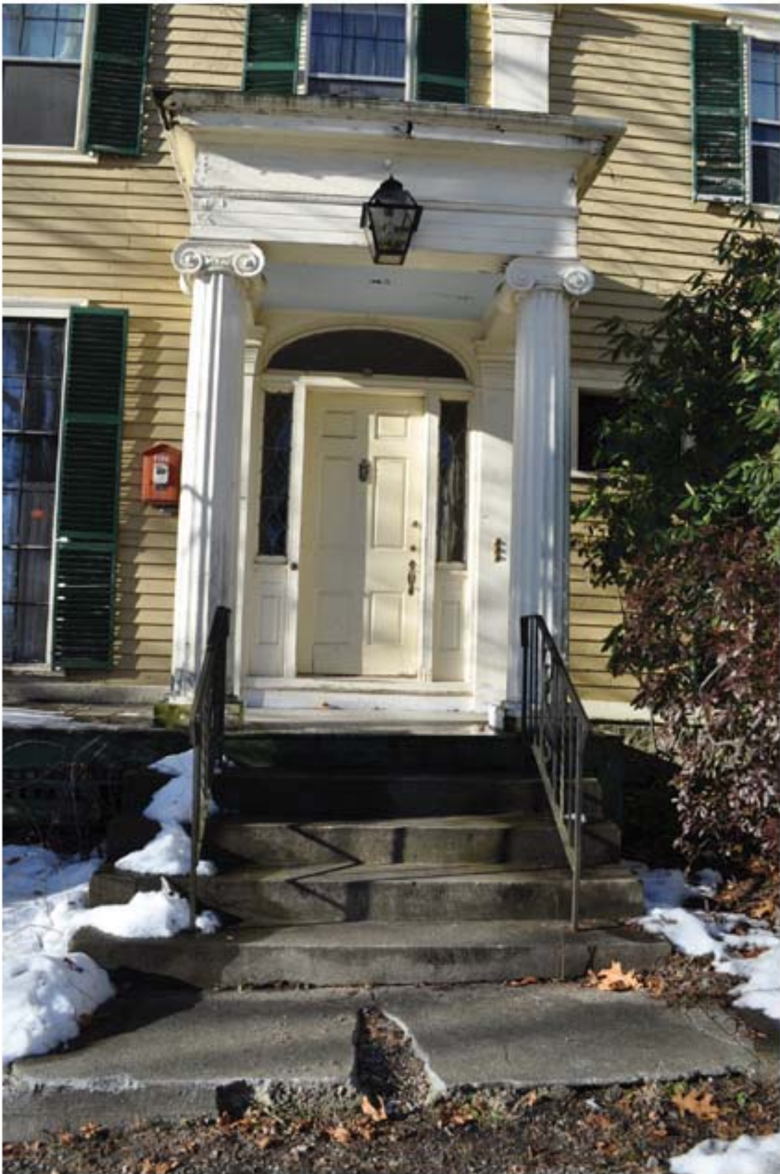
9C- Existing east porch and low sloped hot mopped asphalt roof