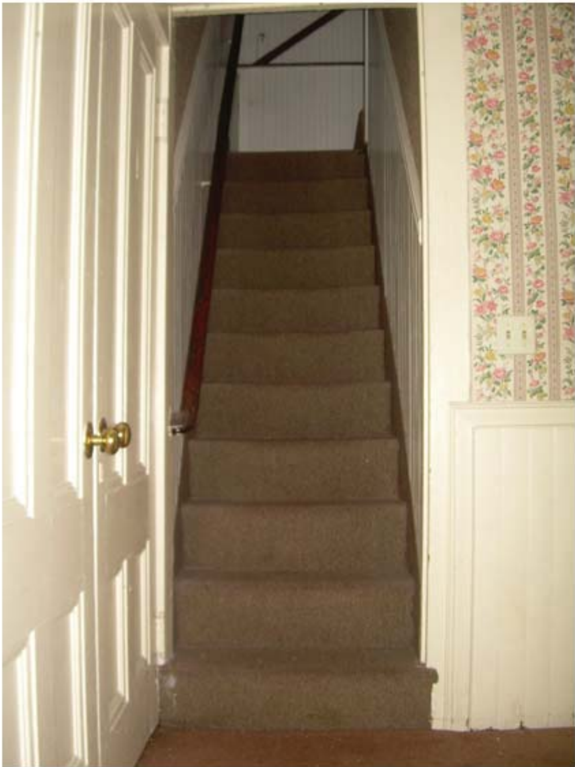
20A- Existing original stairway