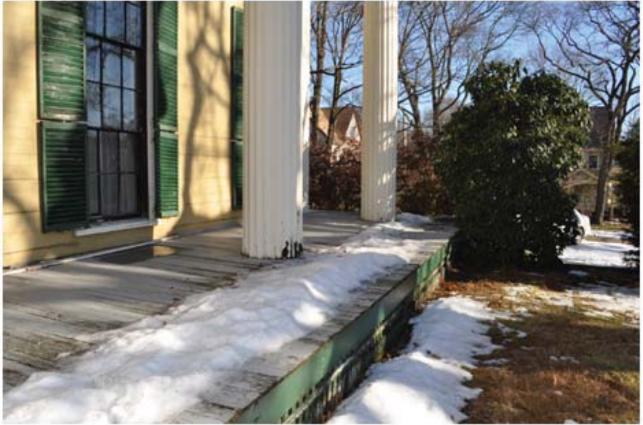
16E- Existing wood porch flooring around four monumental columns on south side of house