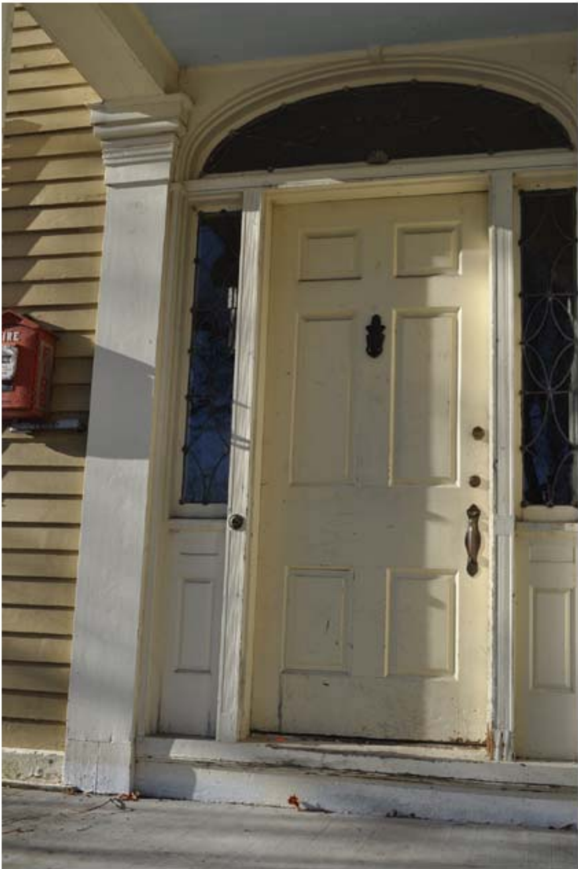
15A- Existing east house egress door and sidelights