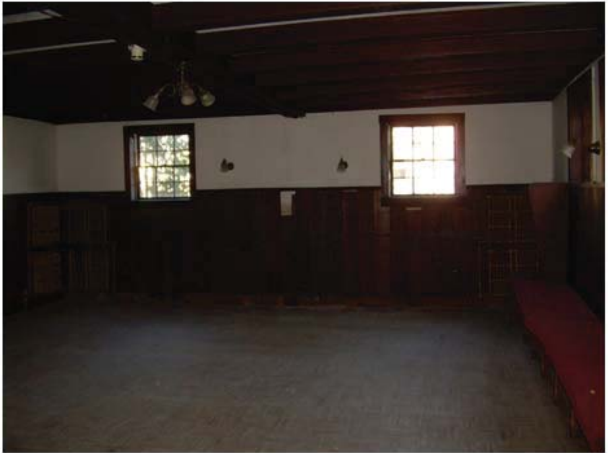
14B (Interior)- Existing double hung wood windows on first floor of east side of barn