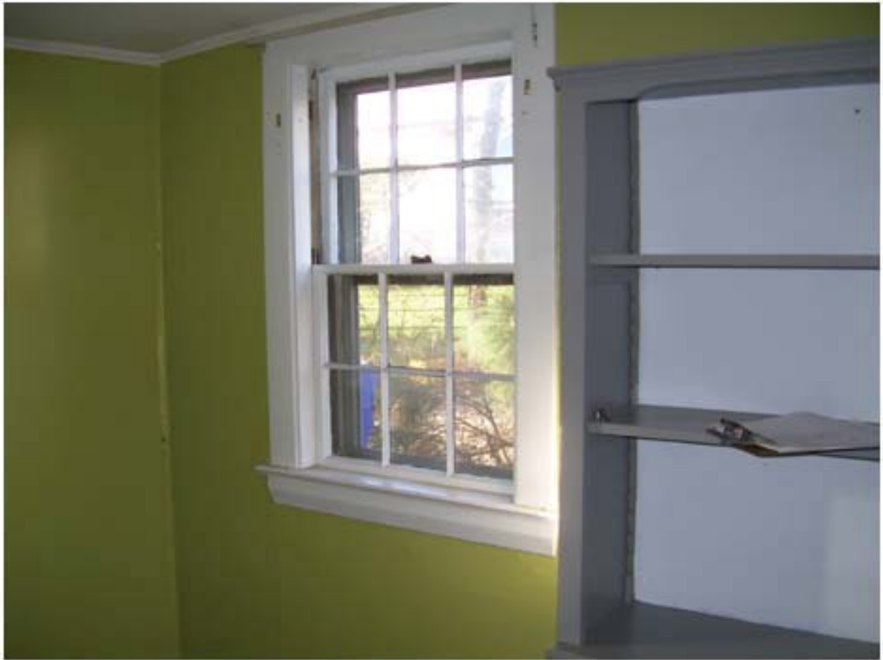
14C (Interior)- Existing double hung wood windows on first floor of north side of house