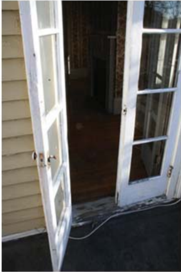
4A- Existing French casement window on second floor of west side of house