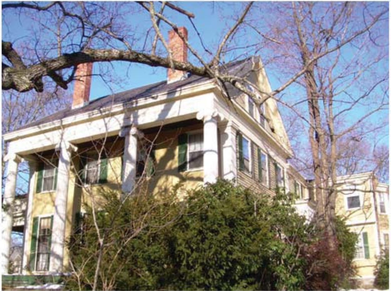
7C- Existing house sloped gable roof with common three tab black asphalt shingles