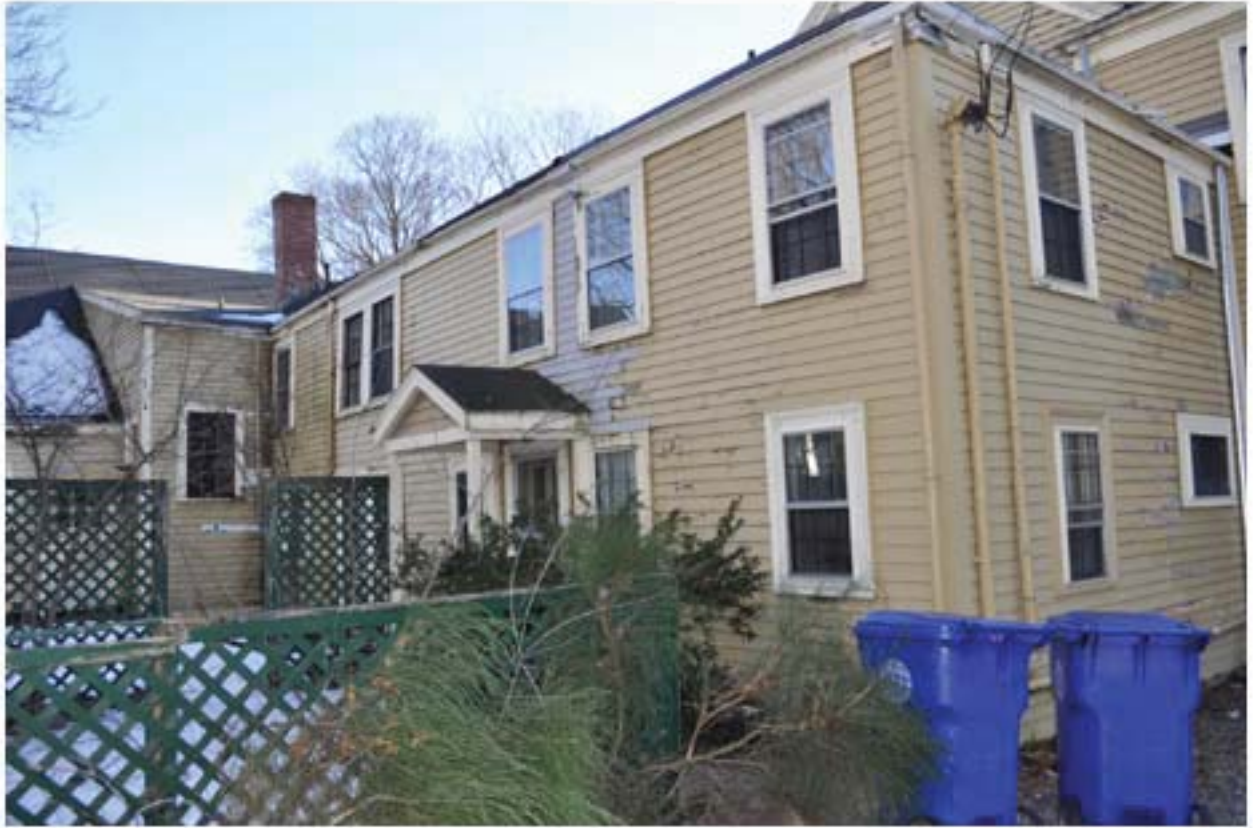
13C- Existing siding on south and west side of house