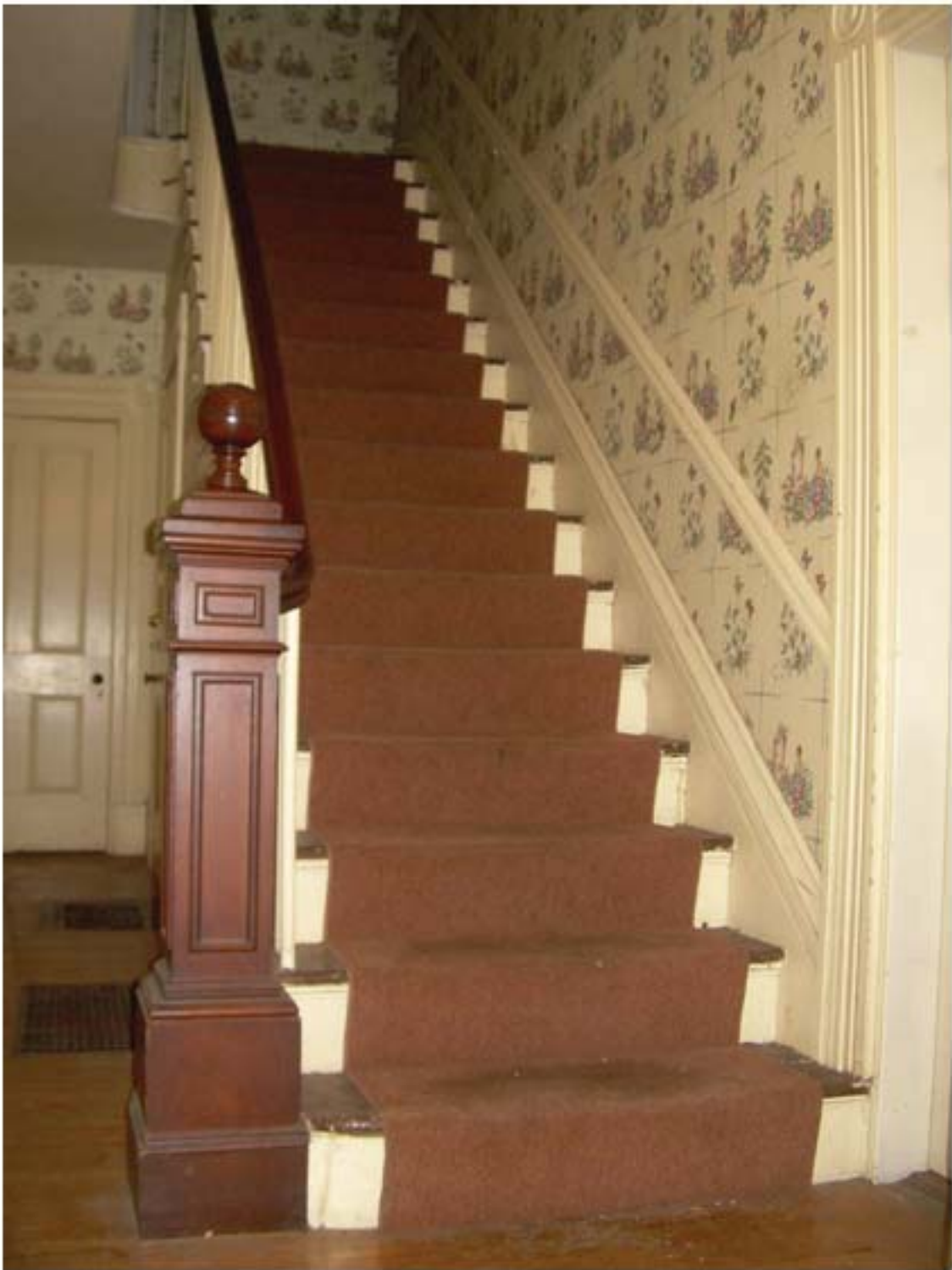
20A- Existing original stairway