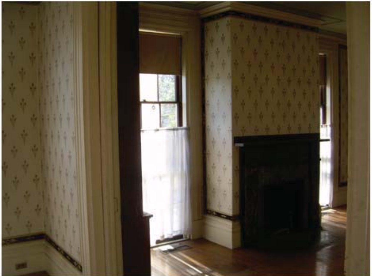
6C&D (Interior)- Existing house chimney