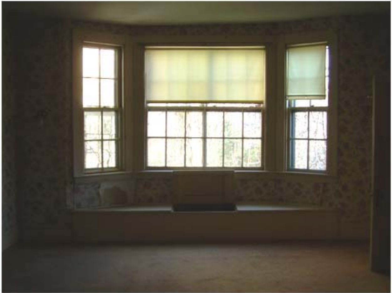
14A (Interior)- Existing double hung wood windows on first floor of east side of house