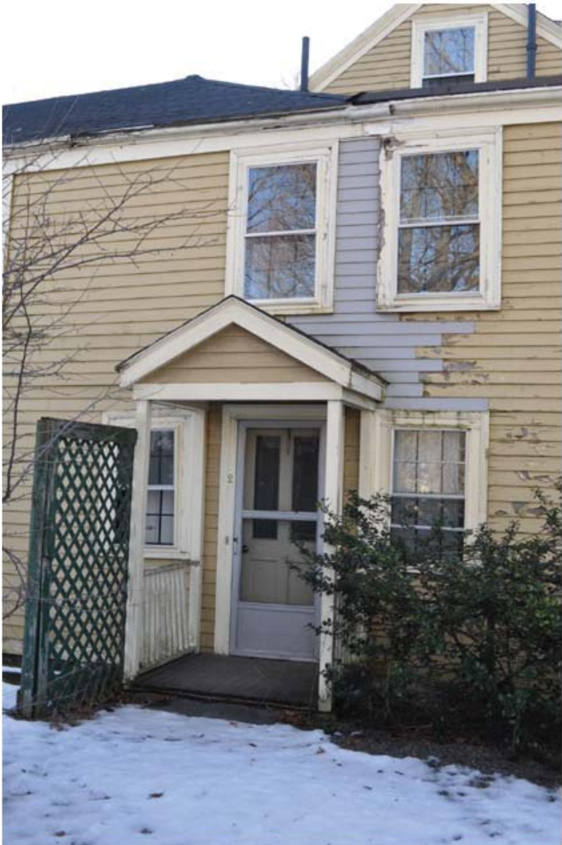
16C- Existing roofed stoop at north side of house