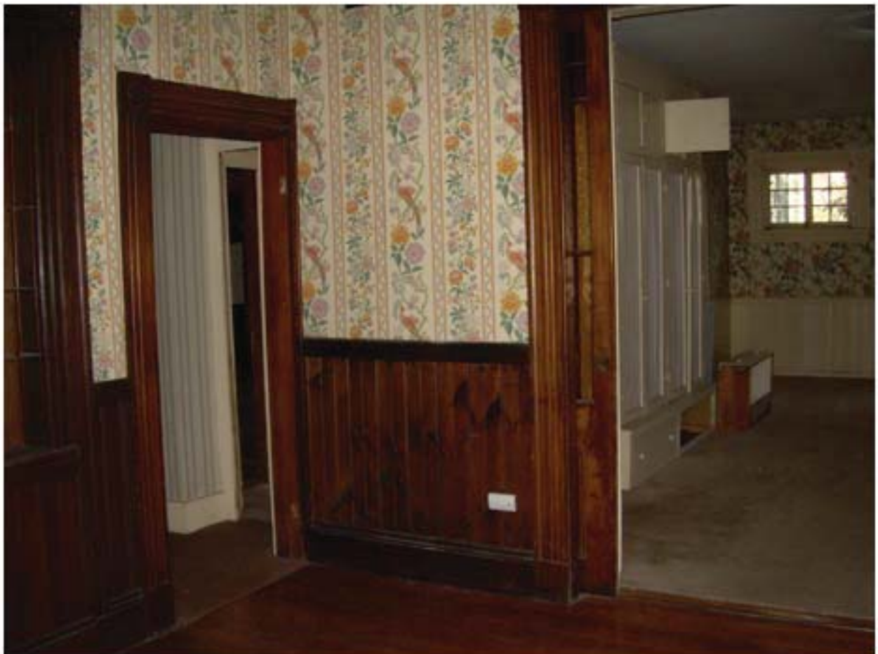
20F- Existing original door, casing, mop boards, wall paneling and wood parquet floors