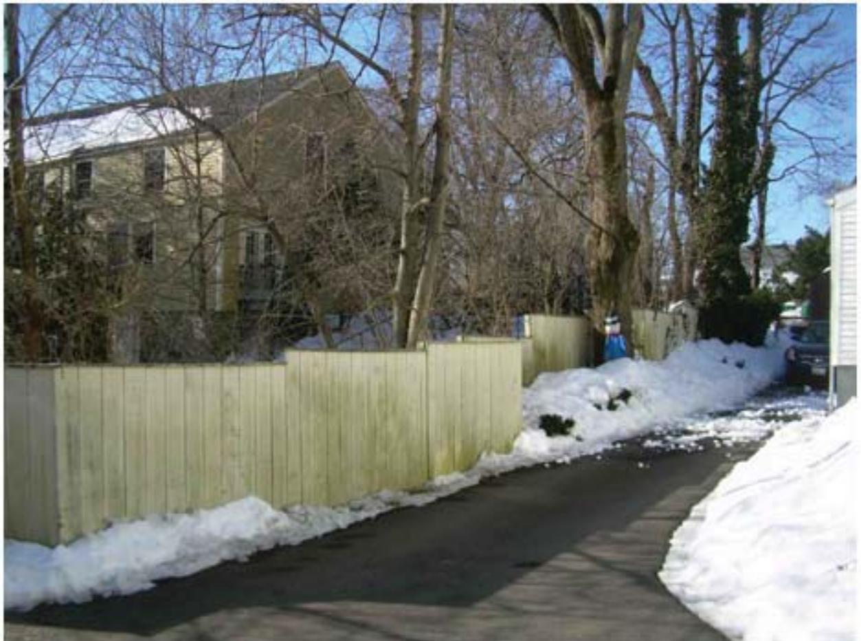
1B- Existing stained wood board fence at rear of north side of barn