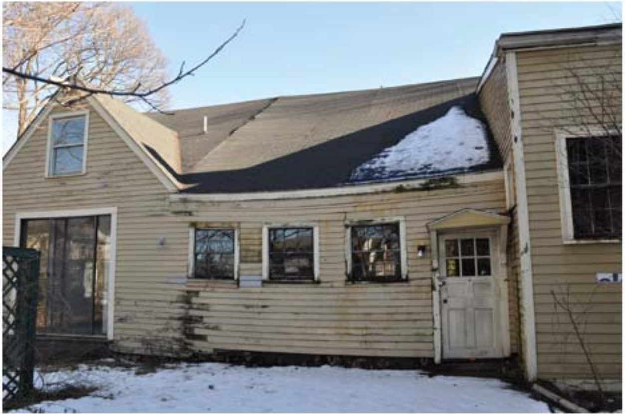
11C- Existing west side of barn with missing and rotted components