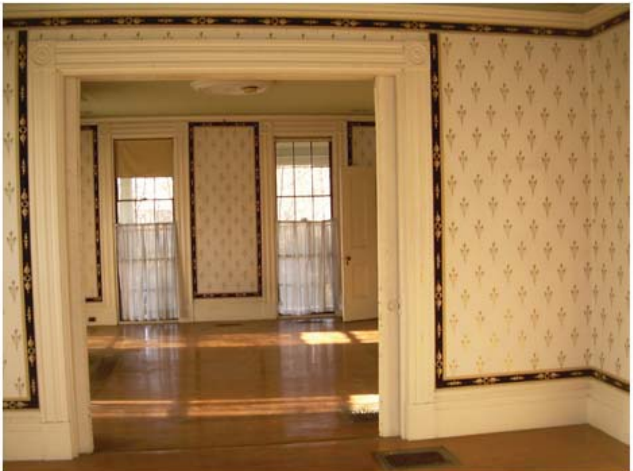
20D- Existing original door and casing, window trim, mop board and wood parquet floors