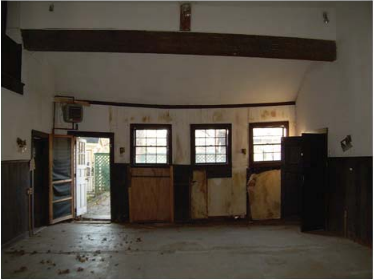
21A (Interior)- Existing west side of barn