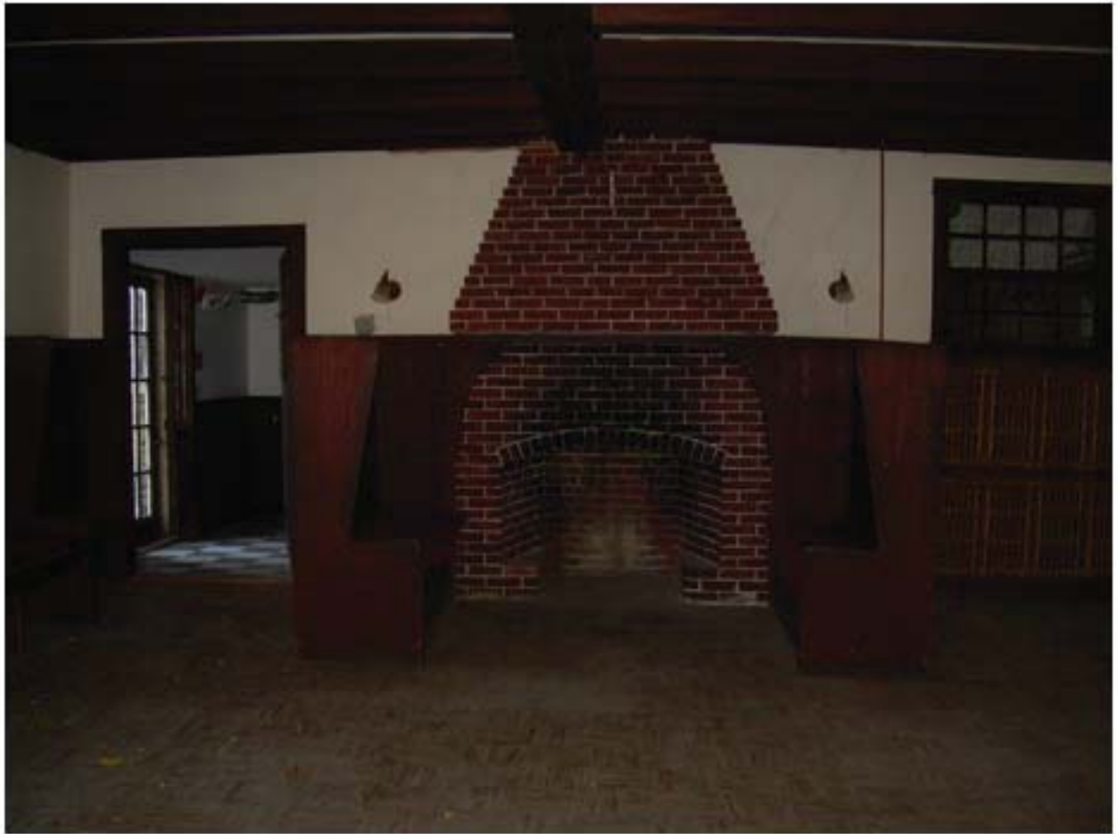
6A (Interior)- Existing barn chimney