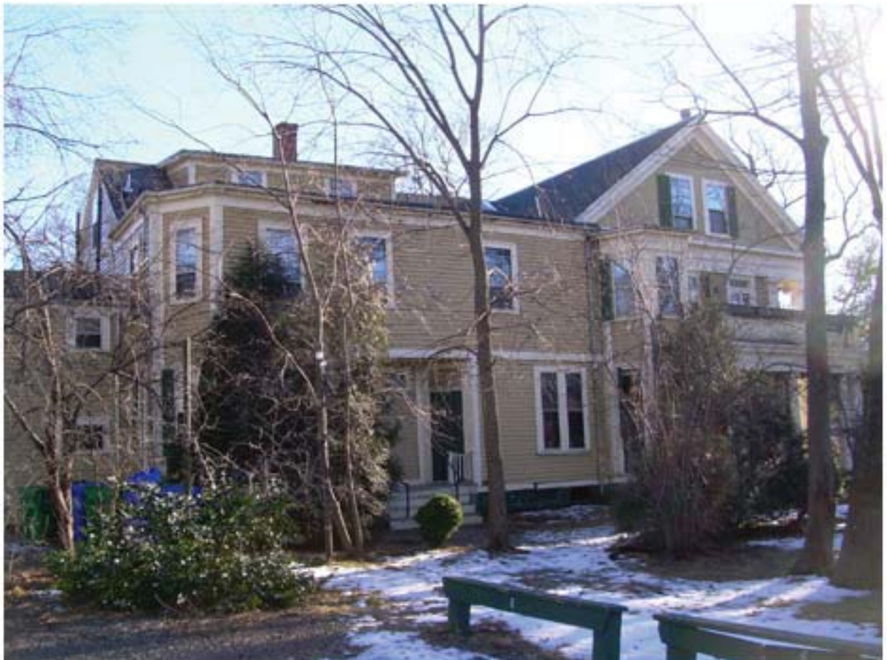
7D- Existing house sloped gable roofs with common three tab black asphalt shingles