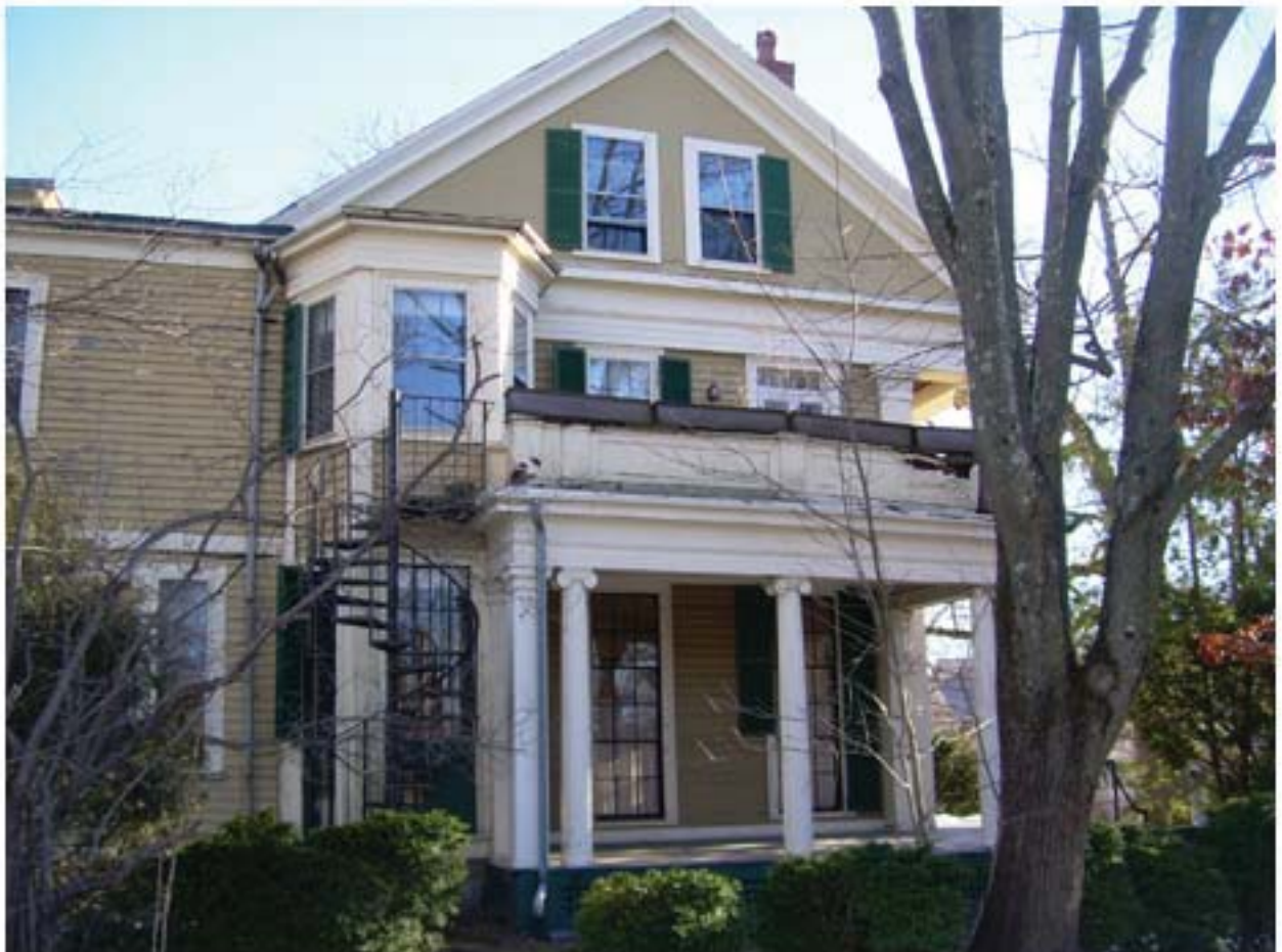
3B- Existing deteriorated one story porch on west side of house