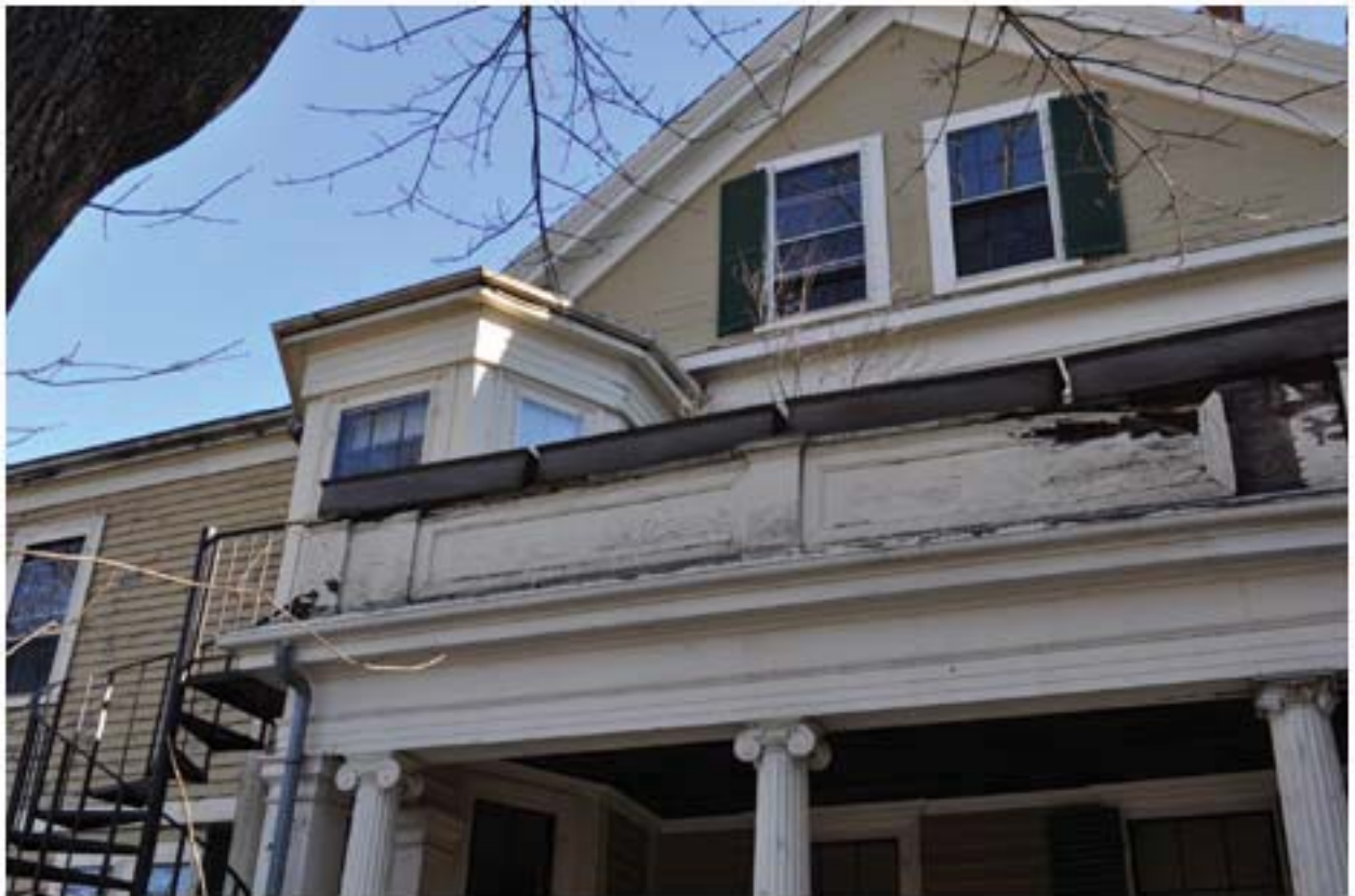
3A- Existing deteriorated one story porch on west side of house