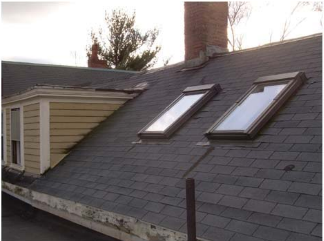
6B- Existing house chimney