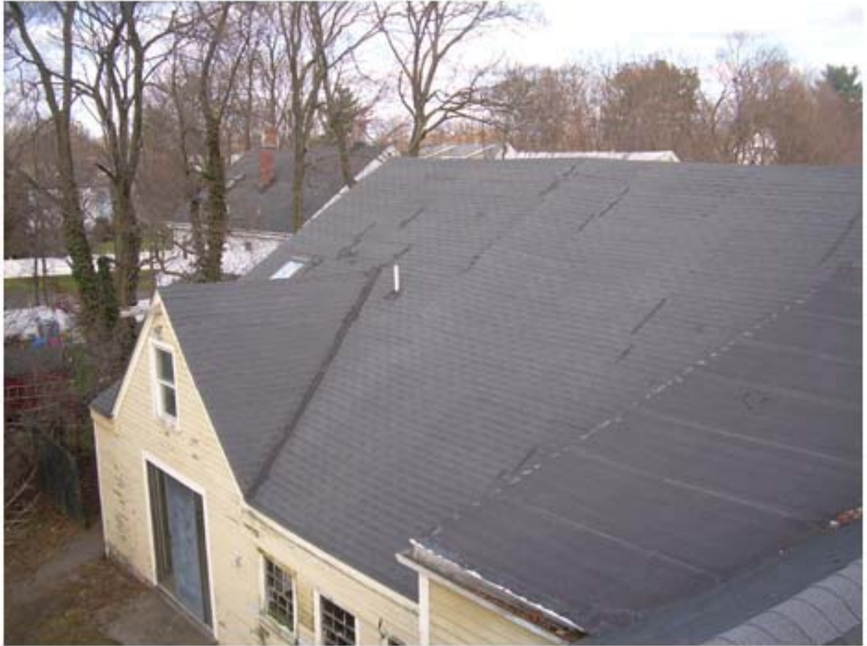
7A- Existing barn sloped gable roof with common three tab black asphalt shingles