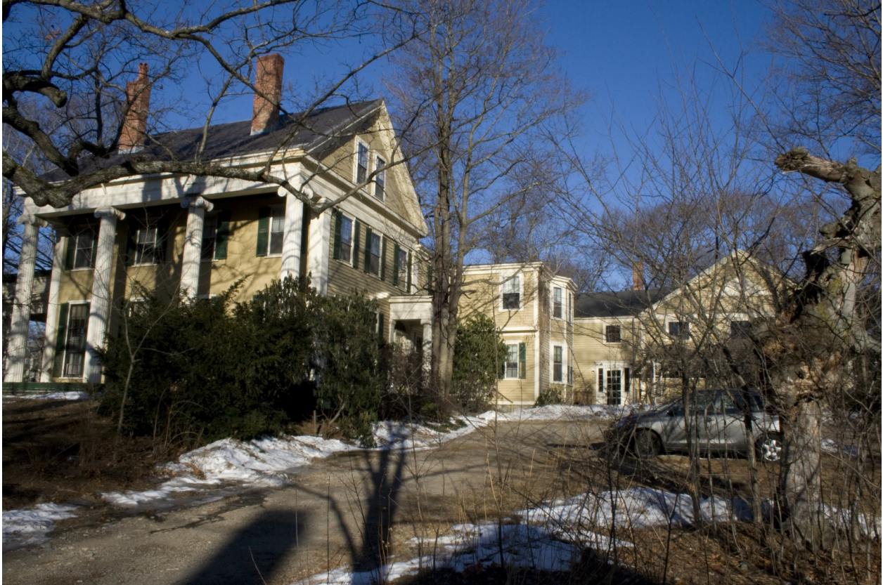
Nathaniel Allen House from Webster Street driveway