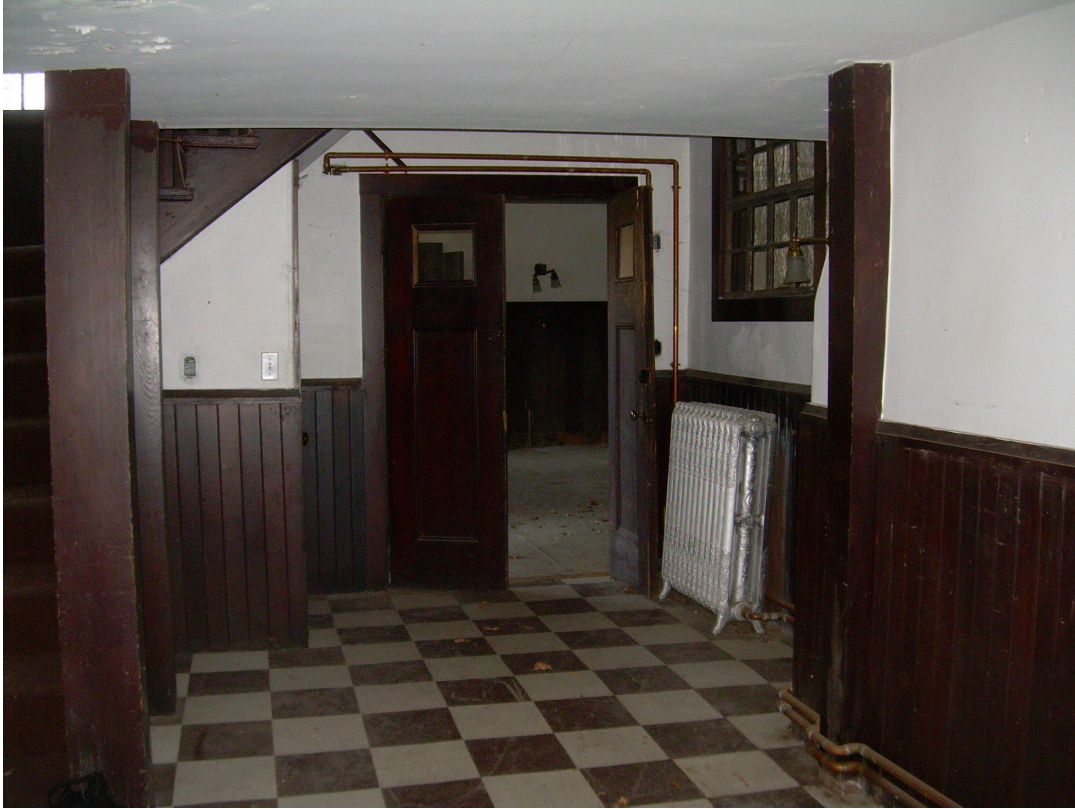
CPC Phase II work: Main Entrance/Lobby (116)