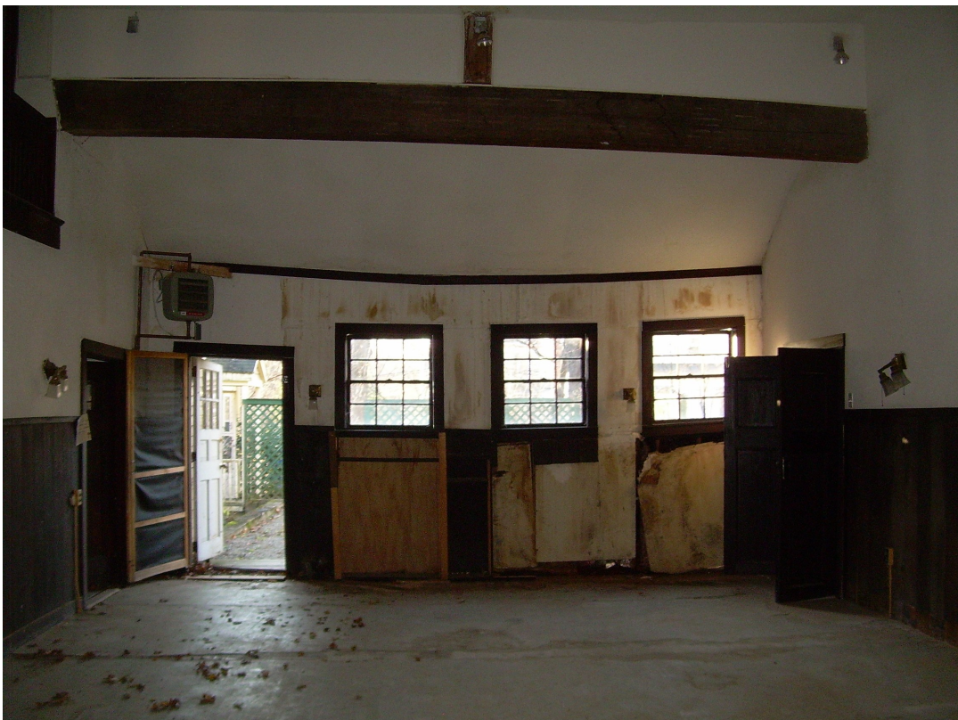
CPC Phase II work: Hall/Program 13