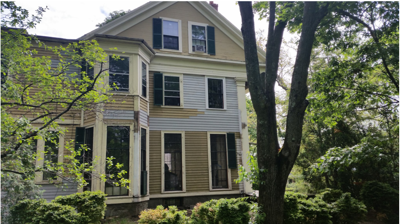
CPC Phase I work: Cherry St. façade work completed—porch demo, new window & siding