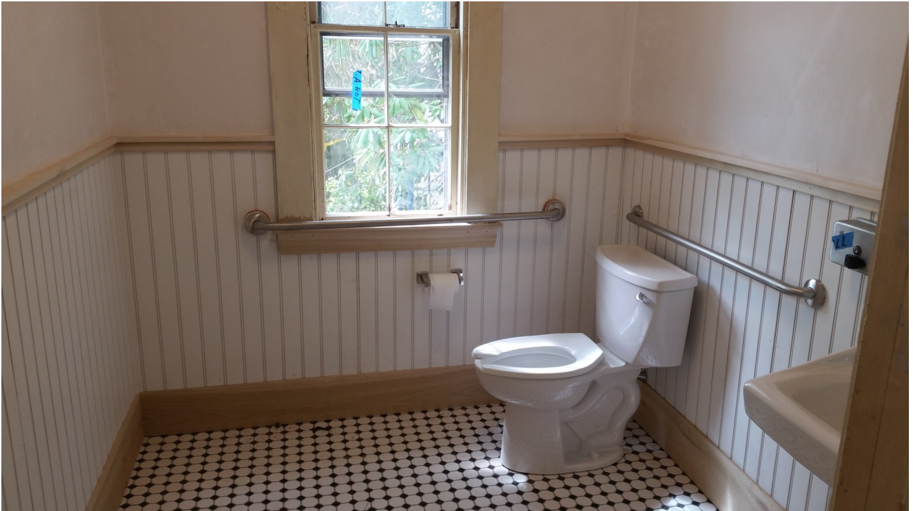
CPC Phase I work: Unisex HC Toilet Room (141)