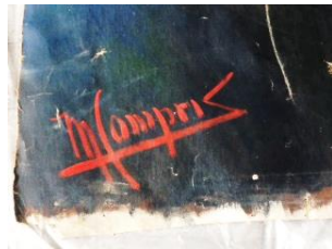
closeups from central panel