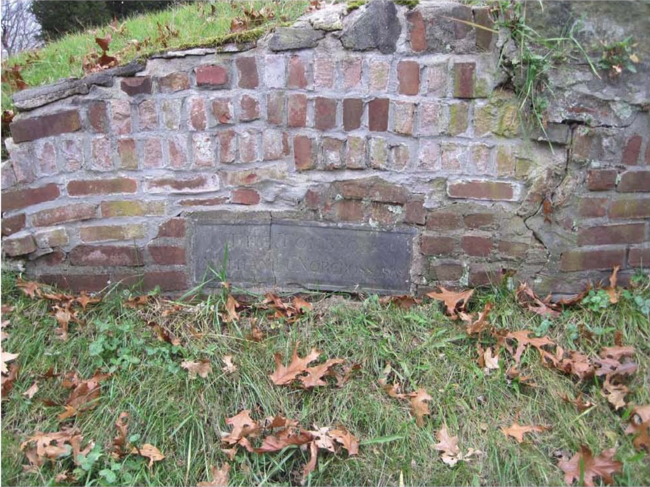
East Parish Burying Ground Tomb 1346