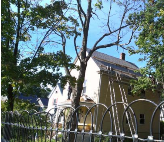
Dead maple tree in West Parish Burying Ground