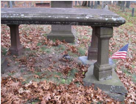
Tomb E-S Jackson