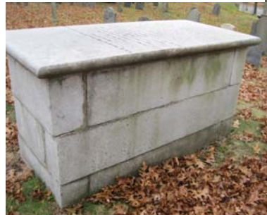
Tomb E-T Jackson