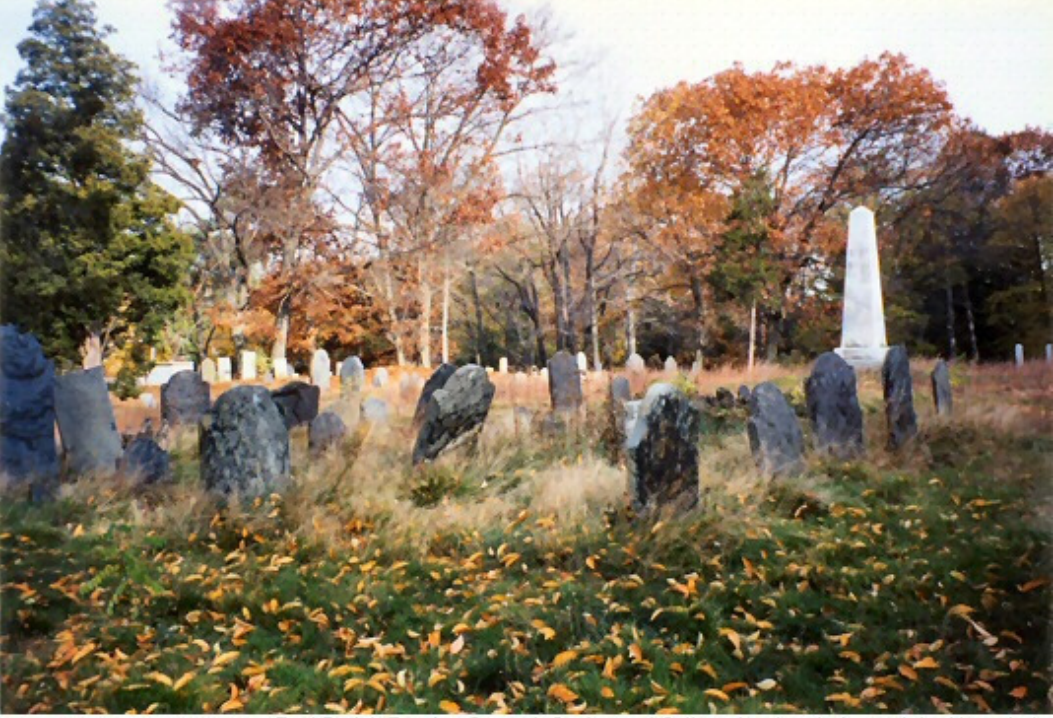
East Parish Burying Ground, Center and Cotton streets