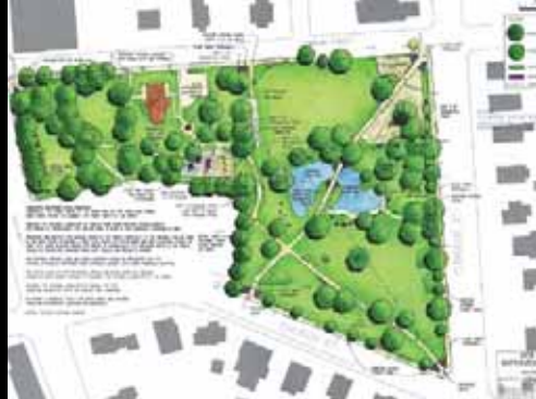
Restoration Map and recommendations, June 06