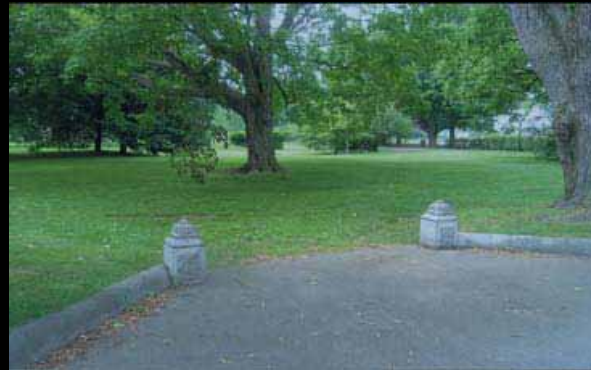
Missing Walkway (Eldredge Street)