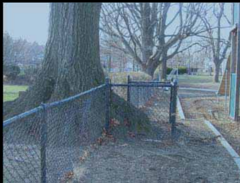
Chain link fence