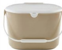
Kitchen Scrap Bucket

$8 Capacity: 2 gal Size: 8.5" x 11.9" x 8.7" Snap lid designed to minimize odors; dishwasher safe