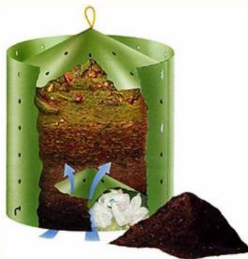
New Age Composter

$25 (resident) $53 (non-resident) Capacity: 24 ft 3 Height: 30" Diameter: Variable