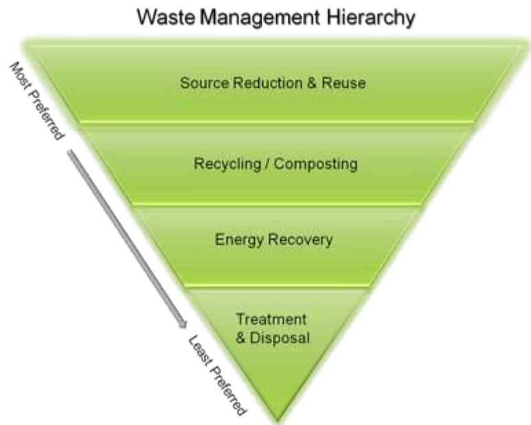
Figure 1. The Waste Management Hierarchy illustrates waste management strategies in order of most preferred to least preferred.

Source reduction is also important in manufacturing. Lightweighting of packaging, reuse, and remanufacturing are all becoming more popular business trends. Two policy strategies that have been used to encourage or require source reduction for the manufacturing sector include product stewardship and extended producer responsibility. As defined by the Product Stewardship Institute, product stewardship occurs when manufacturers minimize negative environmental, health, safety, and social impacts of a product and its packaging throughout all lifecycle stages, while also maximizing economic benefits. Extended producer responsibility (EPR) is a mandatory type of product stewardship that includes, at a minimum, the requirement that the manufacturer's responsibility for its product extends to post-consumer management of that product and its packaging. There are nearly 400 EPR laws in place around the world, including 92 in the U.S, that regulate various material types