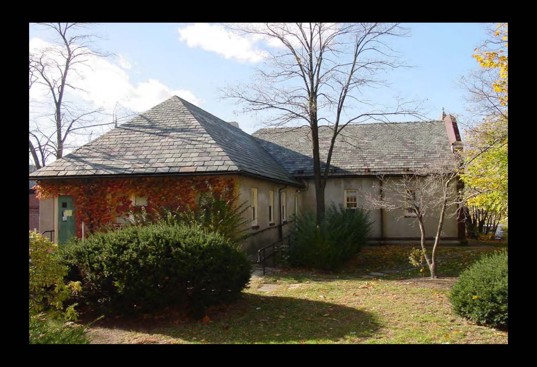
Newton Health Department Facility Restoration – Design Funding