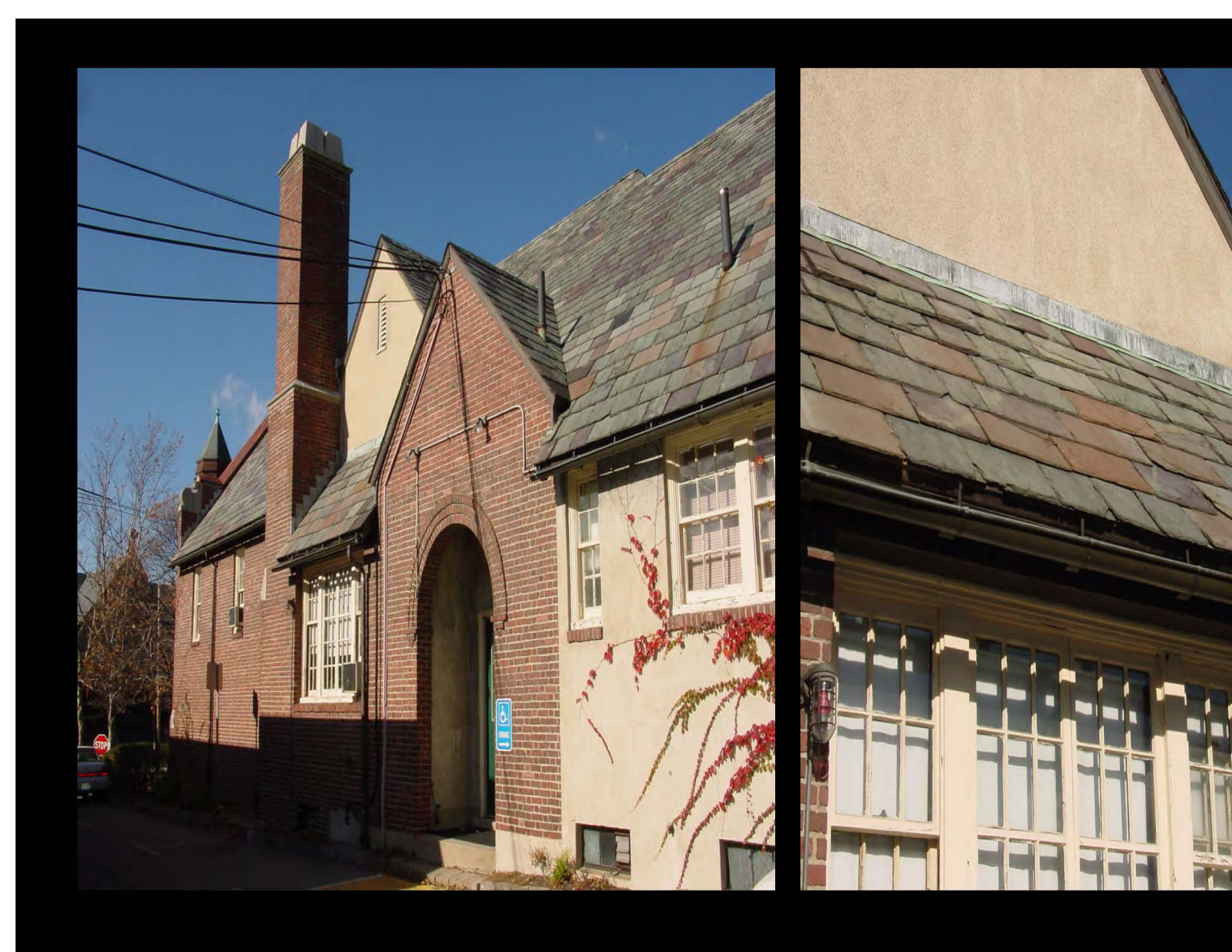
Newton Health Department Facility Restoration Design Funding