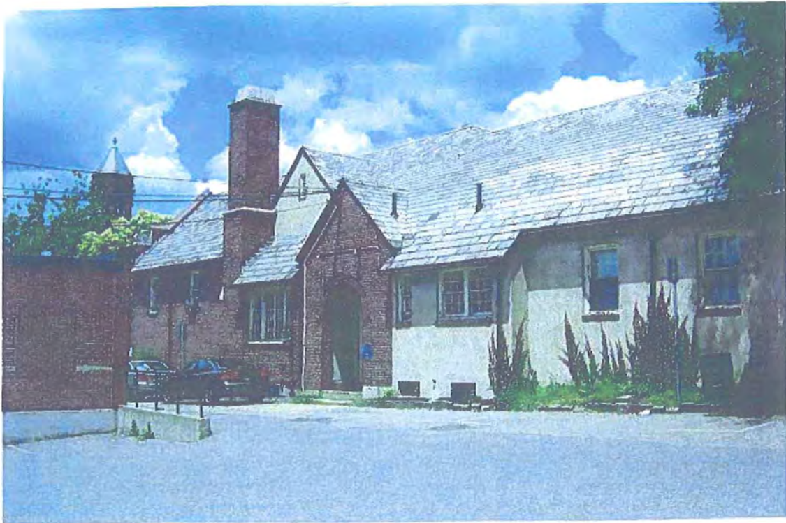
↑ PHOTOGRAPH 1