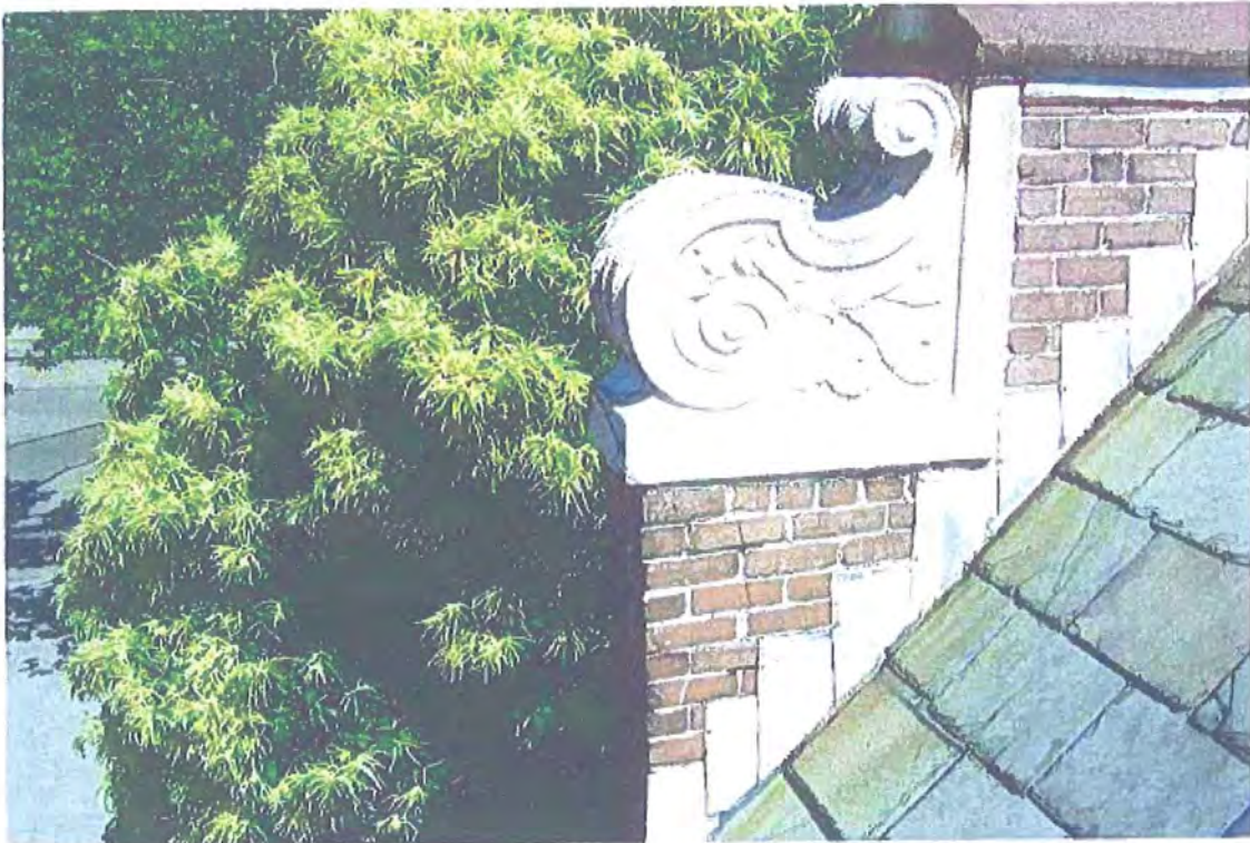
↑ PHOTOGRAPH 9

View of cracking and deteriorated mortar joints below a scrolled capstone on top of the west end wall.