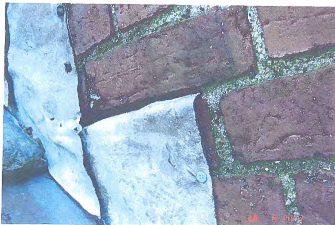
↑ PHOTOGRAPH 12

View of mortar patched brick and the bottom of the coal chute door covered by landscaping mulch.