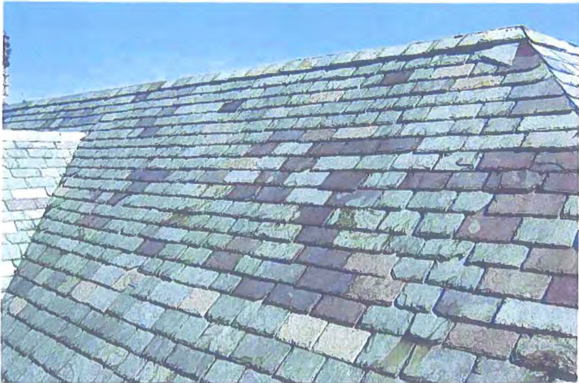
↑ PHOTOGRAPH 17

View of south-sloped roof area on the east half of the east-west wing, showing groups of slates with delaminating surfaces, cracked and broken slates, and an out of position slate at the hip.