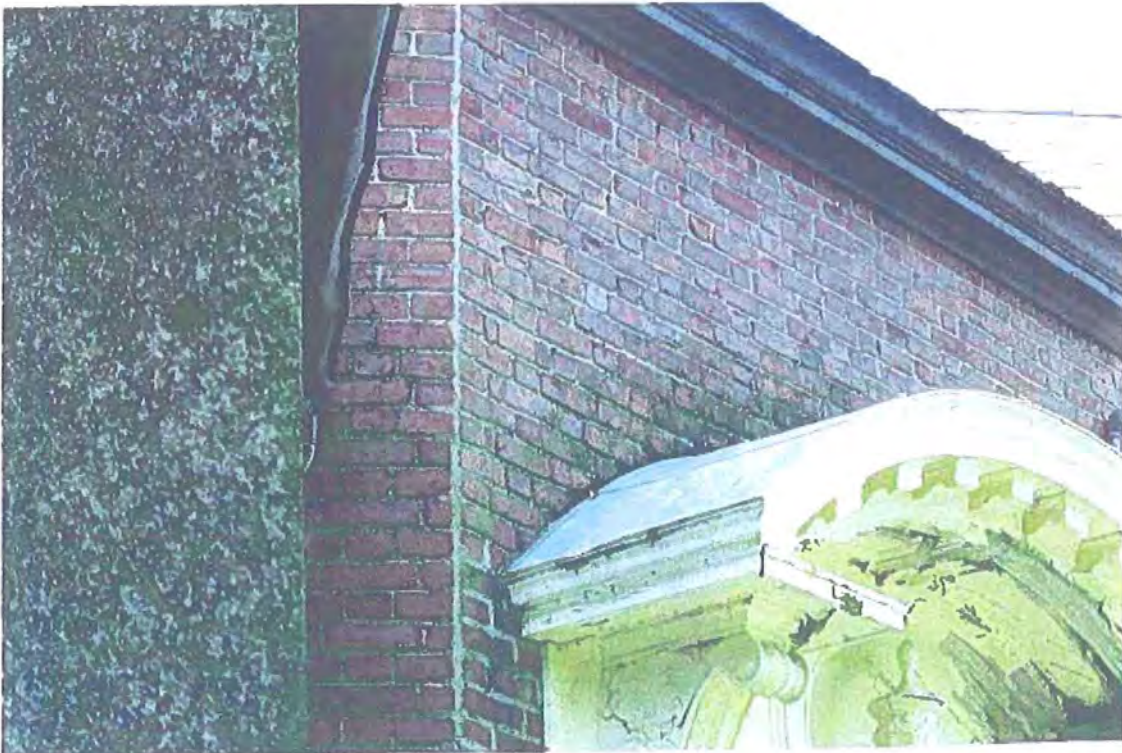
↑ PHOTOGRAPH 10

View of cracking and deteriorated mortar joints below a scrolled capstone on top of the west end wall.