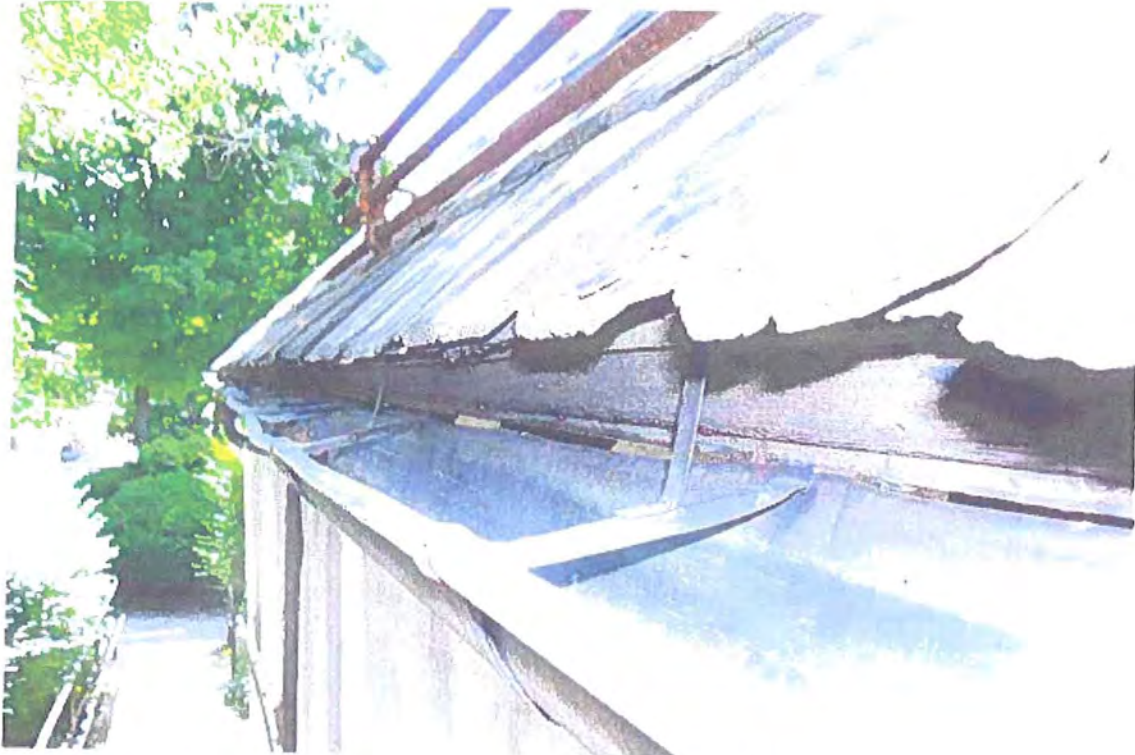
↑ PHOTOGRAPH 24

View of damaged end of gutter on the south elevation between the chimney and south entrance.