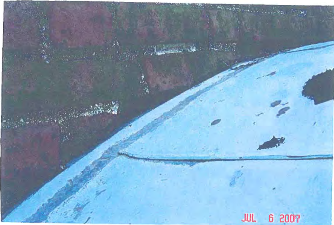
↑ PHOTOGRAPH 15

View of holes in the copper barrel roofing at the front entryway.