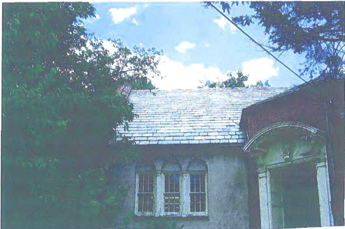
↑ PHOTOGRAPH 2