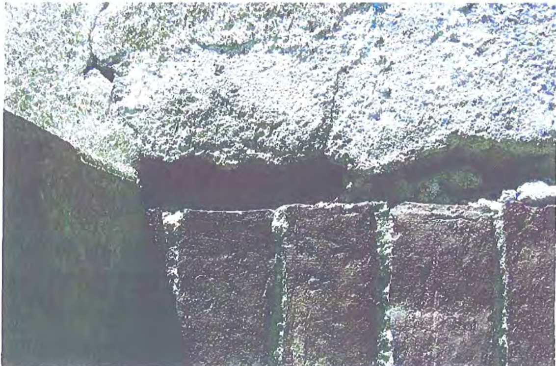
↑ PHOTOGRAPH 14

View of a small spall in the stucco at ground level.