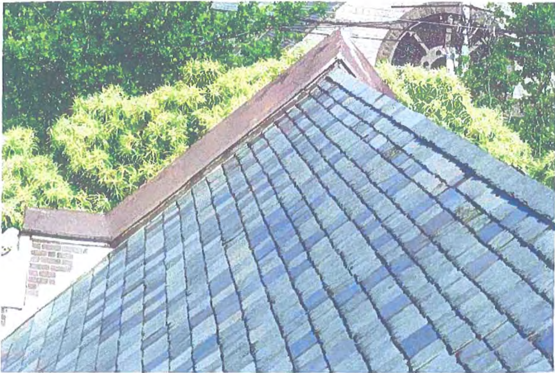
↑ PHOTOGRAPH 19

View of the south slope on the west half of the east-west wing, showing some deteriorated and cracked slate and a rusted cap on the west end wall.