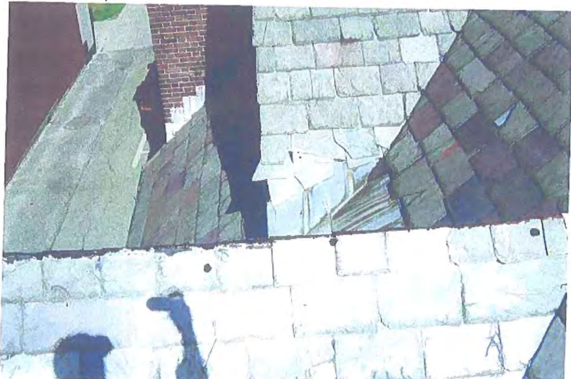
↑ PHOTOGRAPH 18

View of south-sloped roof area on the east half of the east-west wing, showing groups of slates with delaminating surfaces, cracked and broken slates, and an out of position slate at the hip.