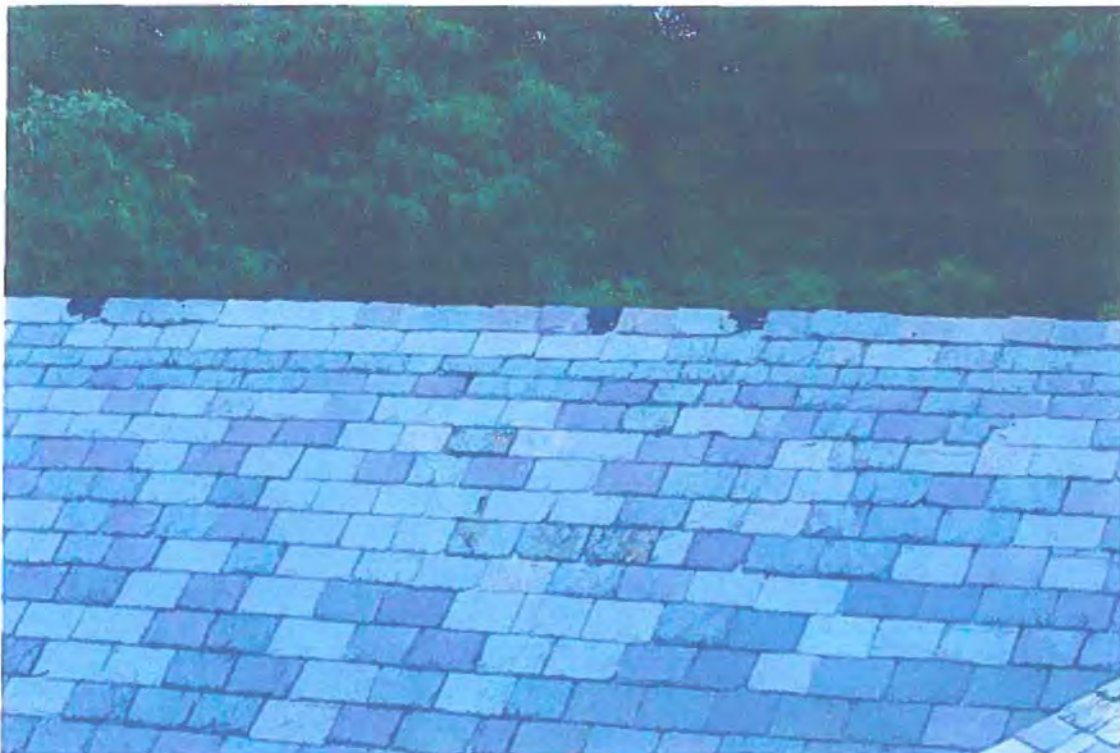
↑ PHOTOGRAPH 20

View of the south slope on the west half of the east-west wing, showing some deteriorated and cracked slate and a rusted cap on the west end wall.