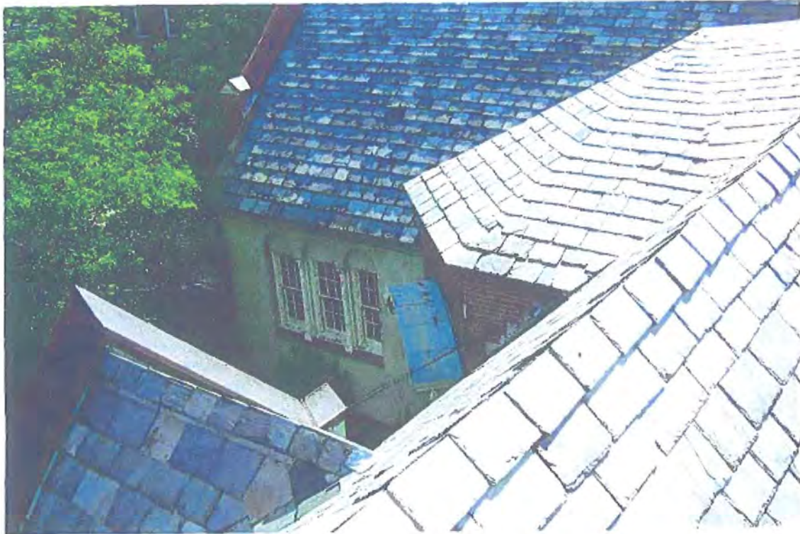
↑ PHOTOGRAPH 21

View of delaminated and broken slates on the fan roof above the main entryway.