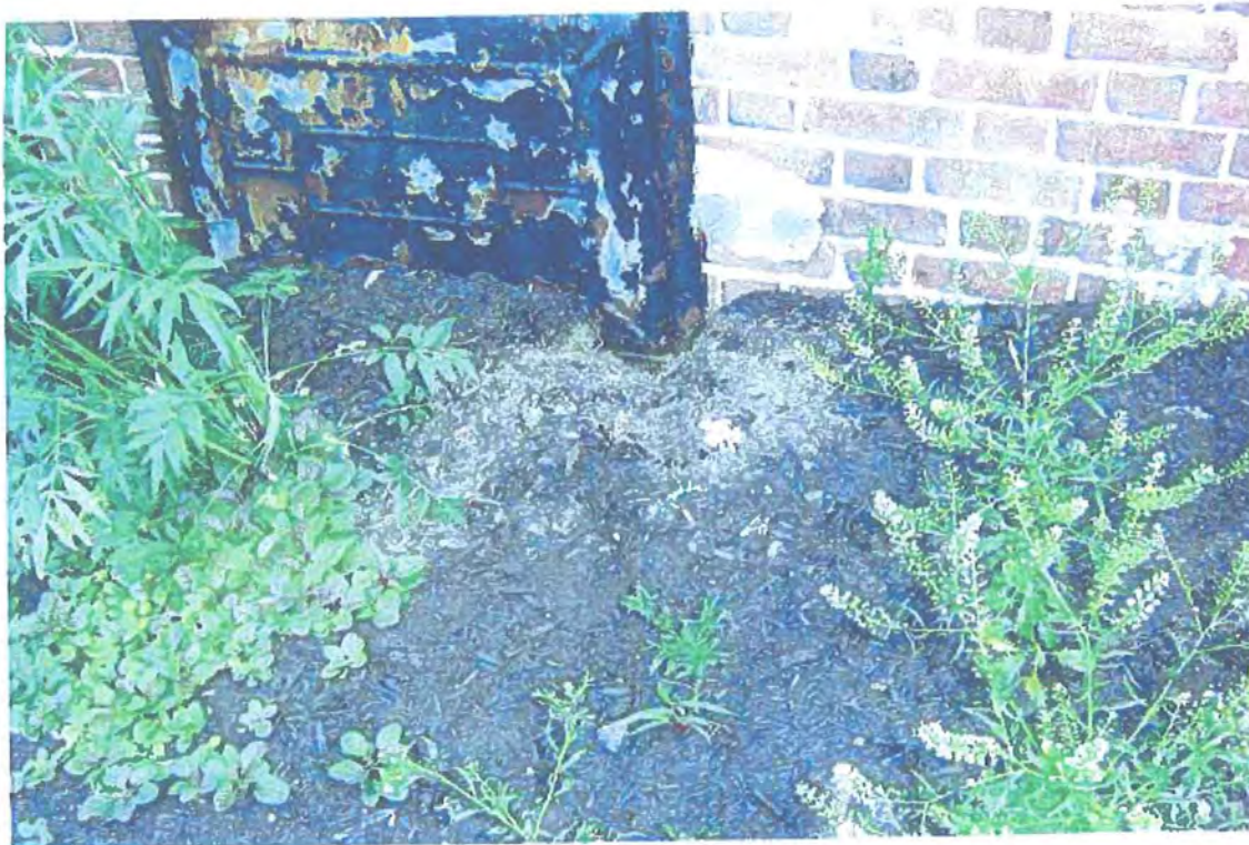
↑ PHOTOGRAPH 11

View of mortar patched brick and the bottom of the coal chute door covered by landscaping mulch.