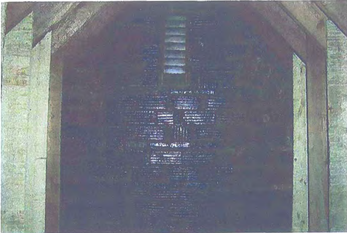
↑ PHOTOGRAPH 5

View of west end wall with discoloration of the mastic on the terra cotta back-up wall due to water penetration.