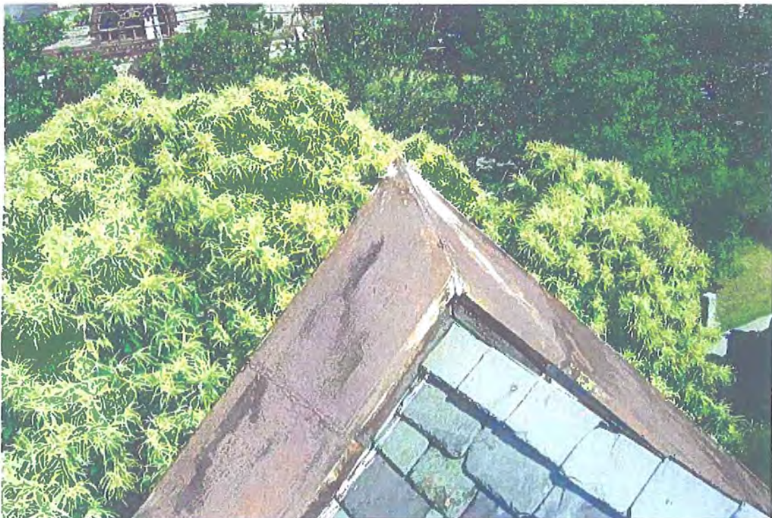
↑ PHOTOGRAPH 22

View of delaminated and broken slates on the fan roof above the main entryway.