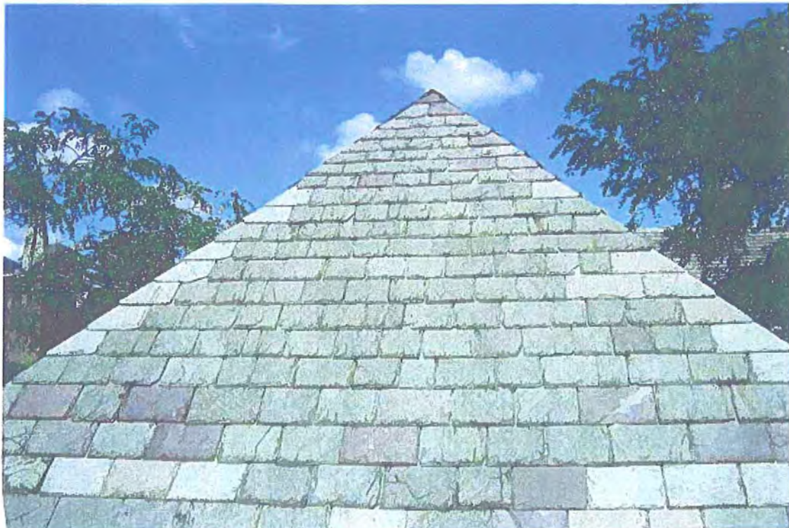
↑ PHOTOGRAPH 16

View of holes in the copper barrel roofing at the front entryway.