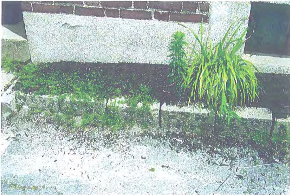
↑ PHOTOGRAPH 13

View of a small spall in the stucco at ground level.