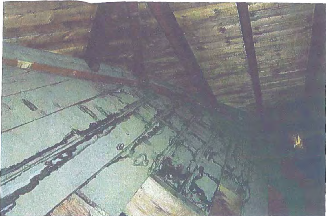
↑ PHOTOGRAPH 4

View in attic of efflorescence on the wall of the chimney and water stains on the roof decking, walls, and framing.