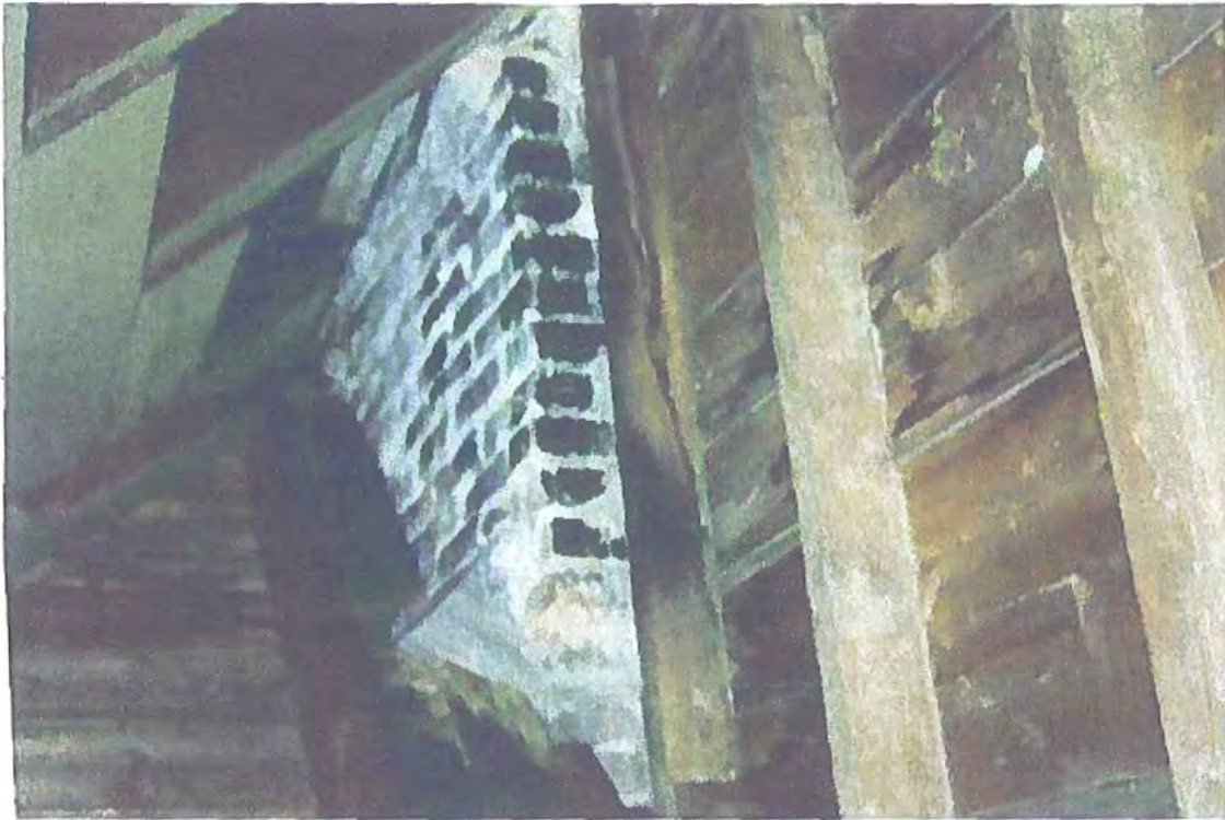
↑ PHOTOGRAPH 3

View in attic of efflorescence on the wall of the chimney and water stains on the roof decking, walls, and framing.