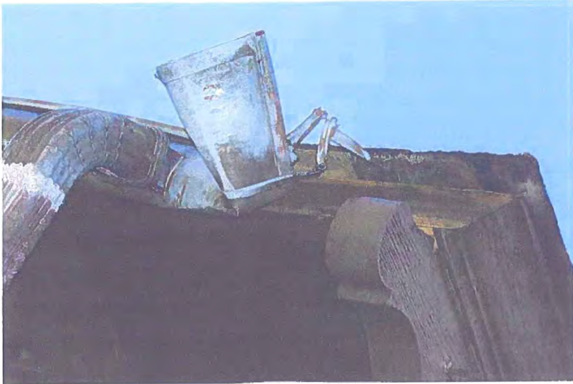
↑ PHOTOGRAPH 23

View of damaged end of gutter on the south elevation between the chimney and south entrance.