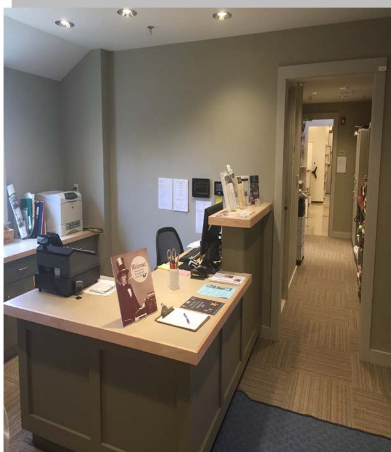
New reception/gift shop area