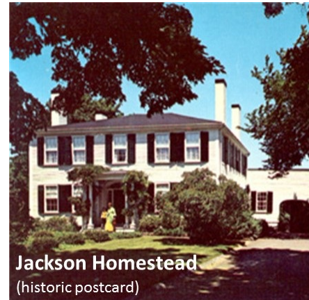
Jackson Homestead (historic postcard)

Note: The Jackson Homestead is owned by the City of Newton. Funds for work on the building must be appropriated to the control of the Public Buildings Department.