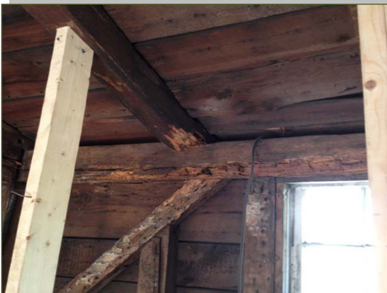
Rotted beam with temporary support