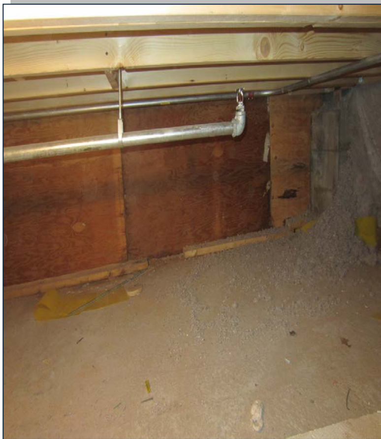
New sprinkler head under the deck