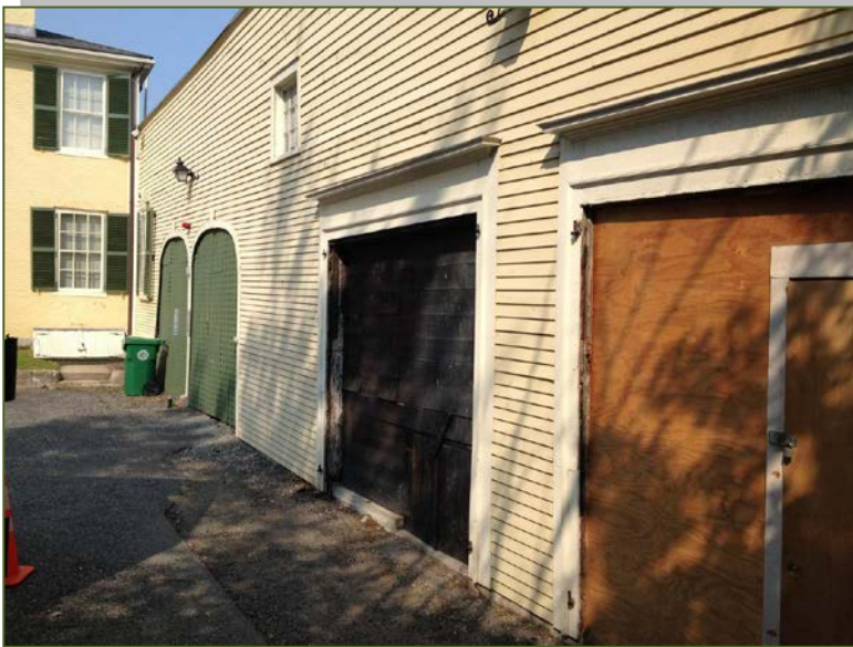
Demolition of exterior doors