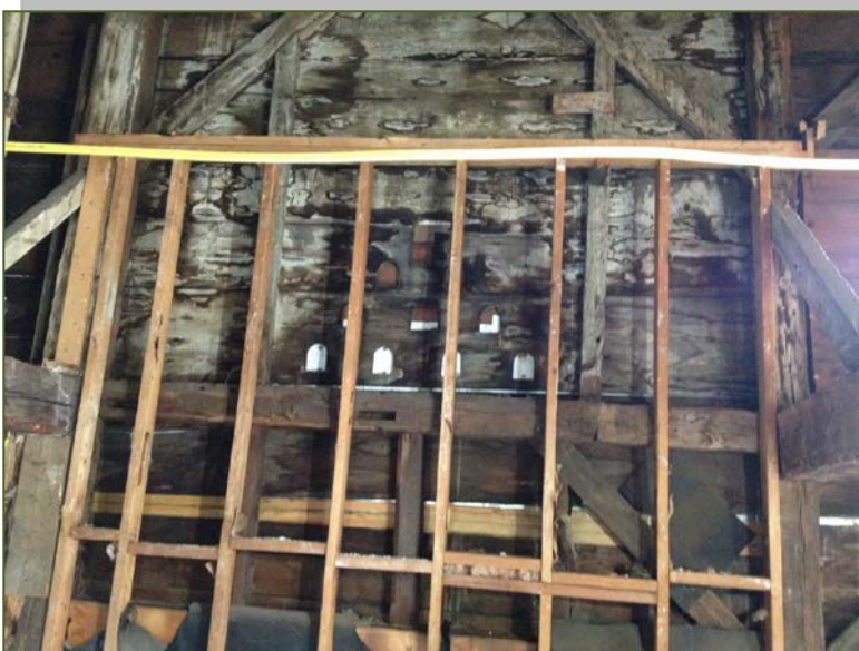
Interior demolition inside the ELL