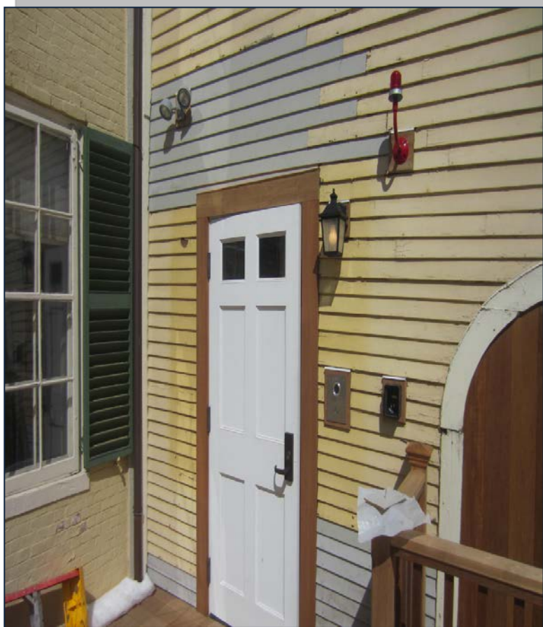
New entrance door