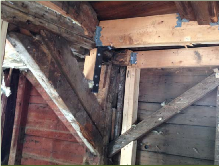
Rotted and missing beam & column with previous repairs