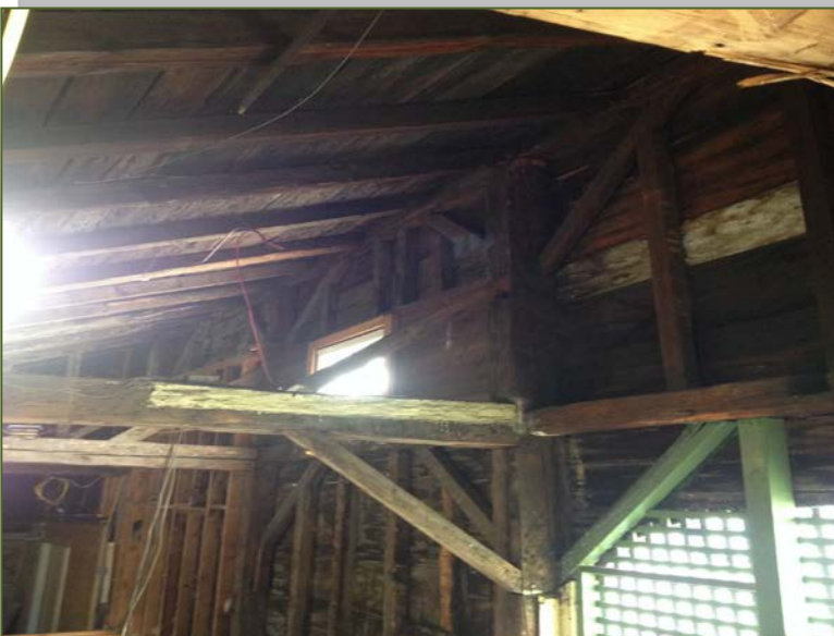
Interior view of the structure after demolition