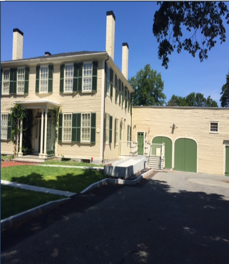
New H.C. walkway, ramp and deck