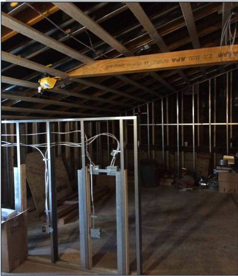
New framing for the archive space