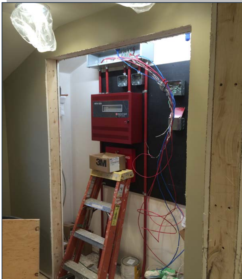
New fire alarm panel