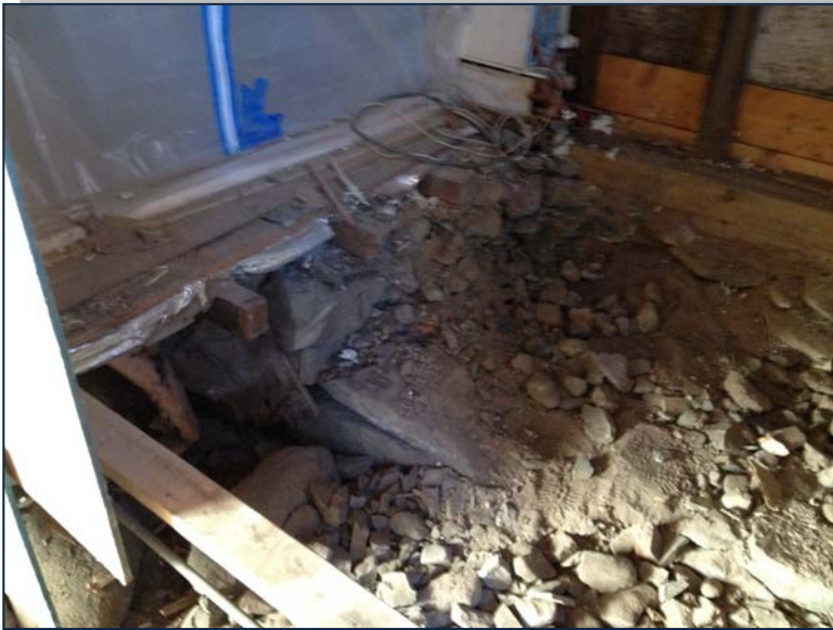
Deteriorated shallow foundation under exterior walls corner at the ELL building