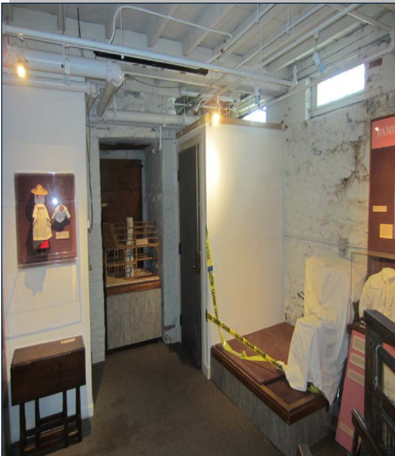
New sprinkler room in the basement & sprinkler pipes in the ceiling