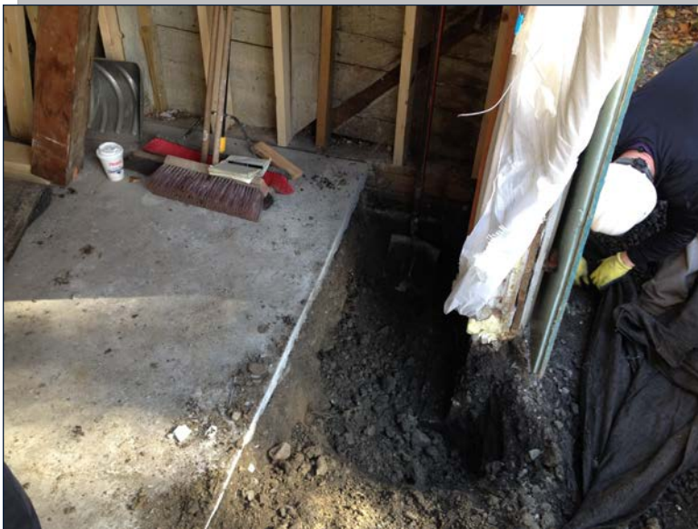
Shallow foundation at the old doors Street Digging For the New water Line For the Sprinkler