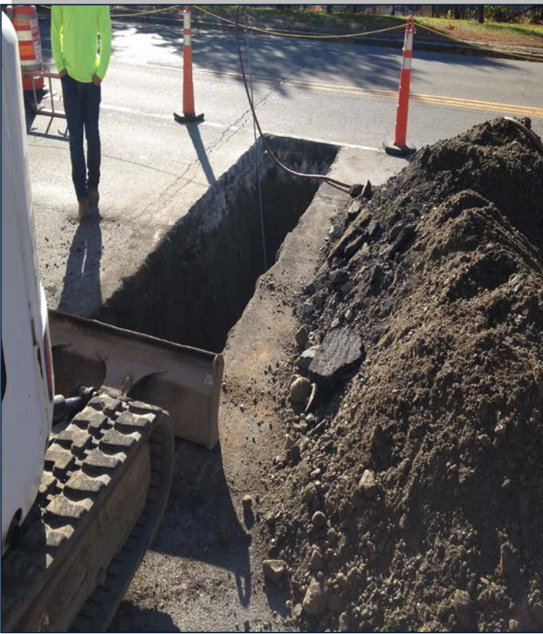
Street digging for the new water line for the sprinkler system