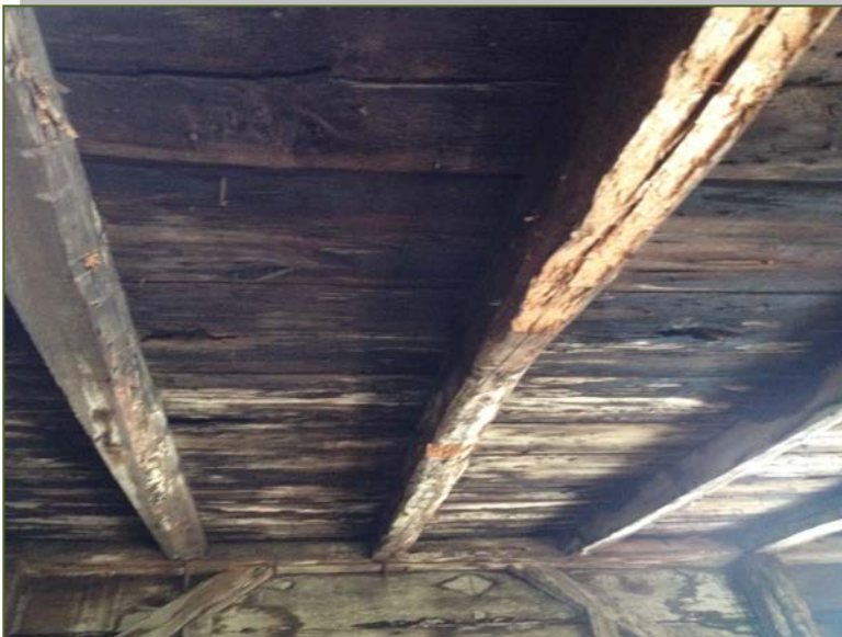
Rotted roof rafters and planks