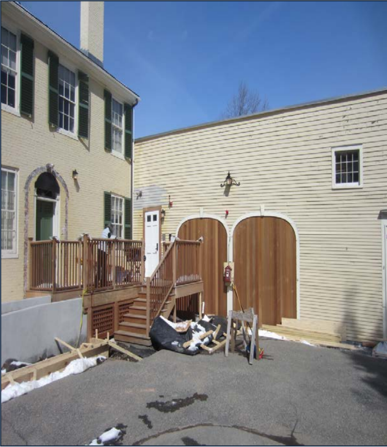
New deck and entrance