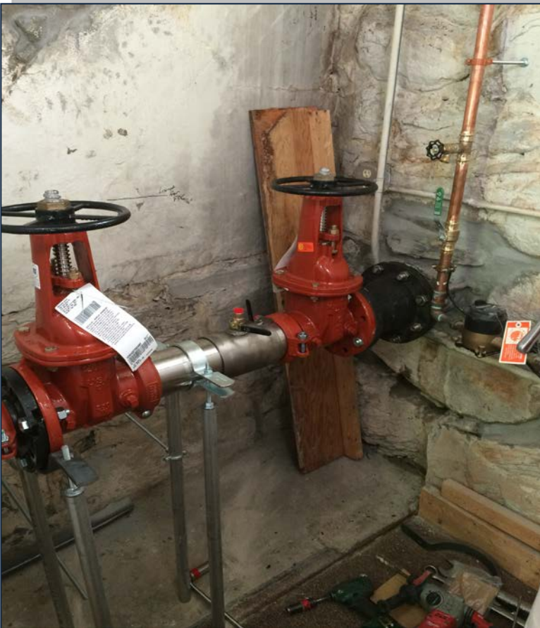
New water line inside the building for the new sprinkler system