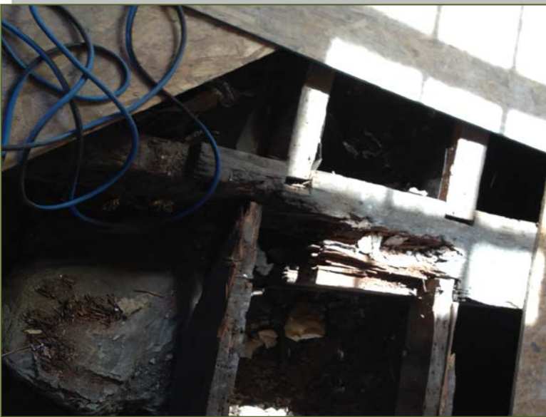
Interior demolition Inside the ELL Showing rotted wood members