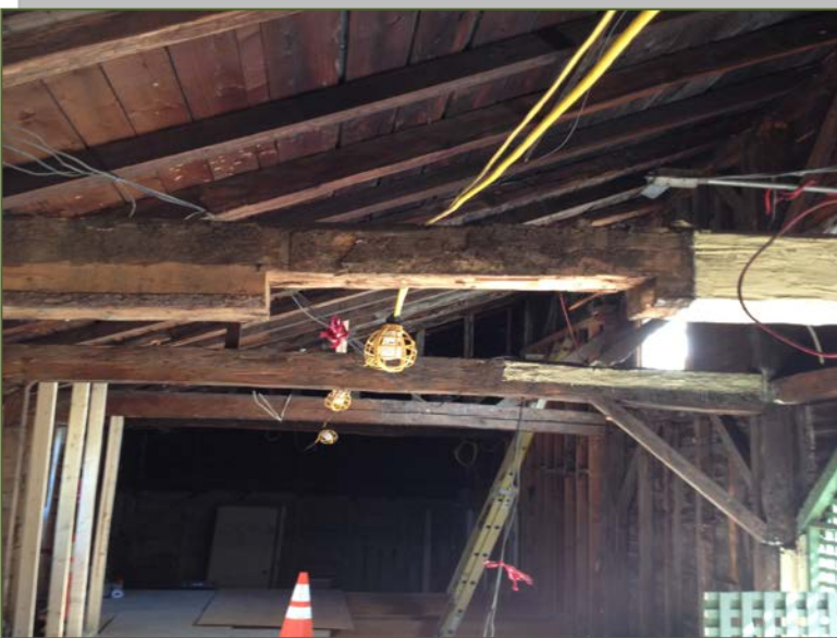
General demolition view with temporary support To the existing structure