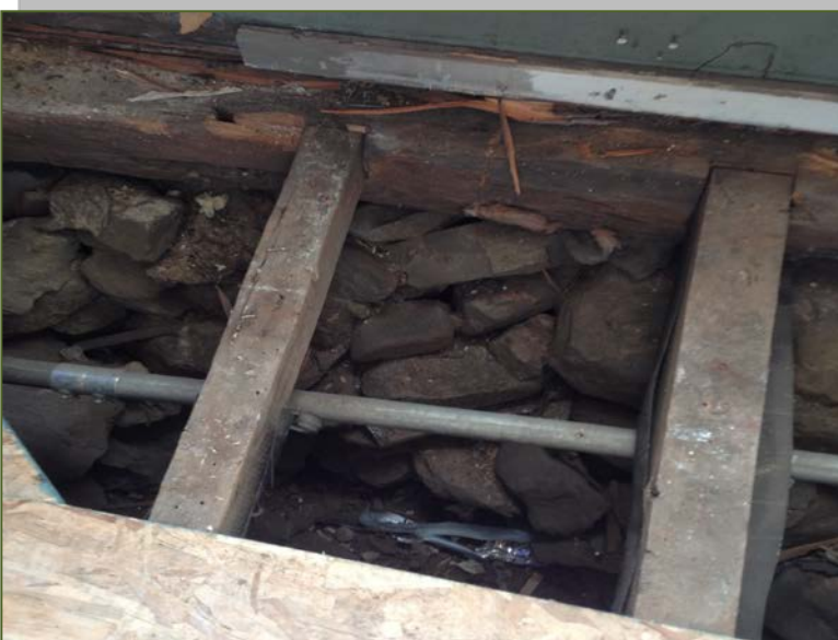
Rubble foundation under walls