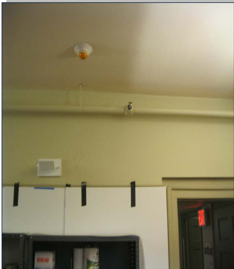
New fire alarm device and sprinkler pipe in an exhibit room