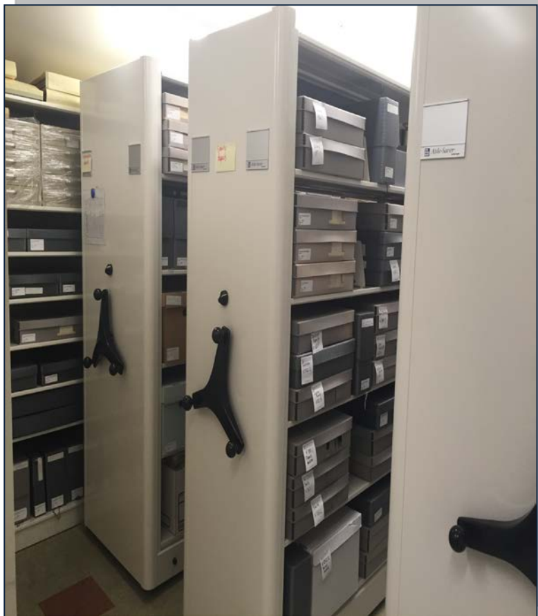
New shelves for the archive