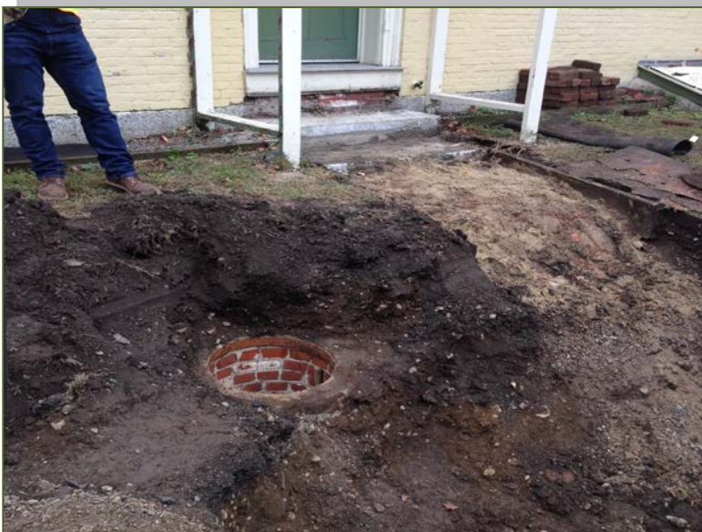
Site demolition & the unforeseen buried manhole under ramp