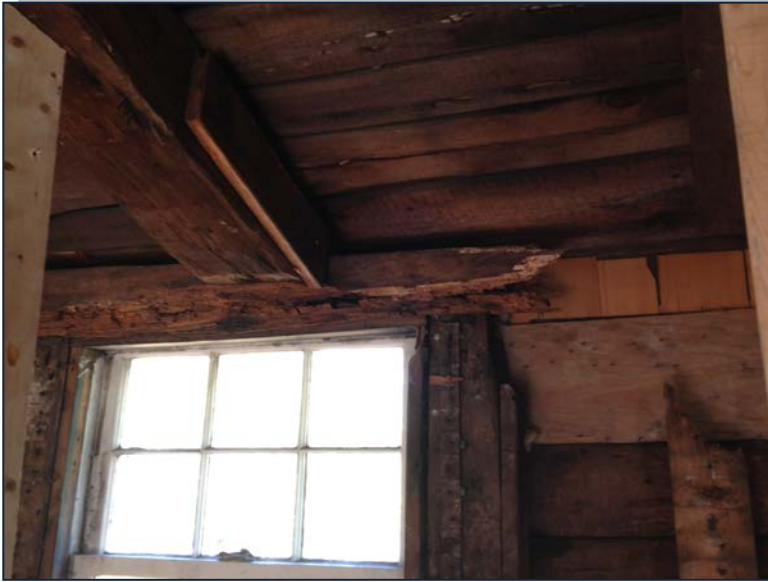
Rotted and missing beam