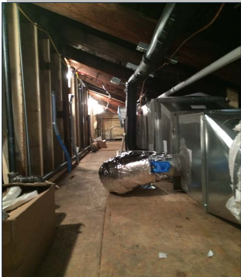
New HVAC system in the ELL's attic