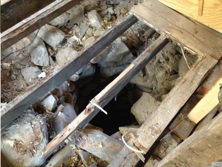
Abandoned well & rotted floor joists