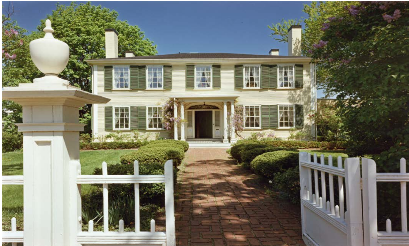
The Jackson Homestead and Museum