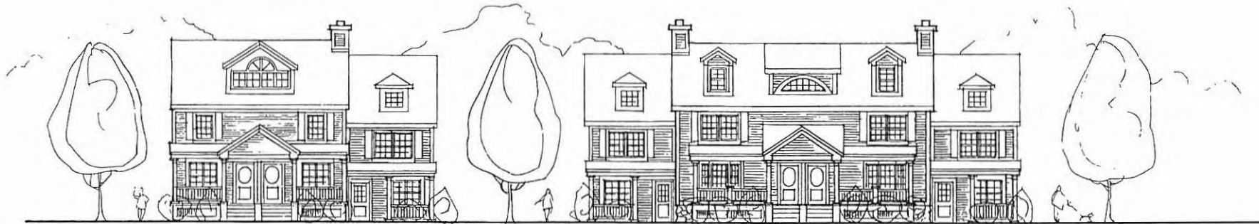
○ Proposed Curve Street Elevation

AAK+AIA ANGELO A. KYRIAKIDES PC ARCHITECT Proposed Curve Street Affordable Housing Development Musket Villages Community Development Corp. 21 Curve Street West Newton, MA.