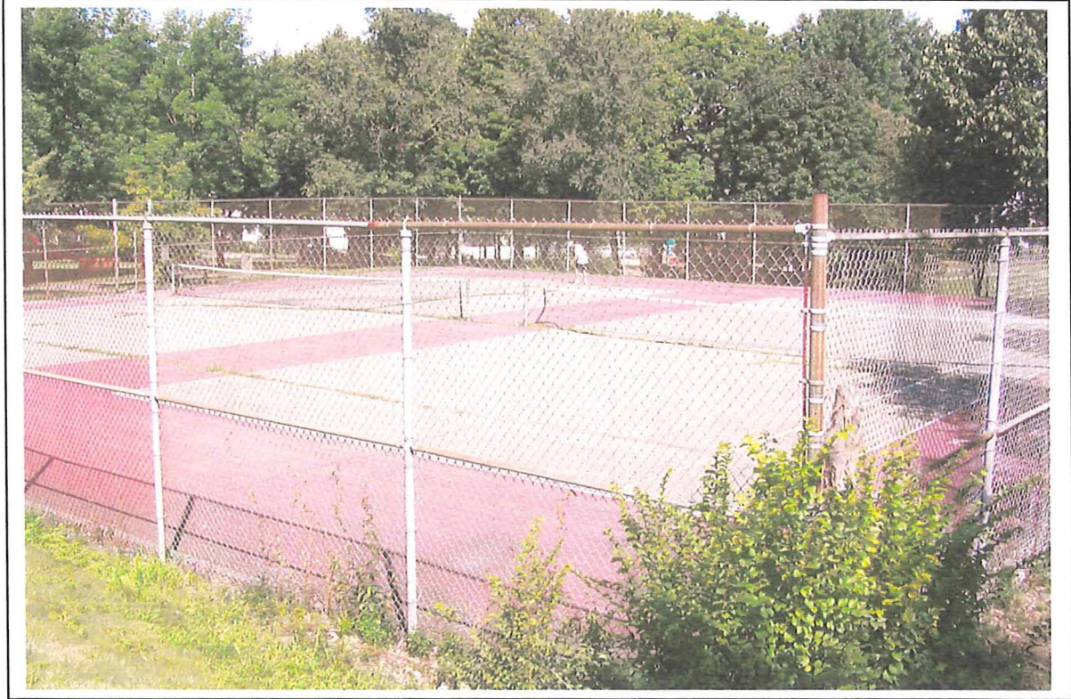
Phase 1: Reconstruction of Tennis Courts and Establishment of Walkway to New Senior Housing- Nonantum Village Place (walkway is proposed for area behind fencing)