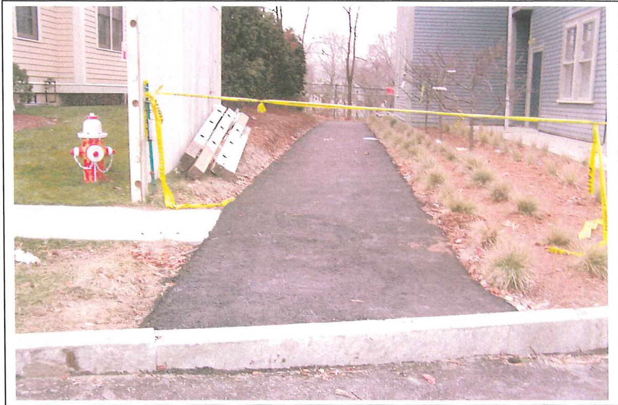
Phase 1: Establishment of Walkway to Connect to Nonantum Village Place Walkway