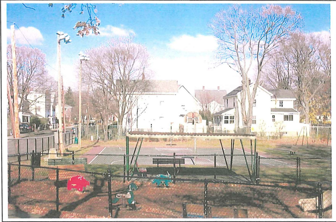
Phase 1: Create Large Play Area, Use Rubberized Safety Surfacing, Diversify Play Structures, Construct Half-Basketball Court, Install Decorative Fencing and Add Landscaping