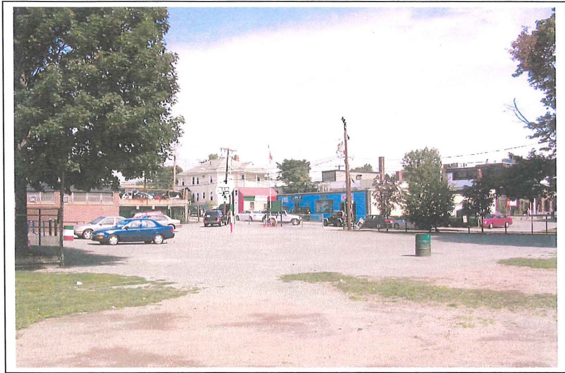
Phase 1: Construct Defined Parking Lot, Create New Pedestrian Pathway from Street to Activity Building, Improve Curb Appeal through Landscaping and Entrance Garden