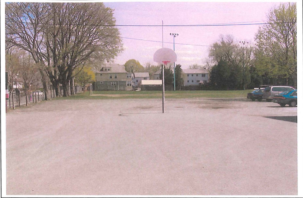
Phase 1: Installation of New and Separate Half Basketball Court and New Water Play Area in the Courtyard (current basketball court is on the parking lot, current water feature is harsh and operates infrequently)