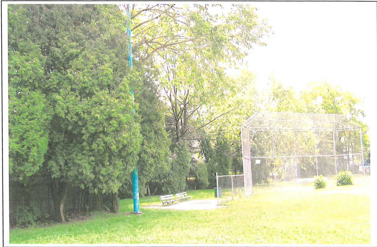
Phase 2: Shift Softball Field into Corner, Restore Field, Install New Backstop and Player's Benches, Establish New Accessible Pathway to Ball Field and New Bleachers