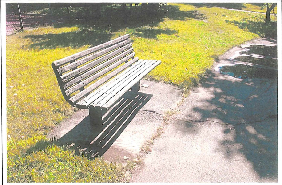
Phase 2: Replacement of Old Site Equipment with New and Preservation of Ball Field