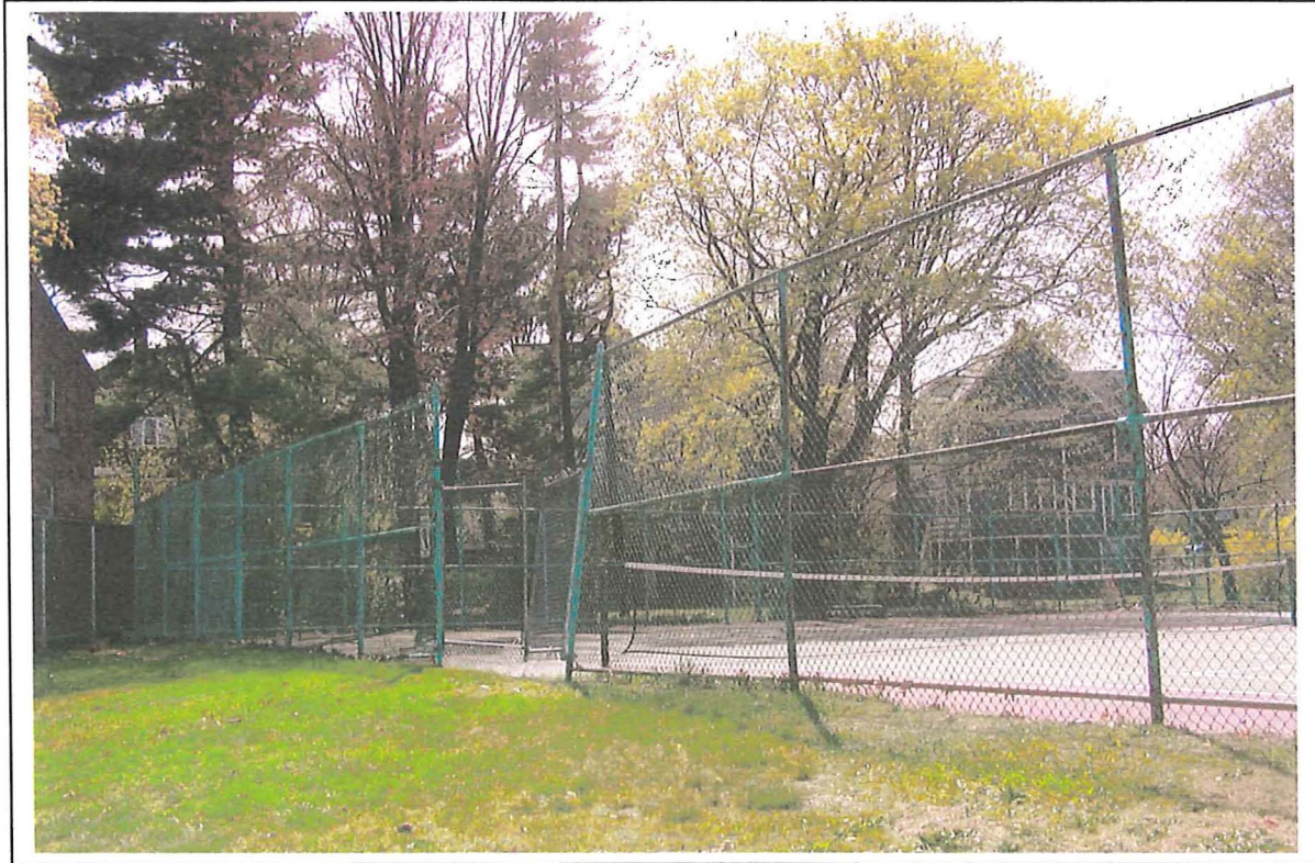
Phase 2: Install New Fencing Around Tennis Courts and Park Borders