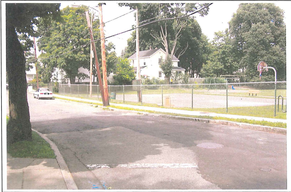
Phase 1: Improve Curb Appeal and Reorganize and Consolidate Play Areas