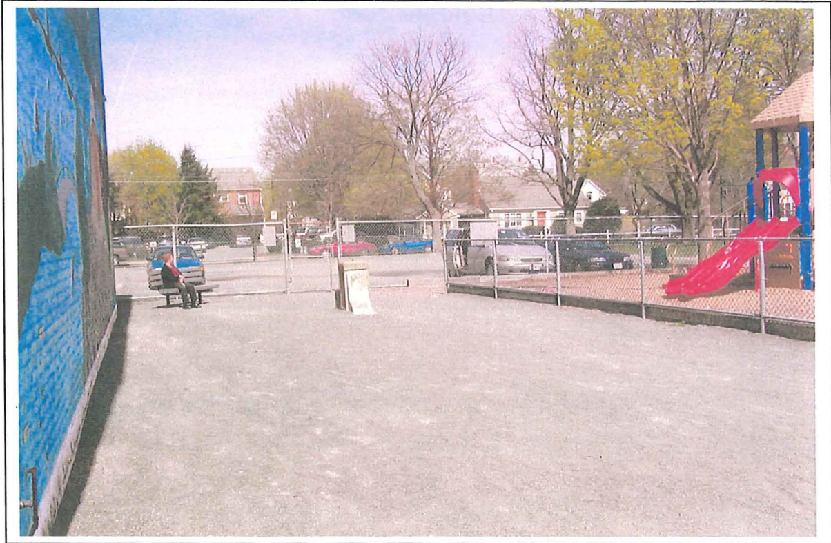
Phase 1: Redefine and Better Utilize Courtyard for Multiple Purposes, Create Better, Continuous Accessible Pathways