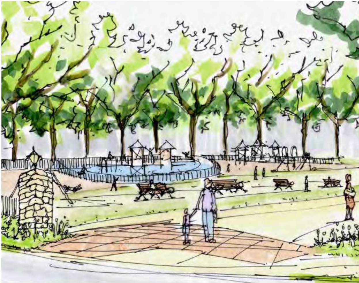
Proposed Park Entrance, Dedham Street (Weston & Sampson, 2008)