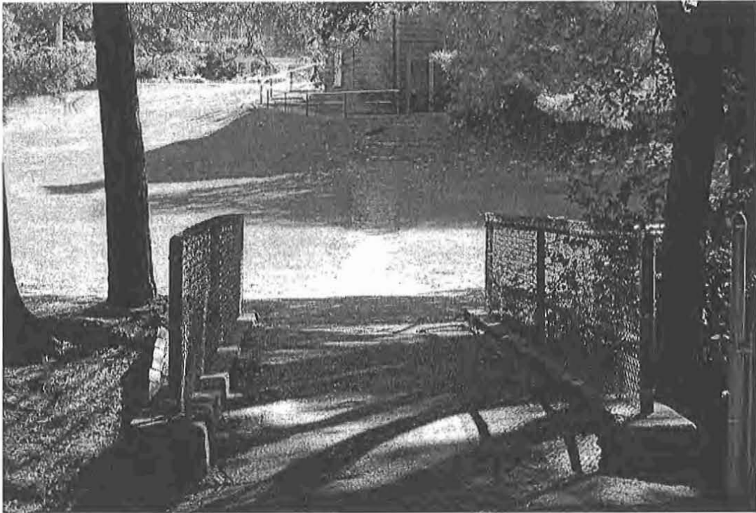
Access from the Tyler Terrace side