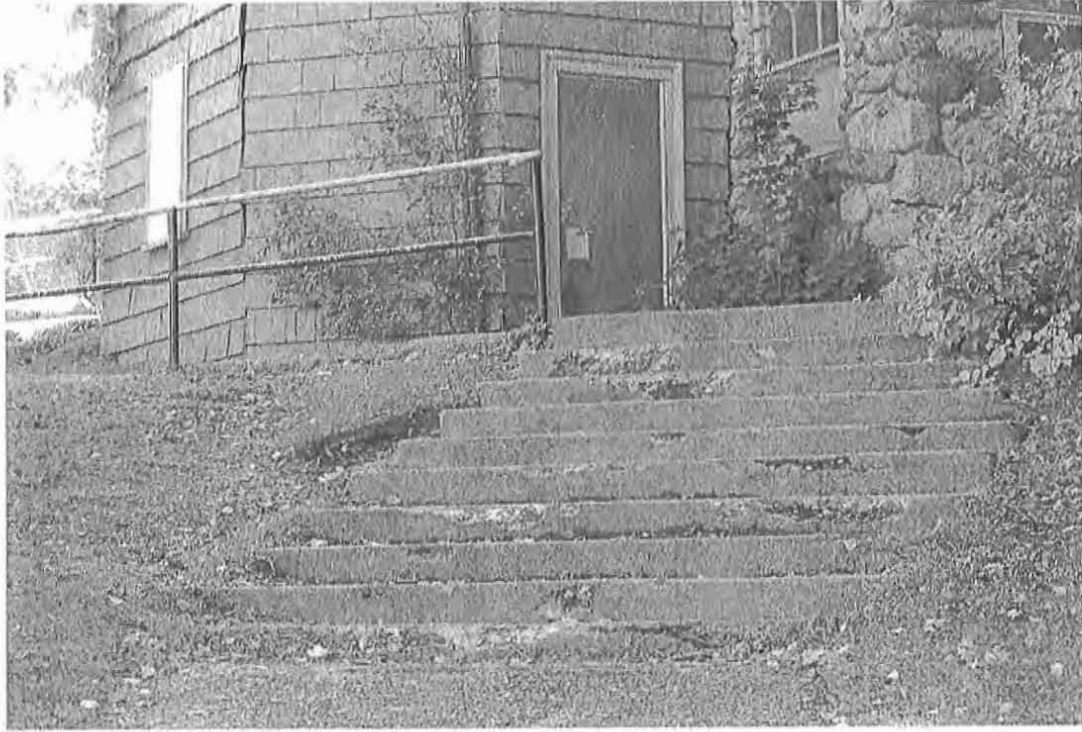
“the Hut” staircase