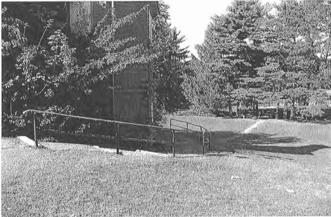
Access route to and from “the Hut”