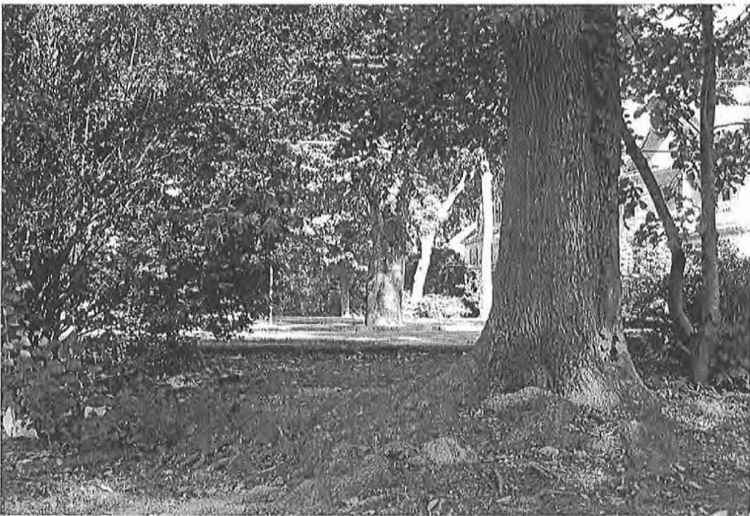
Homer Street pedestrian entrance