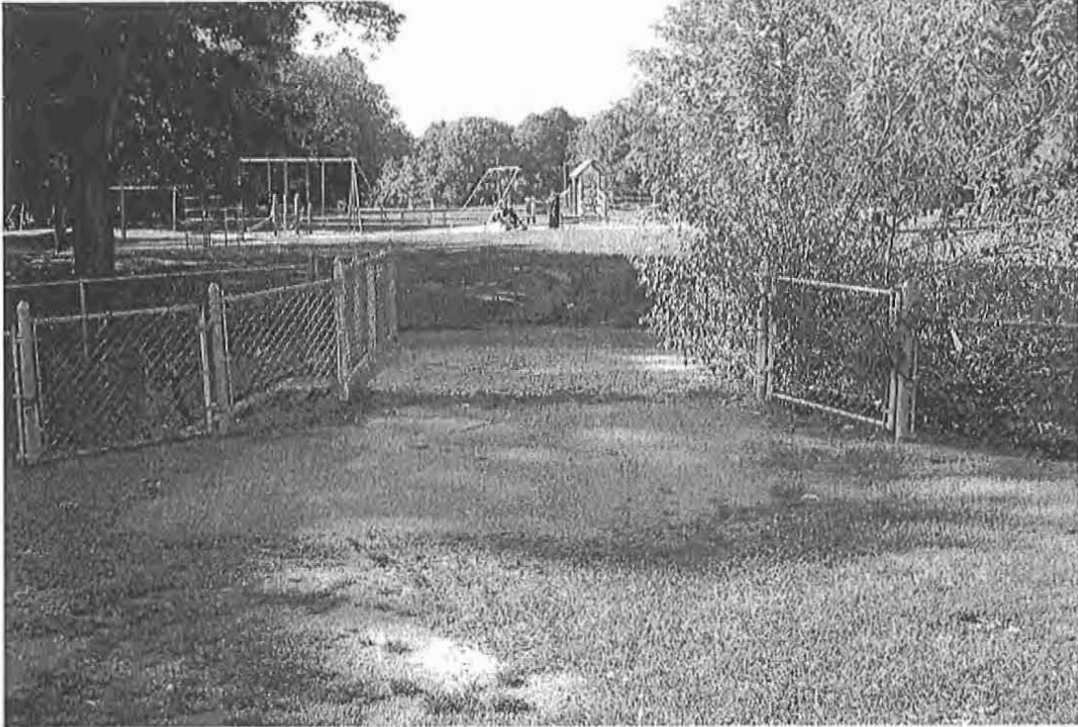
Access into the existing central play area from Bowen Street side