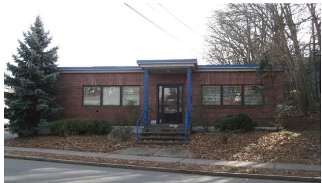
1185 Chestnut Street

The Applicant is a Cannabis Control Commission certified Economic Empowerment Applicant with a diverse management team experienced in community relations, and the cannabis industry. The Applicant has a well-developed security plan and a strong plan to positively affect areas of disproportionate impact. The Site is located in an area with a diversity of uses, and the Applicant will renovate the existing structure. Detailed below are the specific criteria reviewed as part of the Advisory Group’s due diligence function.