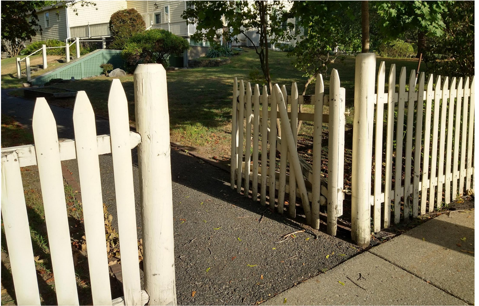
Jackson Homestead, 2020. West picket fence