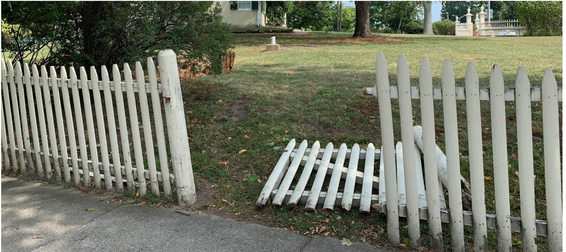
Jackson Homestead, 2020. West picket fence