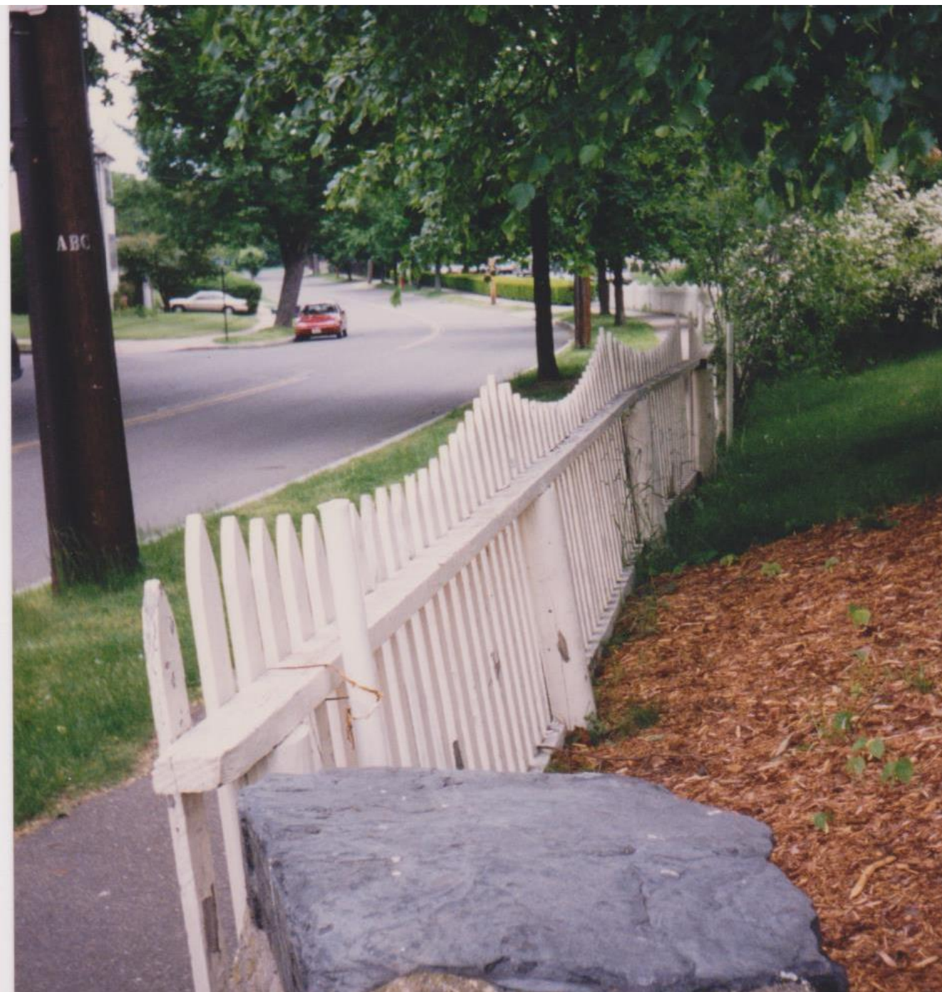
Jackson Homestead, 1997. West picket fence