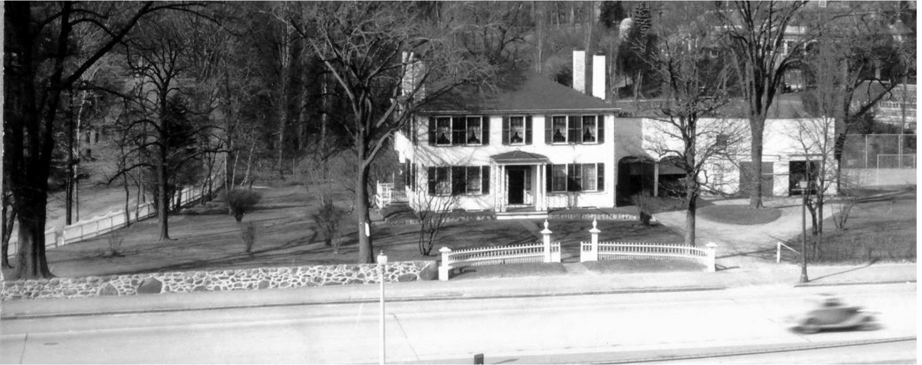
Jackson Homestead, 1940s