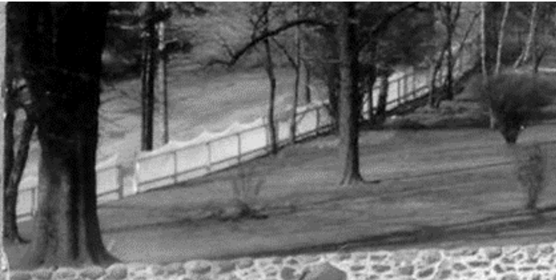
Jackson Homestead, 1940s. Detail, west picket fence