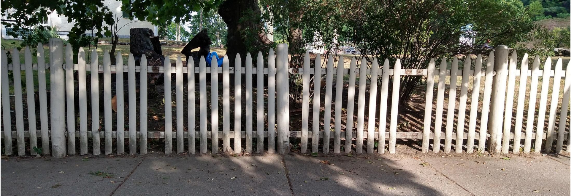
Jackson Homestead, 2020. West picket fence