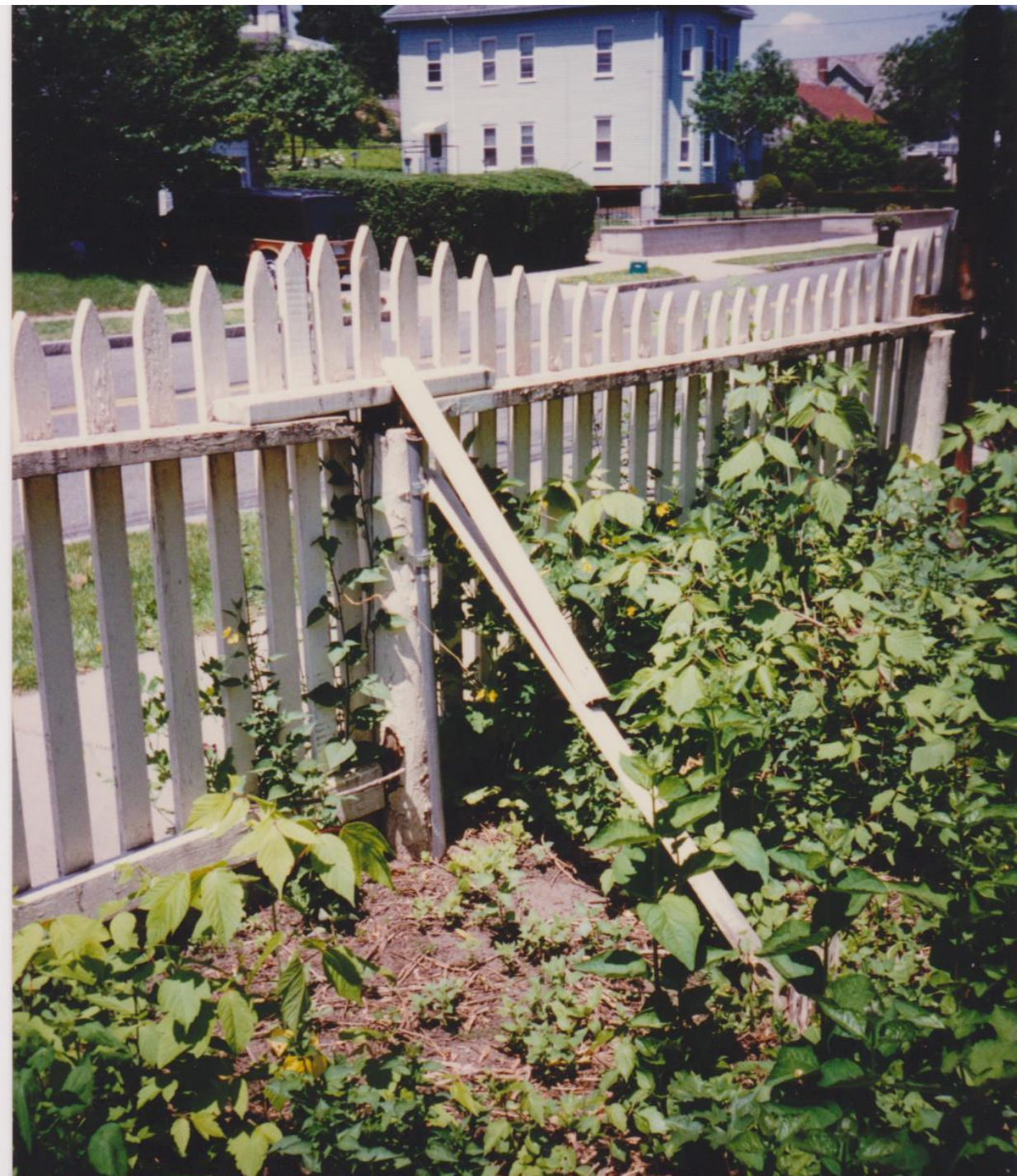
Jackson Homestead, 1997. West picket fence