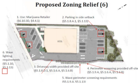
Current Union Twist Proposal