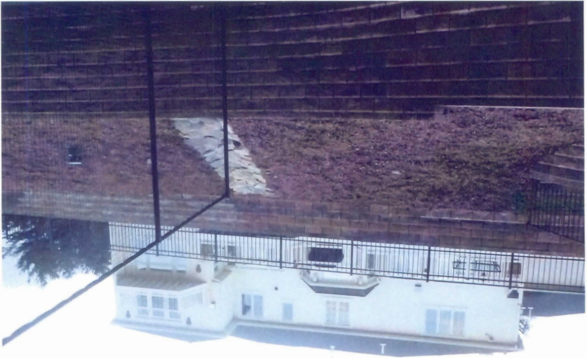
#4 Rear of 37 Baldpate Hill Rd. - looking down at edge of flat grassed rear yard level and lowest level with basketball court