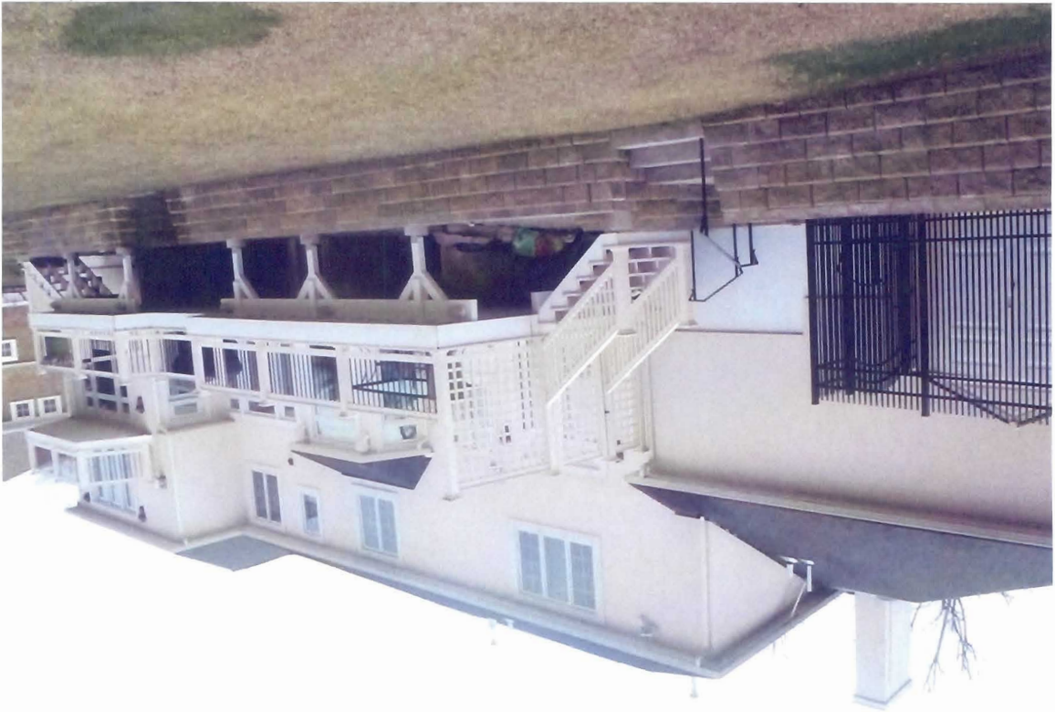
#2 Front of 37 Baldpate Hill Rd. facing street – front yard and street are the “upper” level