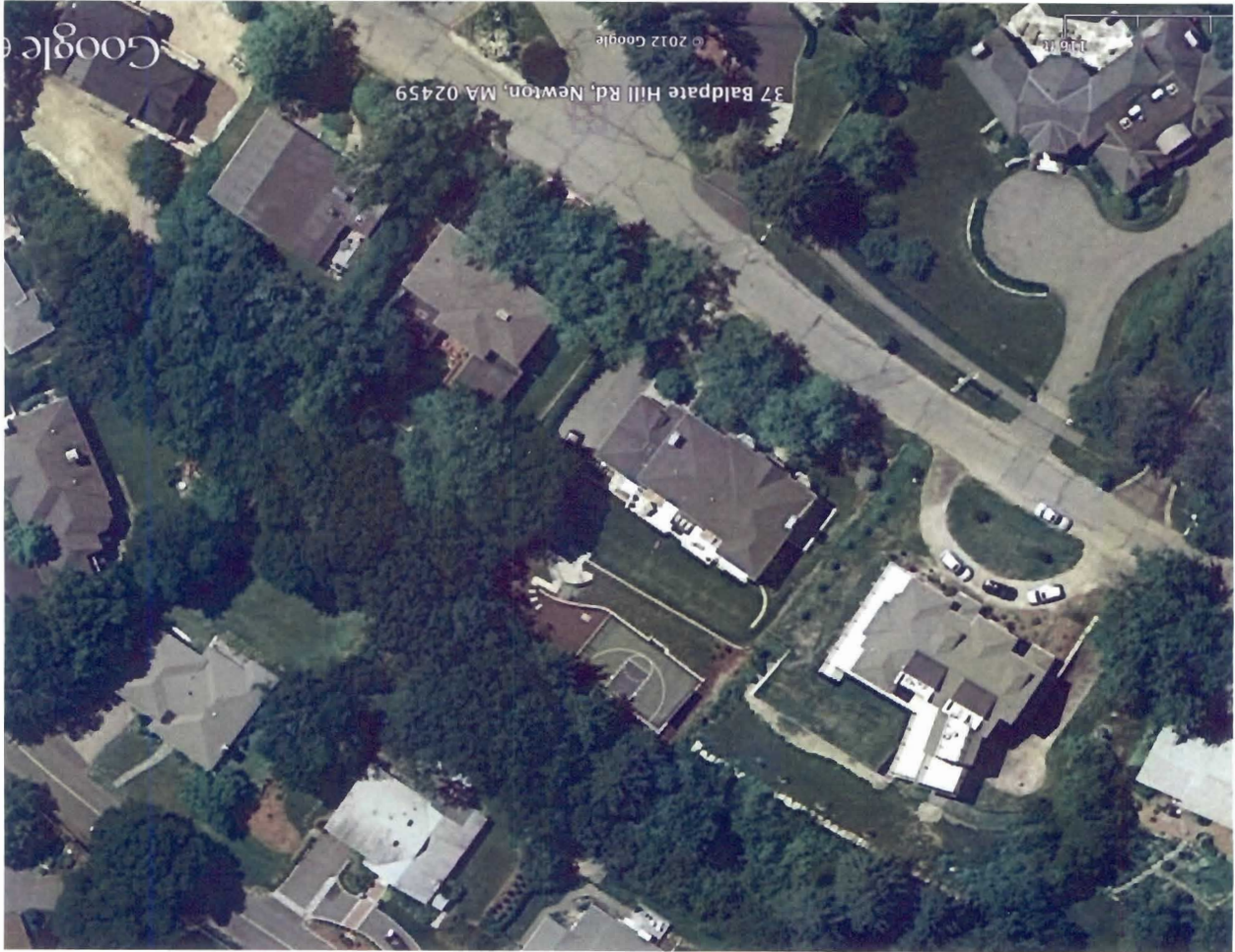
Photos of 37 Baldpate Hill Road

#1 Google Aerial of #37 Baldpate Hill Road