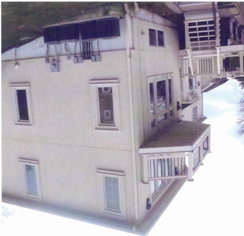
#6 At top of stairs leading from rear grassed area to the lowest level containing the basketball court