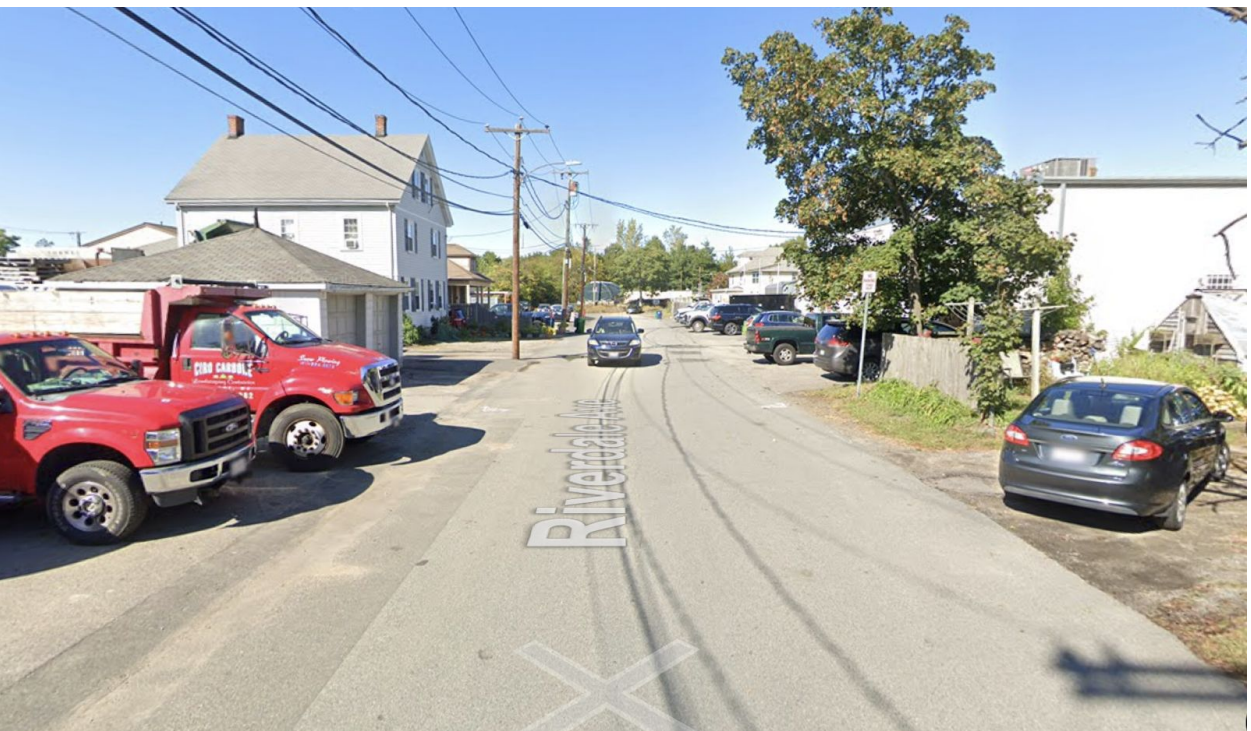
Current conditions on Los Angeles St. and Riverdale Ave. between California Street and the front of the proposed site. Neither street has sidewalks. Commercial vehicles and informal parking are a hazard for bicyclists and pedestrians. No universal accessibility to the front of the site.