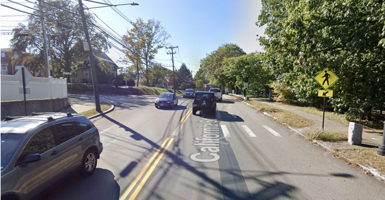
Current conditions of pedestrian desire lines across California Street. Top: Los Angeles Street near the Stop and Shop. Bottom: Chapel Street across from the entrance to the Charles River multi-use paths, which connects directly to the rear of the proposed development.