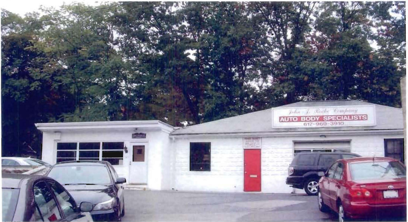
2. 740 Beacon Street (and 0 Union Street – close-up)