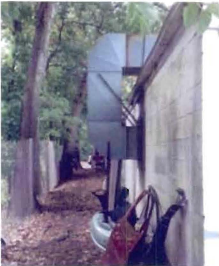
13. View from East of Rear of Building and Rear Lot Line