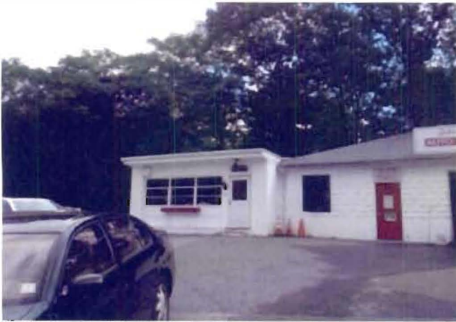
10. View from North of Office (left) and Work Area (right)