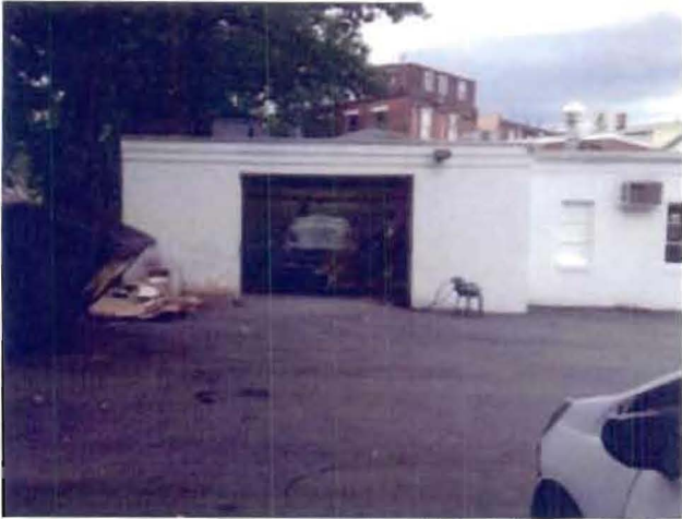
12. View from East of Easterly Side of Work Area and Office