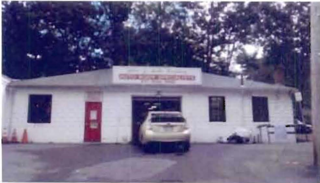
11. Another View from North of Work Area