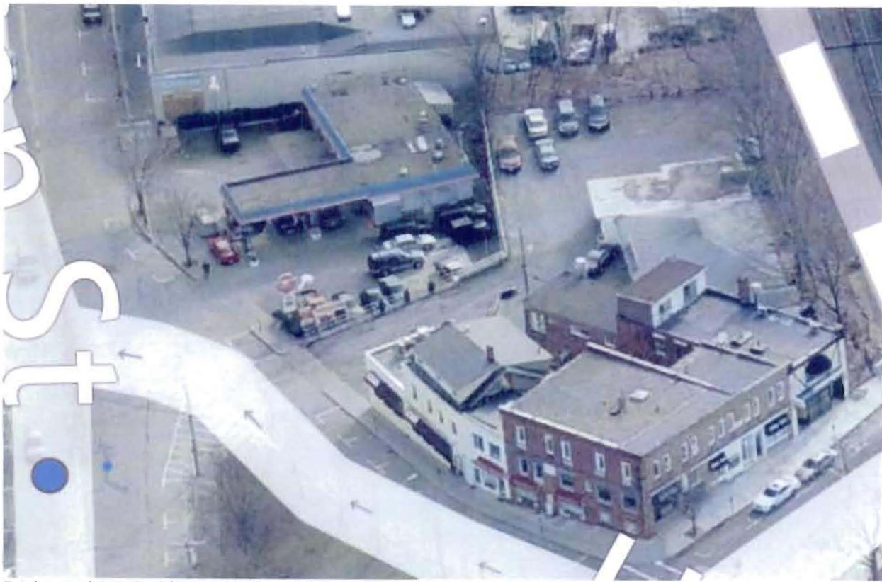
7. Bing Aerial Ortho of Property Viewed from West