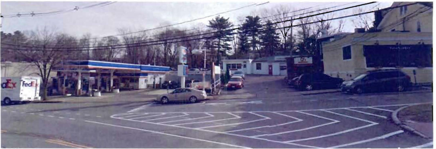
1. 740 Beacon Street (and 0 Union Street) & Environs