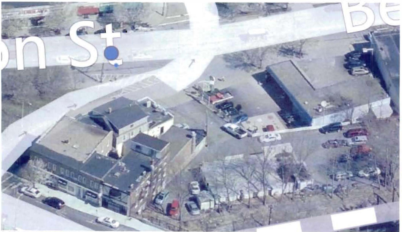
8. Bing Aerial Ortho of Property Viewed from South