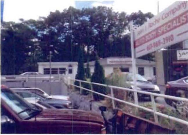
9. View Looking South at Site and Free-Standing Sign (also nonconforming)