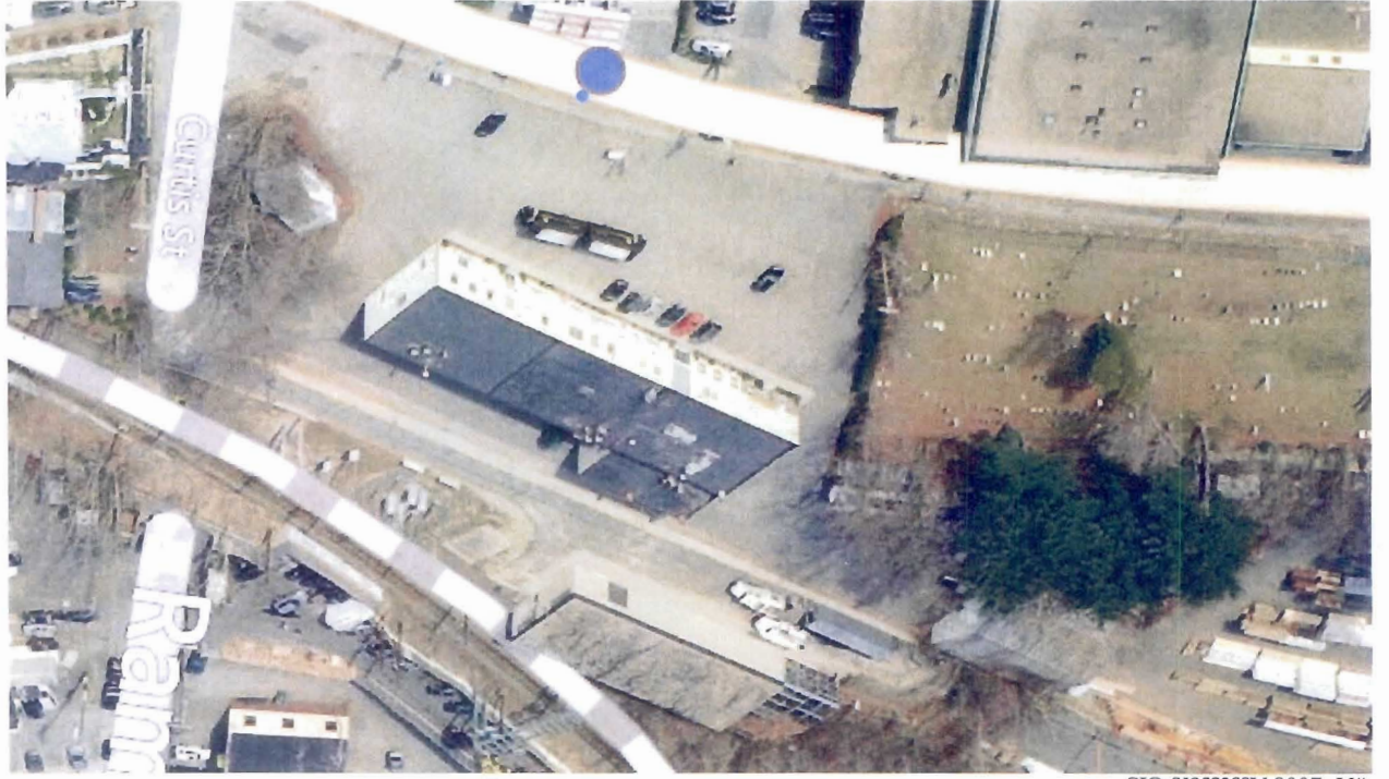
#B- Bing Map Aerial