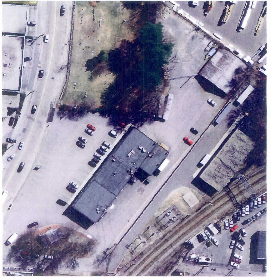
#A-2008 Assessors GIS