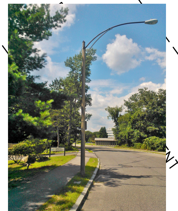
EXISTING "P1-4" FIXTURE

NOTE: TRIM TREE CANOPIES TO PREVENT CREATION OF SHADOWS IN PARKING AND DRIVING AREAS.