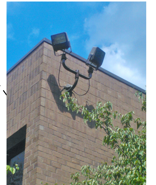
EXISTING "C1" FIXTURE PROPOSED "C2-3" FIXTURE