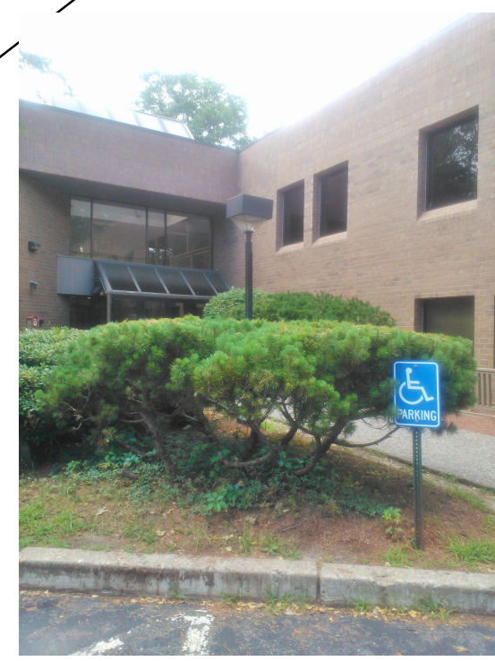
EXISTING "B1/D1" FIXTURE

NOTE: TRIM TREE CANOPIES TO PREVENT CREATION OF SHADOWS IN PARKING AND DRIVING AREAS.