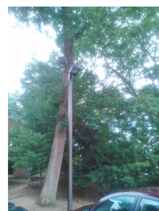
EXISTING "A3" FIXTURE PROPOSED "A4" FIXTURE