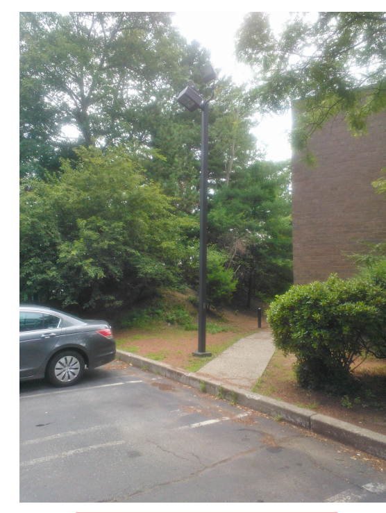
EXISTING "A1" FIXTURE

NOTE: THE EXISTING DIMENSIONAL REQUIREMENTS FOR PARKING LOT A AND PARKING LOT B HAVE BEEN APPROVED BY BOARD ORDER 325-06.