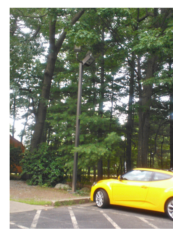
EXISTING "A2" FIXTURE (RELOCATED)