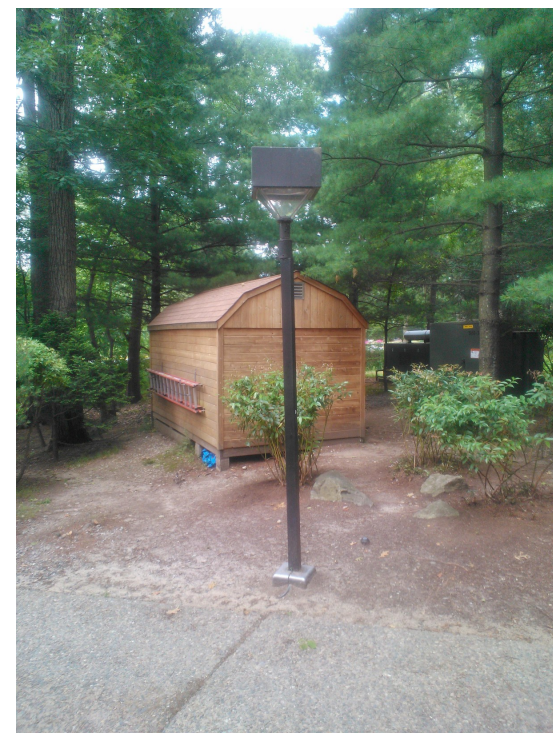
EXISTING "B2" FIXTURE