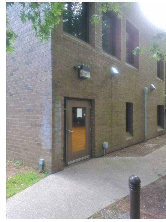
EXISTING "D2 & 3" FIXTURE