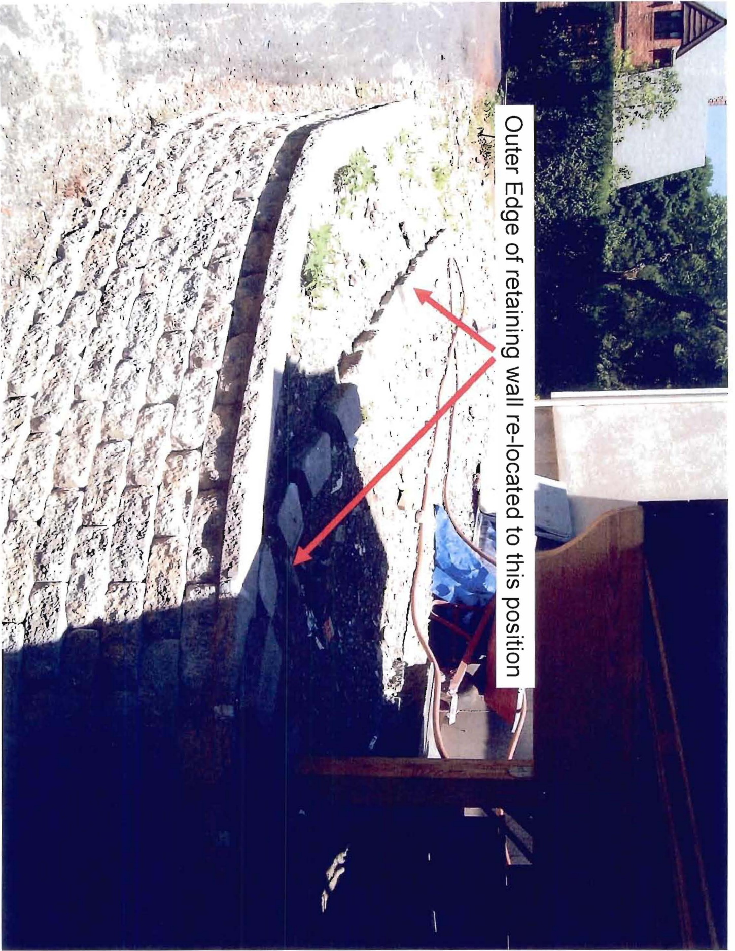
Outer Edge of retaining wall re-located to this position