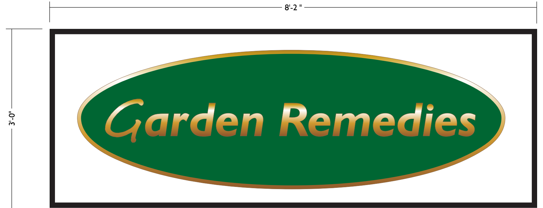
NON-ILLUMINATED SIGN PANEL