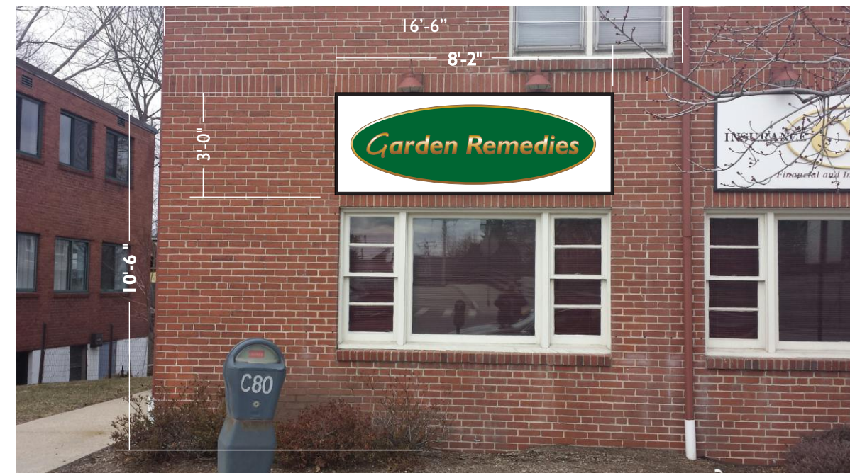
SCALE: 1/4" = 1'-0"

OVAL BACKER: 3/4" PVC PAINTED GREEN BORDER: 1/2" PVC PAINTED GOLD LETTERS: 1/2" PVC PAINTED GOLD