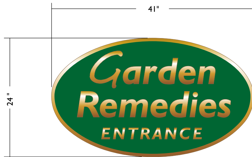
NON-ILLUMINATED SIGN PANEL