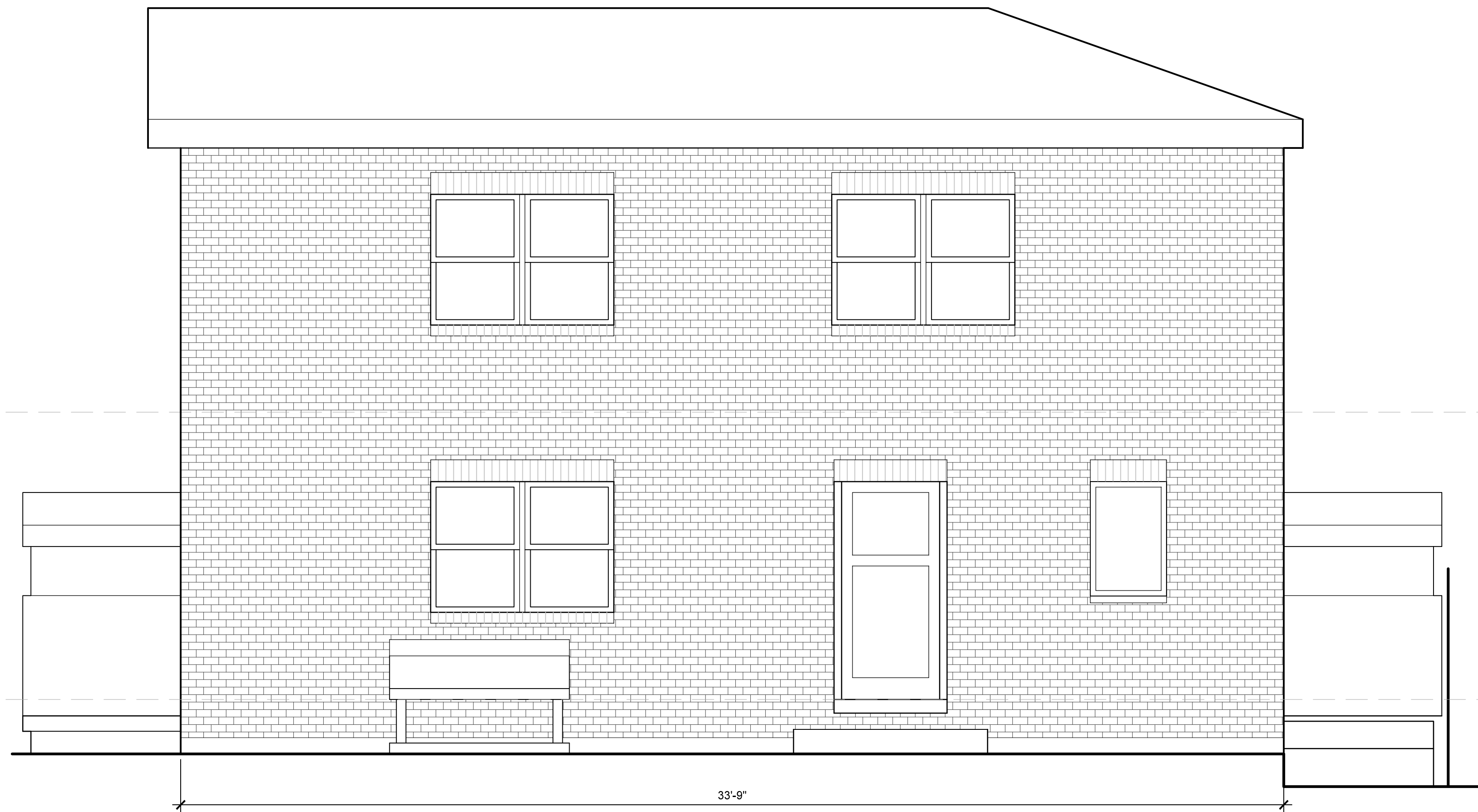
4 North Elevation SCALE: 3/8" = 1'-0"