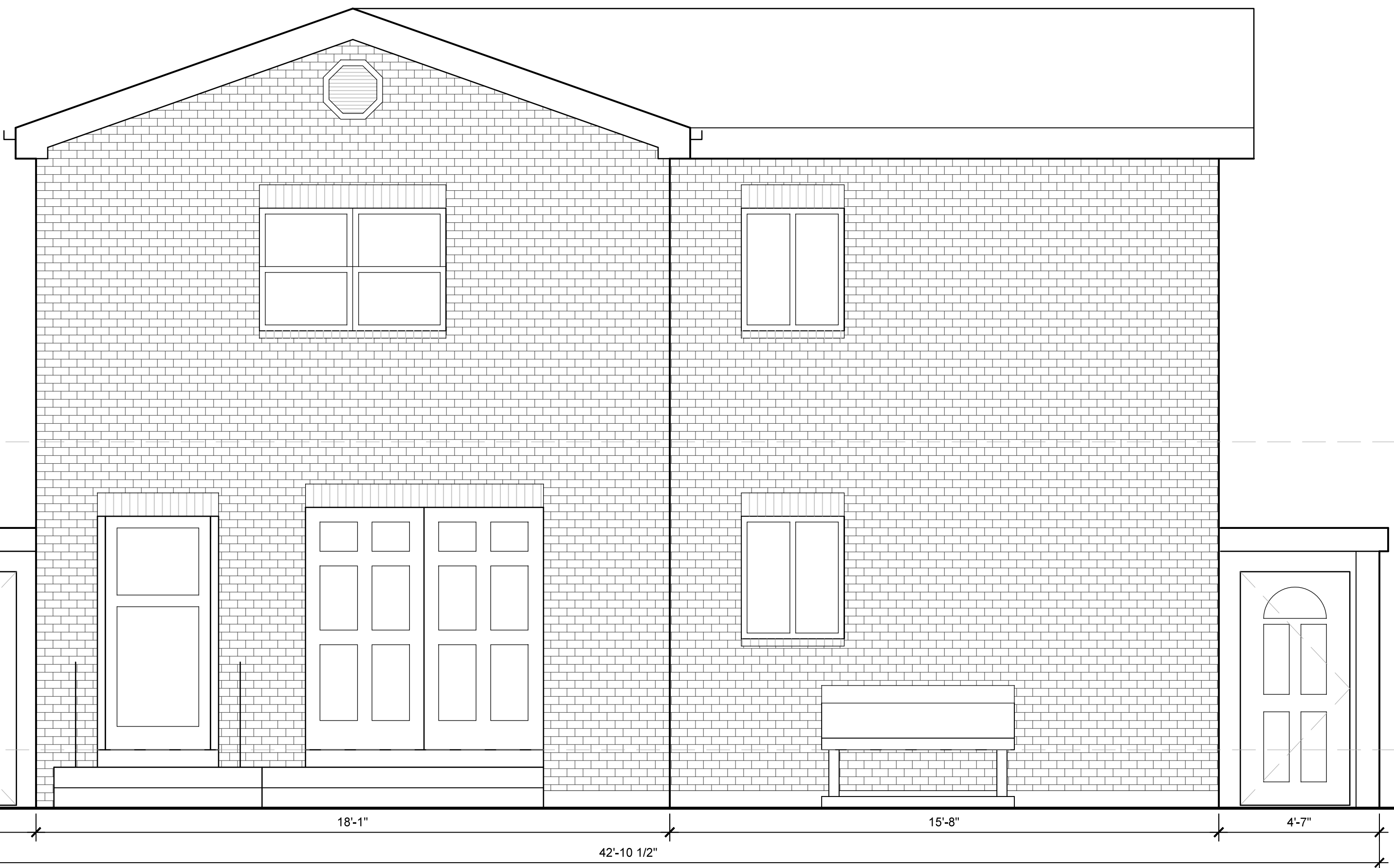
2 South Elevation SCALE: 3/8" = 1'-0"