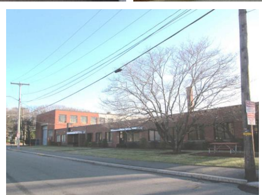
156 Oak St., 55 Tower Rd., 275-281 Needham St., 280 Needham St., and 160 Charlemont St.