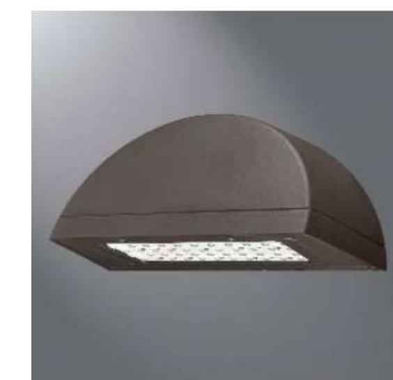
ISW IMPACT ELITE LED WEDGE