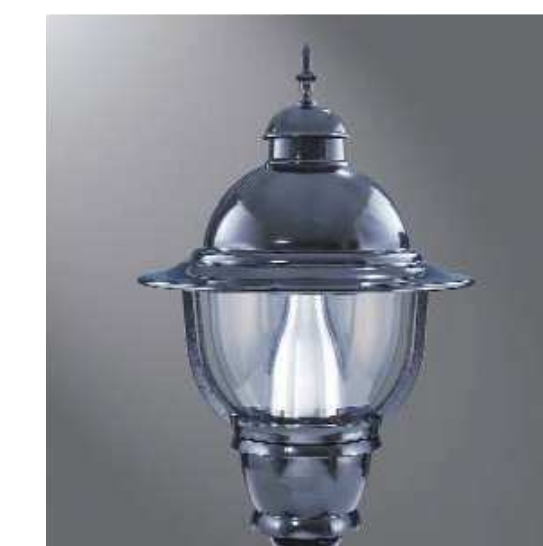
GAT-C GENERATION SERIES AVENUE CVL CUTOFF

1. PHOTOMETRIC CALCULATIONS PROVIDED BY CHARRON INC. APPLICATIONS/DESIGN.