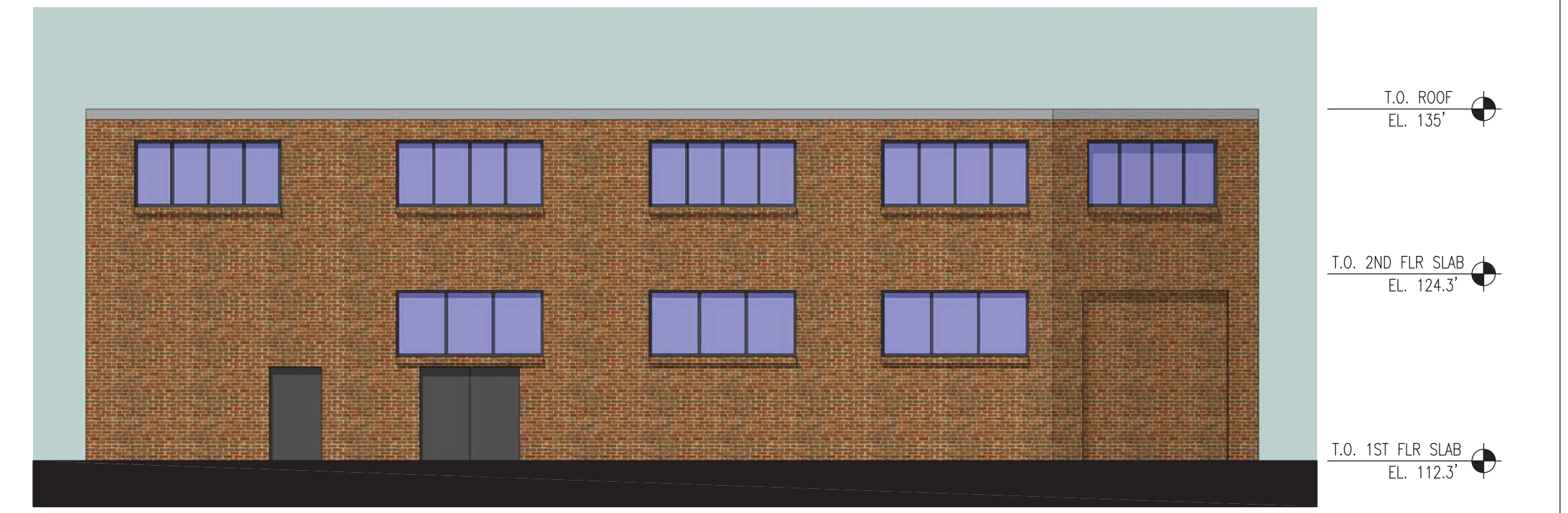
4 NORTH ELEVATION SCALE: 1/4"=1'-0"