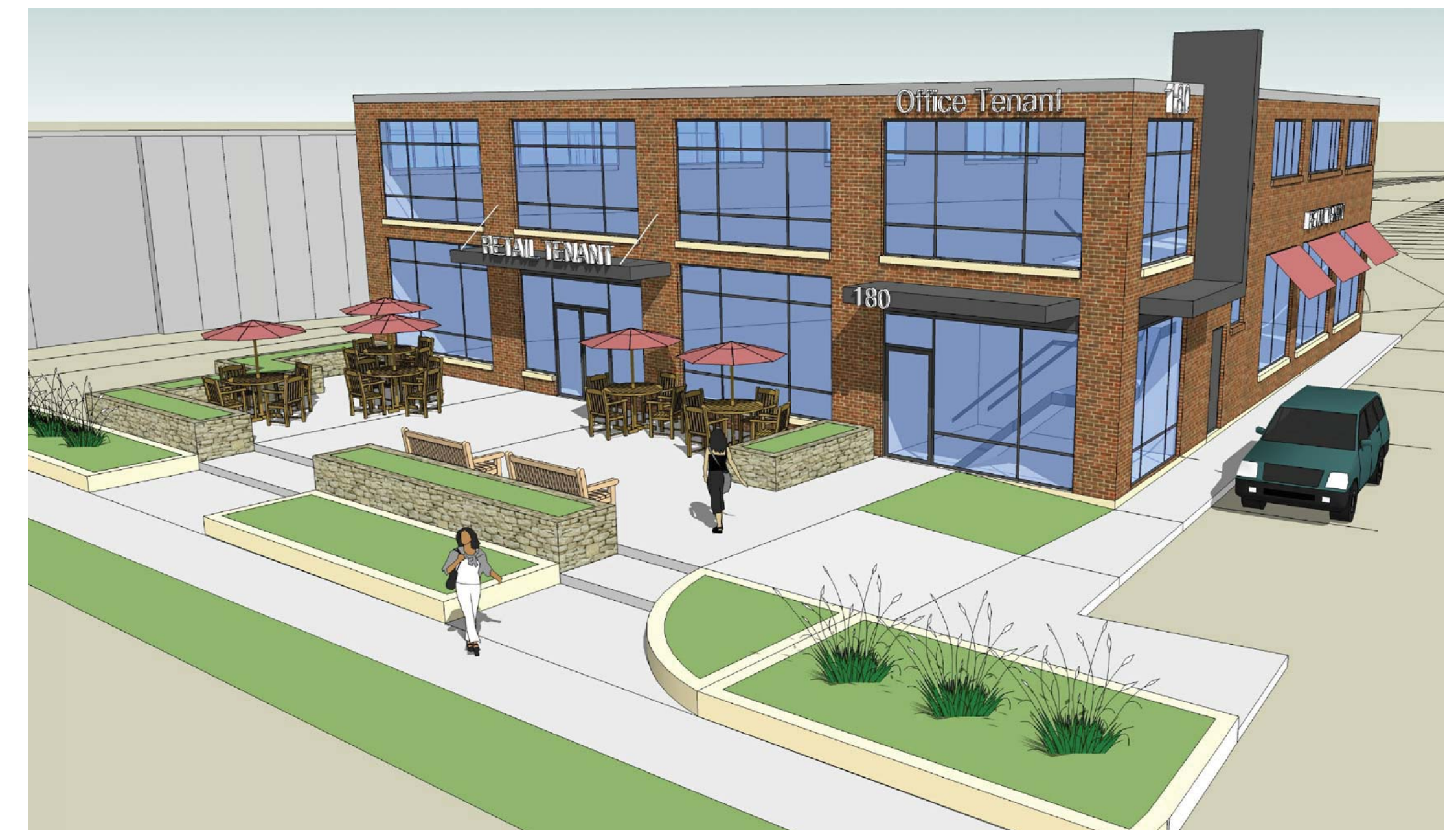
5 BIRD'S EYE VIEW SCALE: NTS