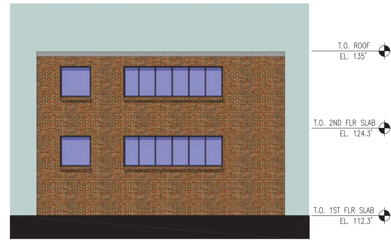
3 EAST ELEVATION SCALE: 1/8"=1'-0"