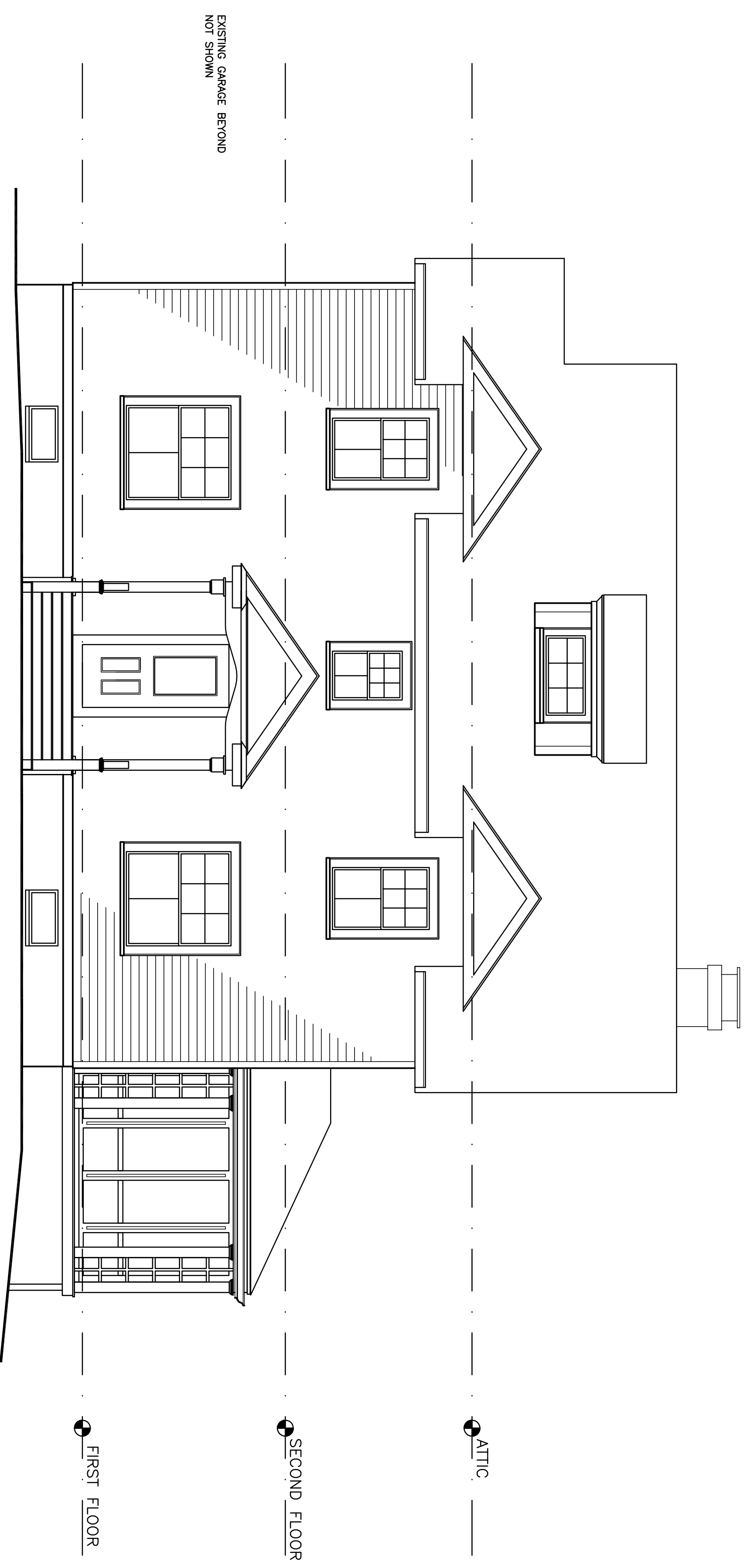
3 EXISTING FRONT ELEVATION 1/4"=1'-0"