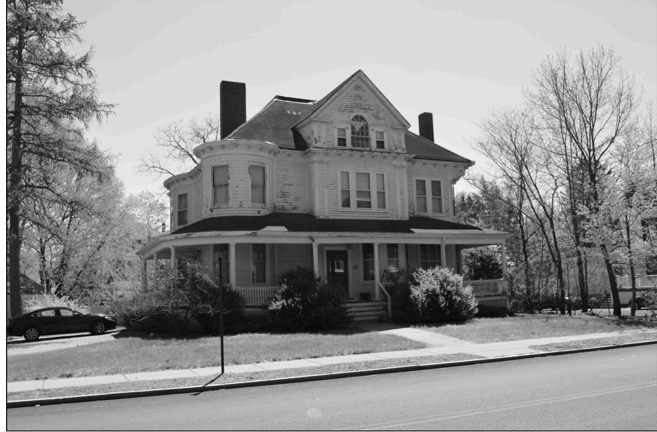
146 LINCOLN STREET

D. L. GROSE + ASSOCIATES 267 SINGLETARY LANE • FRAMINGHAM • (508) 872-9670