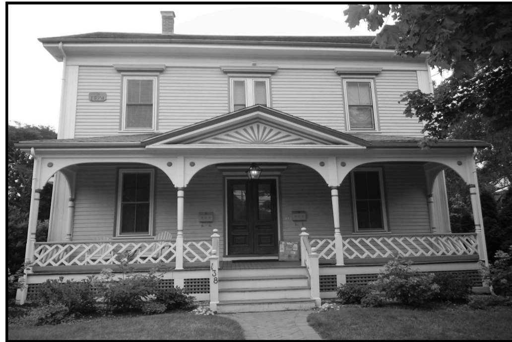
VIEW FROM NORTH (STREET VIEW)