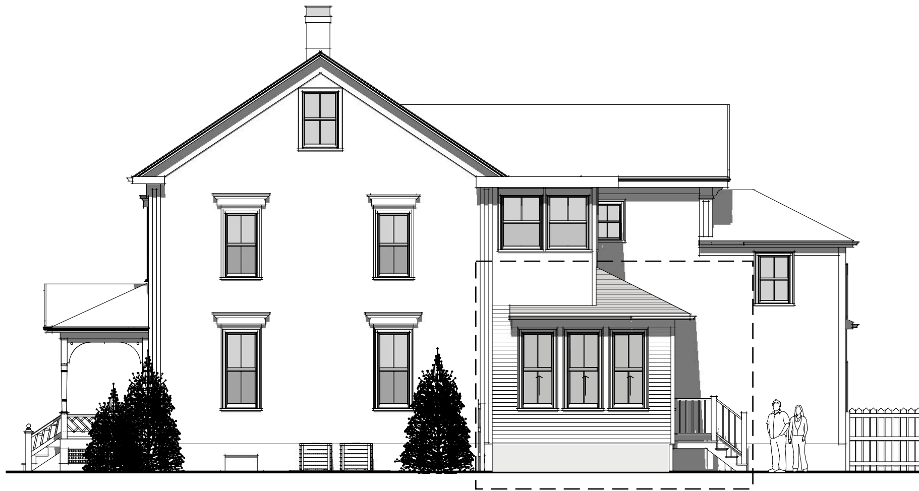
PROPOSED WEST ELEVATION 1/8"