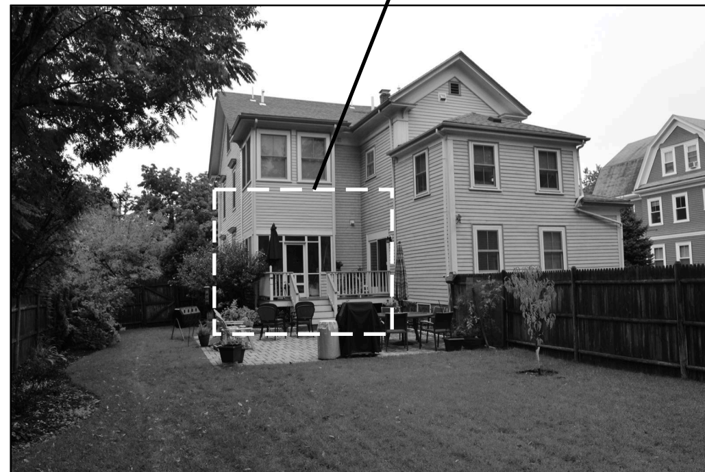
VIEW FROM SOUTH (BACK OF HOUSE)