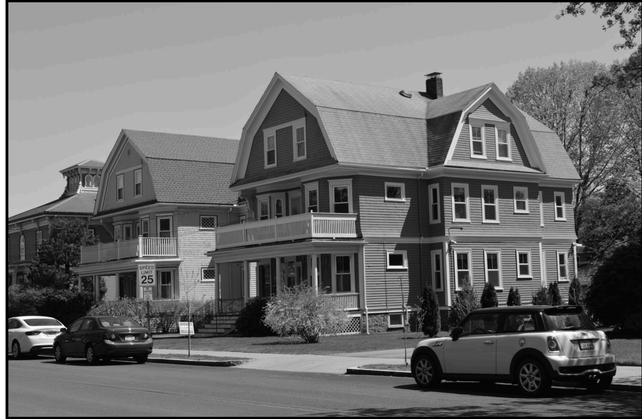
130 LINCOLN STREET