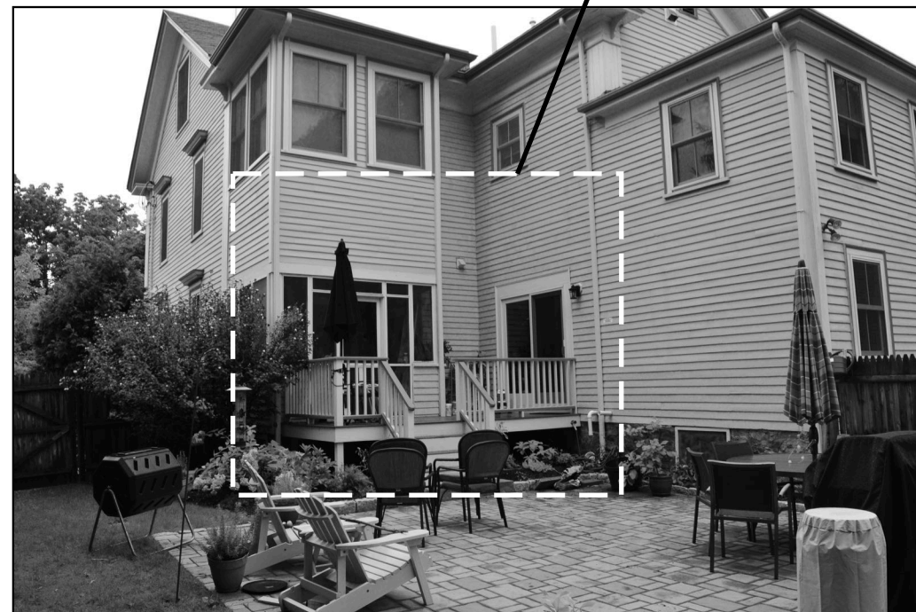
VIEW FROM SOUTHWEST (BACK OF HOUSE)