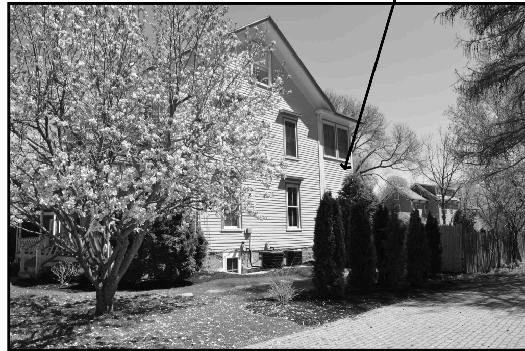
VIEW FROM NORTHWEST