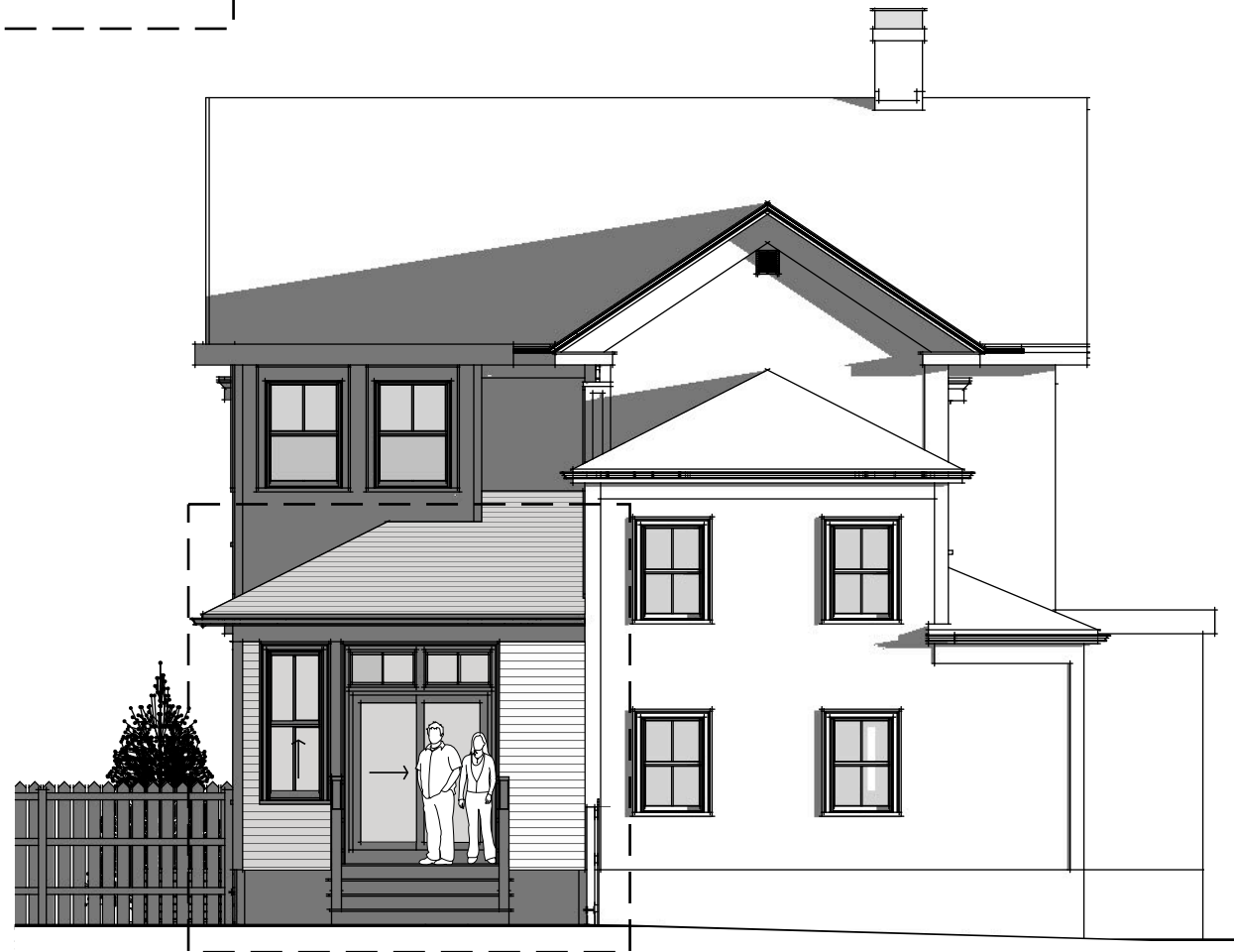
PROPOSED SOUTH ELEVATION 1/8"

D. L. GROSE + ASSOCIATES 267 SINGLETARY LANE • FRAMINGHAM • (508) 872-9670