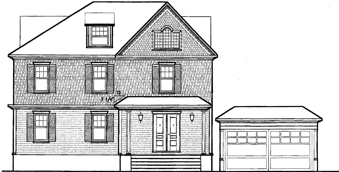
1 STREET FRONT ELEVATION SCALE: 1/8" = 1'-0"