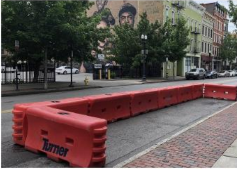
Water-filled jersey barriers, min. 32" high - To be filled by Licensee

The following items are shared as examples of acceptable barriers only.