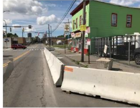
Concrete jersey barriers, min. 32" high