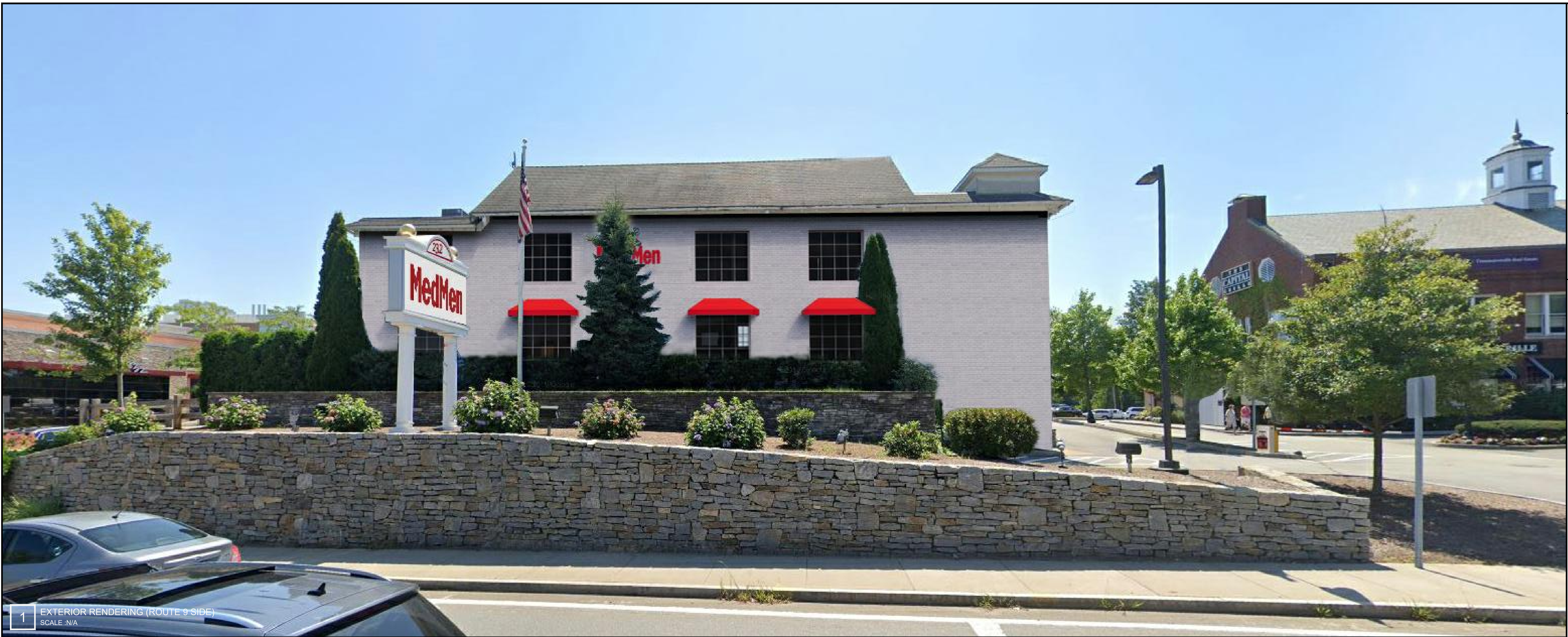
1 EXTERIOR RENDERING (ROUTE 9 SIDE) SCALE :N/A