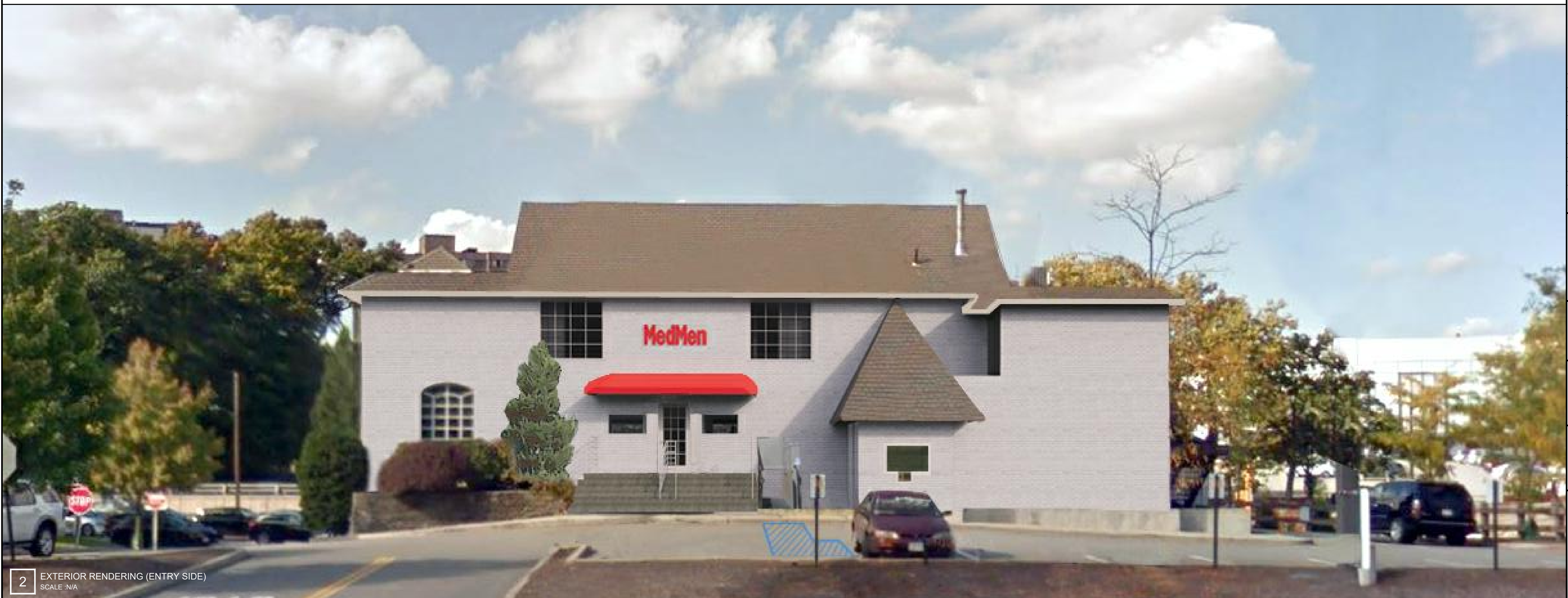
2 EXTERIOR RENDERING (ENTRY SIDE) SCALE :N/A