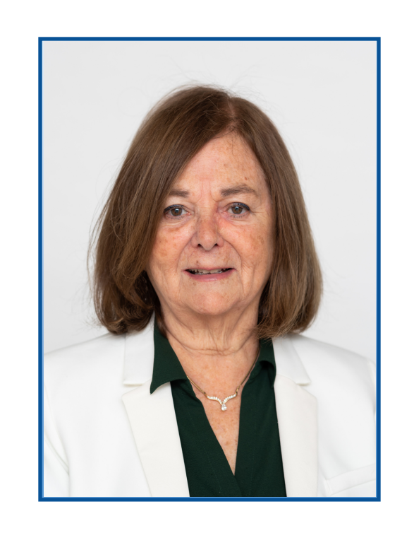
President of the City Council Susan Albright