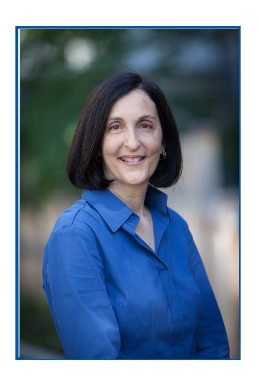
Mayor <a href="Ruthanne Fuller">Ruthanne Fuller</a>