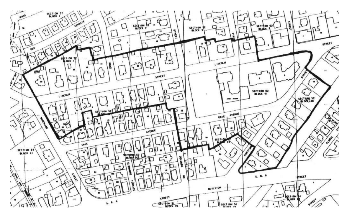
Newton Highlands National Register Historic District (1986)