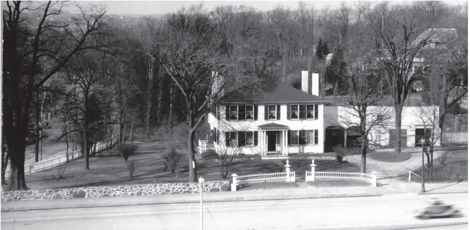
Photo of Jackson Homestead, ca. 1940s