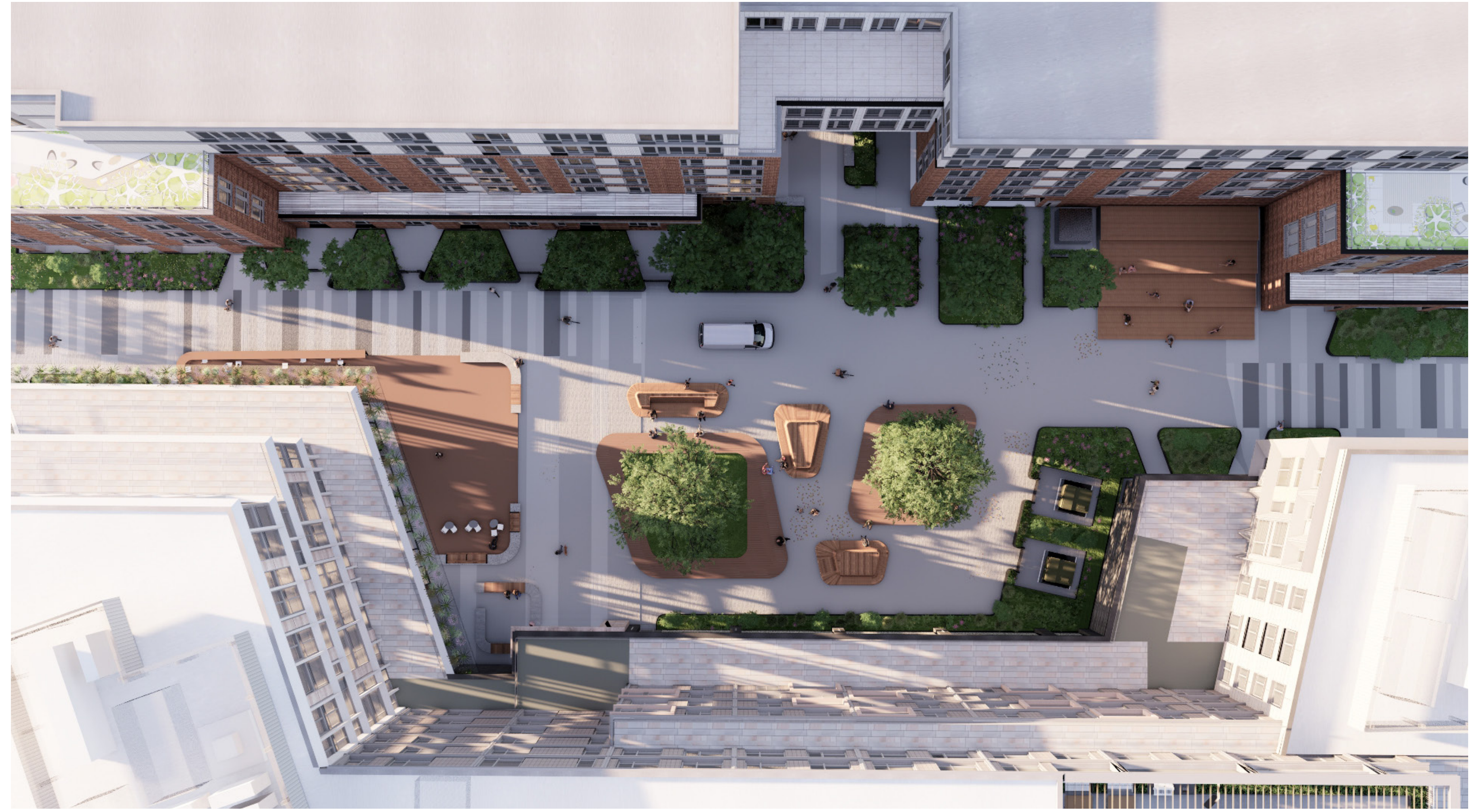
THE NORTHLAND NEWTON DEVELOPMENT