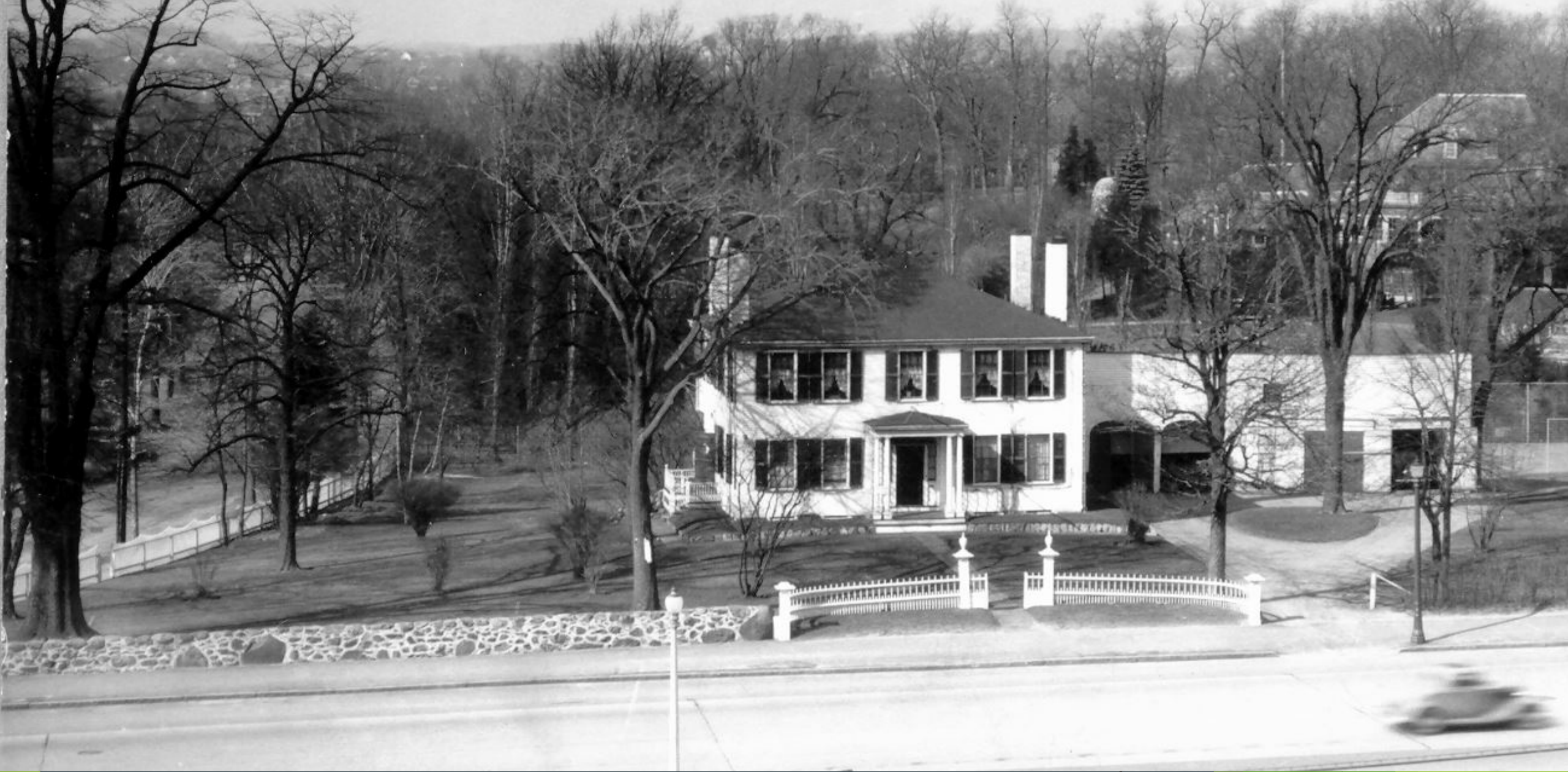
Photo of Jackson Homestead, ca. 1940s