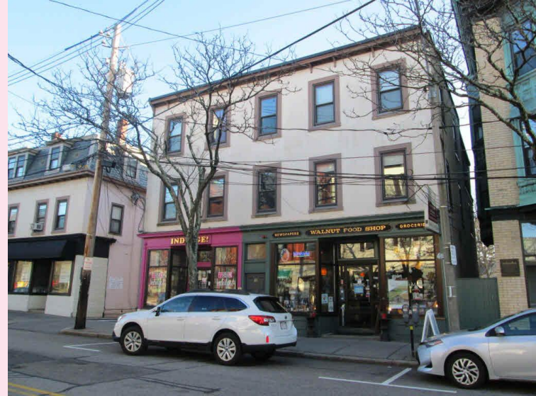
Live-Work Building / Newton Highlands