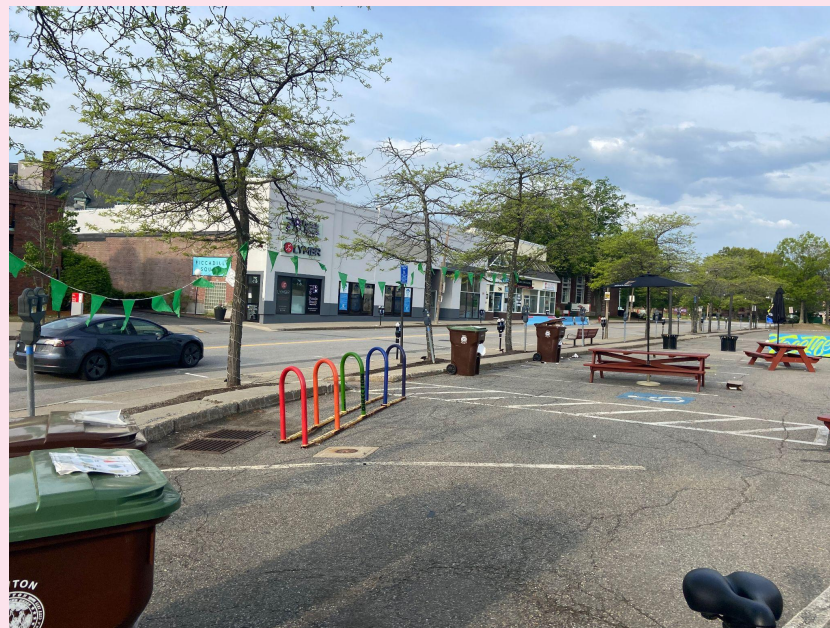
Newton Alfresco

The shared dining space means that my family and friends can each get food from their favorite restaurant (or bring it from home if they are picky) and we can all share a meal together and bring our dog, too!