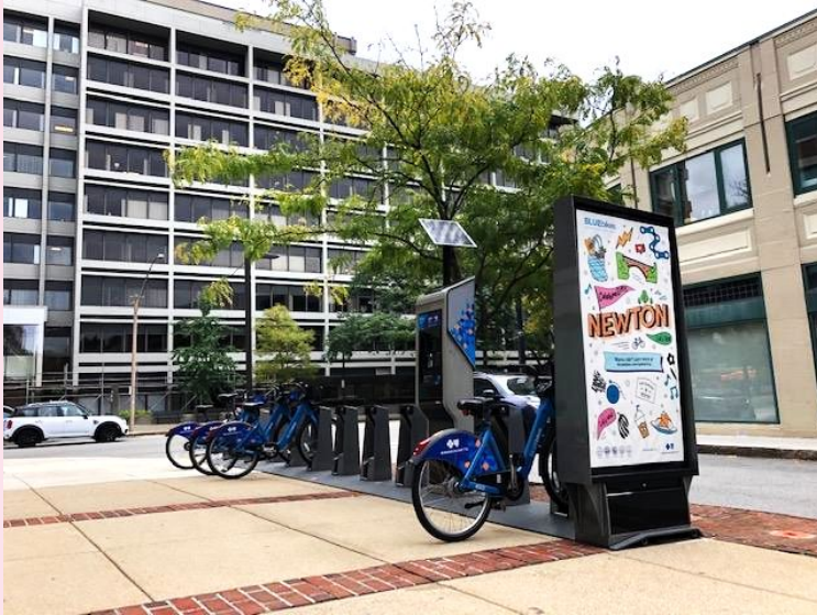
Blue Bikes / Newton Corner