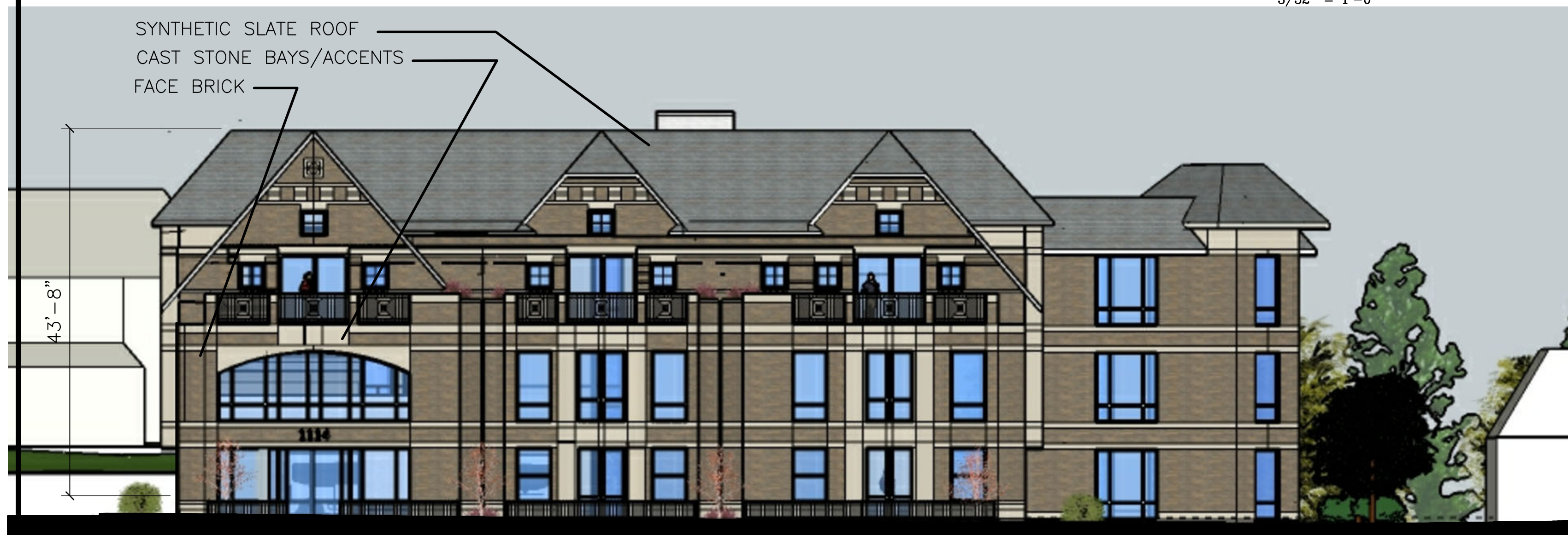
NORTH ELEVATION - BEACON STREET