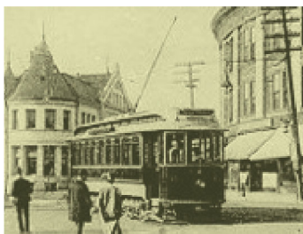
Nonantum Sq / Newton Savings Bank