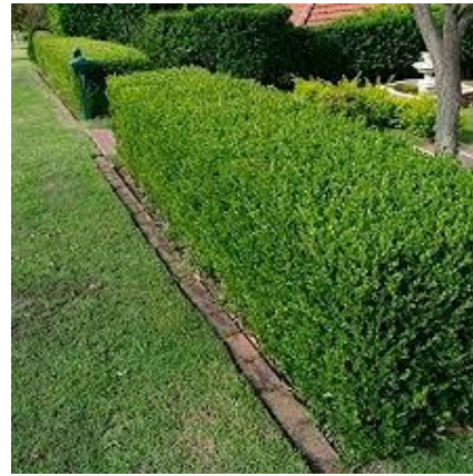
BOXWOOD HEDGE (11)