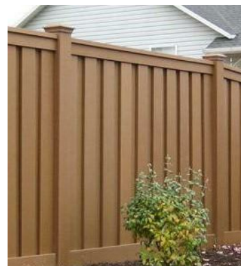
6' COMPOSITE FENCE