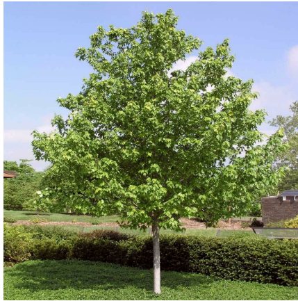
MAPLE (3) 6-8" CALIPER