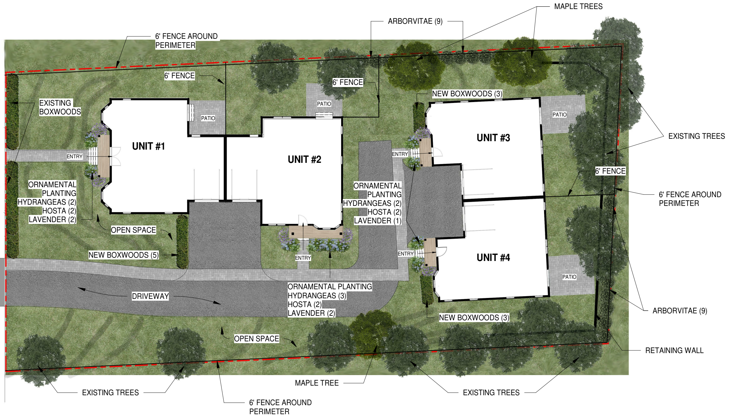
LANDSCAPE PLAN - NTS