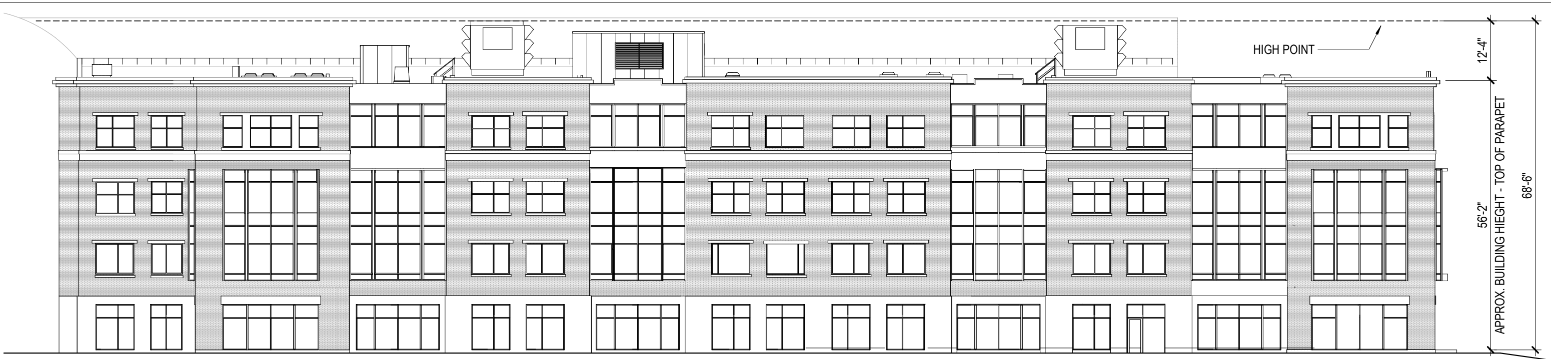
1 EXISTING EXTERIOR ELEVATION - SOUTH