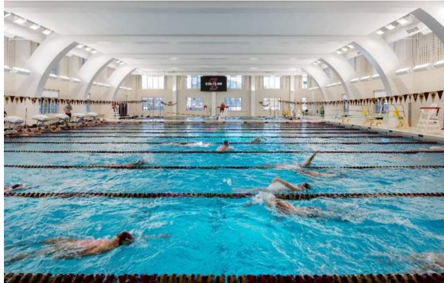
50-meter , 10 lane with short course