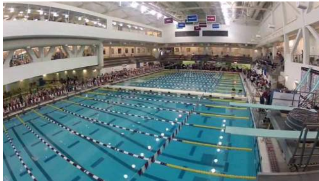
MIT Pool, 10 lane 50-meter natatorium