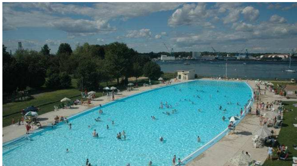
Pierce Island Outdoor Pool in Portsmouth, NH