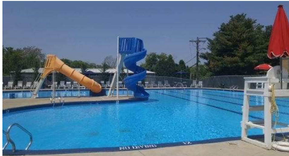
Waltham YMCA Pool