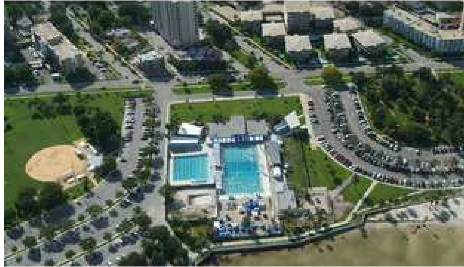
Northshore Aquatic Center, St. Petersburg, FL