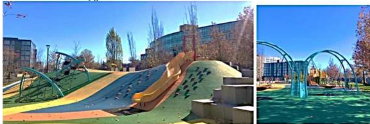
Large Park Complex; playground has an integral splash pad component.