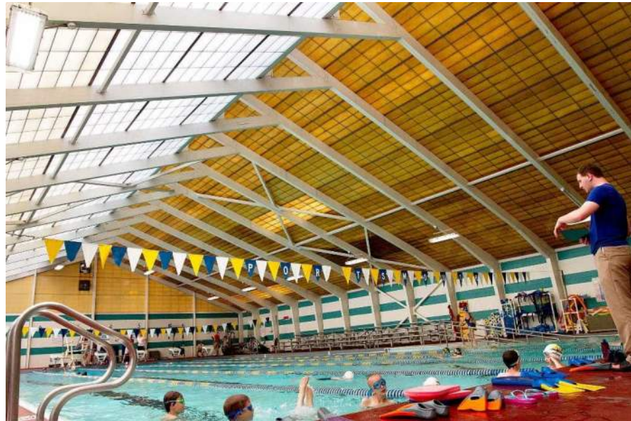
This is the City's indoor pool that has a retractable Kalwall roof. This was "Structures Unlimited" structure, a NH based company.

BH+A Comments: There are two pools in Portsmouth: