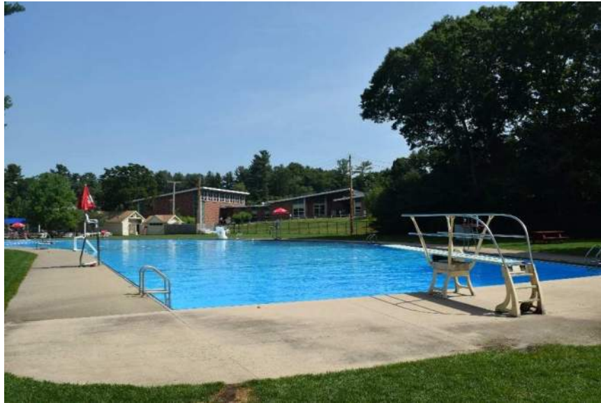
Memorial Pool in Weston, MA