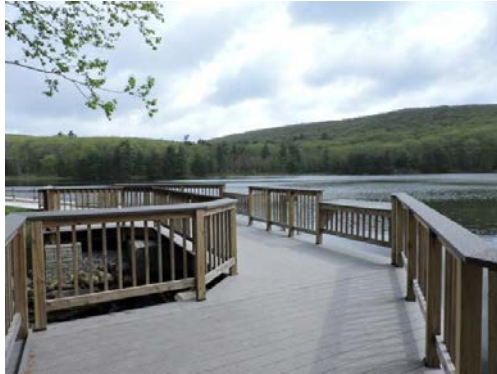
The accessible fishing pier at Beartown State Forest.

https://www.mass.gov/service-details/accessible-fishing-piers-and-platforms