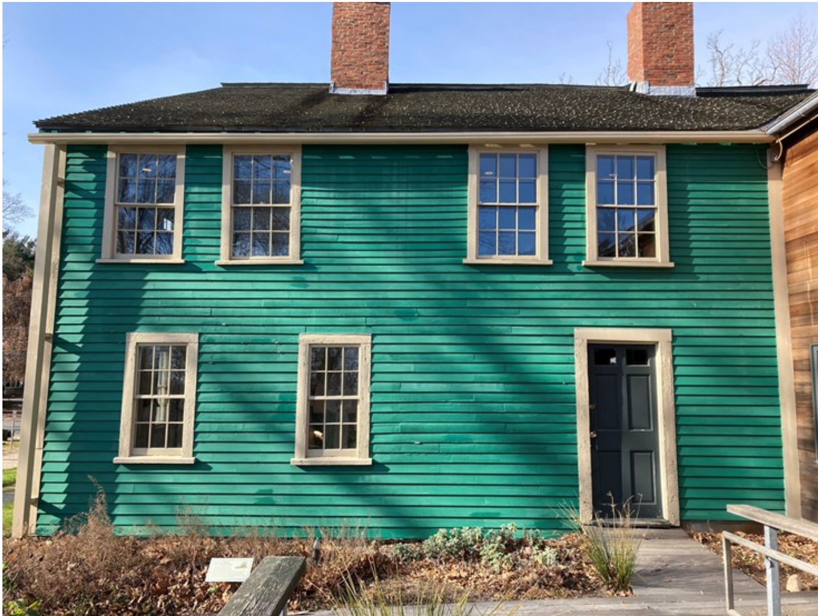
After photo, South Elevation, December 2021