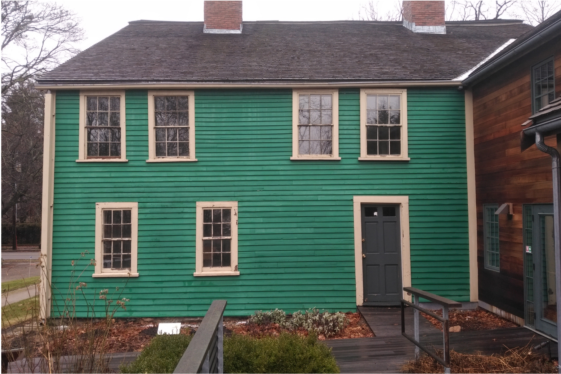
Before photo, South Elevation, 2019